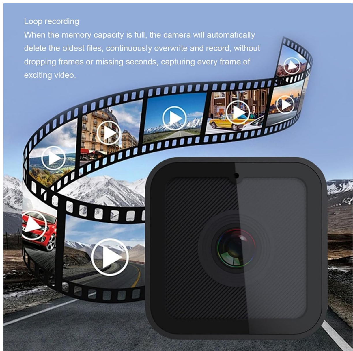
Image: An illustration depicting the loop recording process, where older video segments are replaced by new ones once the memory card capacity is reached.

The camera features loop recording. When the memory card is full, the camera will automatically overwrite the oldest files, ensuring continuous recording without interruption. This function prevents the camera from stopping recording due to a full memory card.