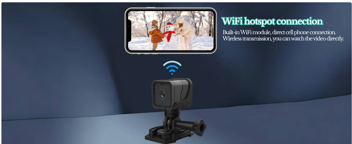
Image: A smartphone screen displaying a live view from the Bewinner Bike Camera, illustrating the wireless connection feature.

To view footage in real-time, download the dedicated mobile application (refer to the packaging or included documentation for app name/QR code). Turn on the camera's WiFi. Connect your smartphone to the camera's WiFi hotspot. Open the app to establish a connection and view the live feed.