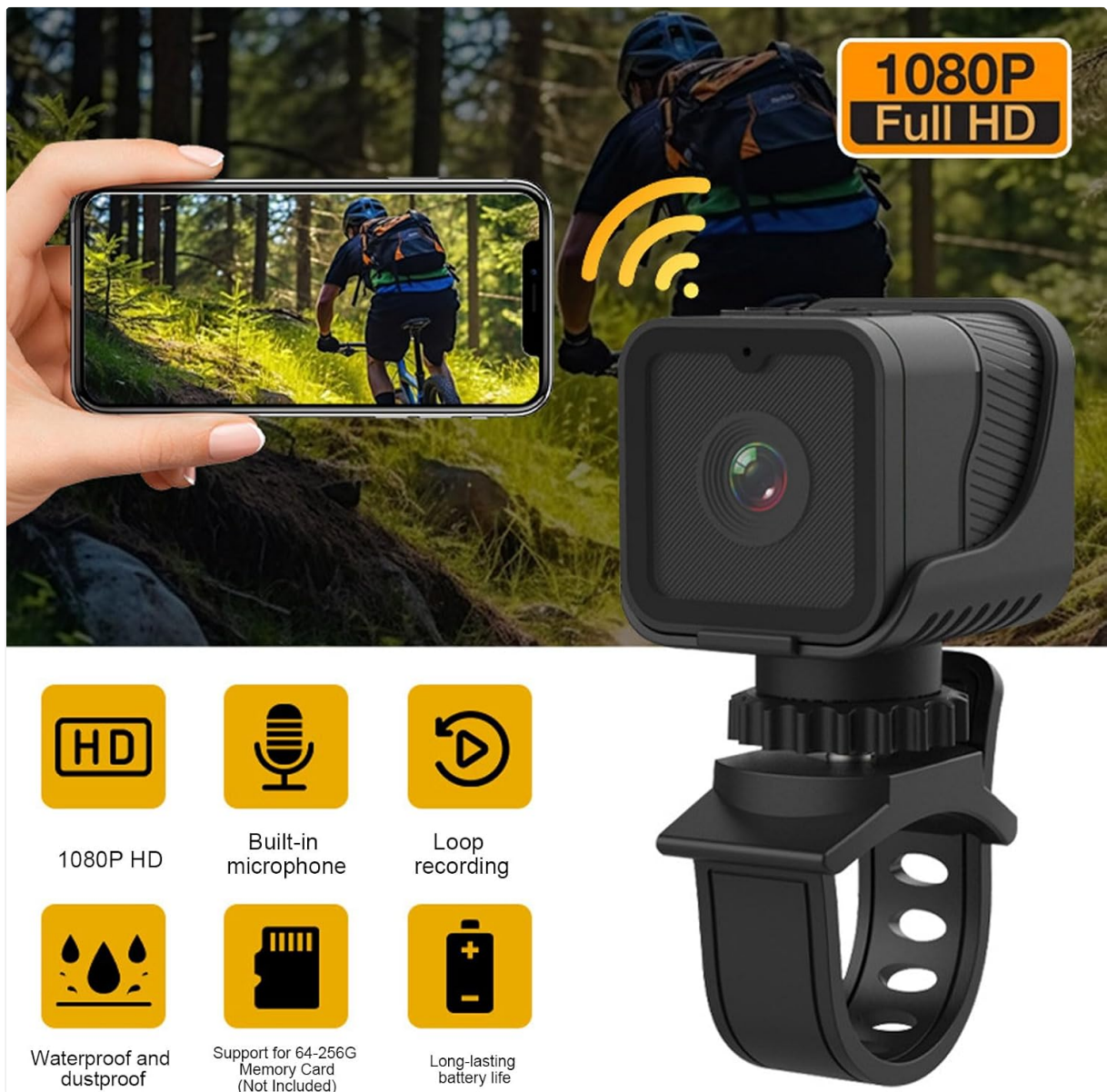
Image: The Bewinner Bike Camera displaying its live feed on a smartphone, highlighting its real-time interconnection feature.

The camera supports charging while recording, loop recording, and offers real-time interconnection with a mobile application for live viewing without using mobile data. Its adjustable rotatable mounting bracket enhances versatility for various recording angles, especially during night rides.