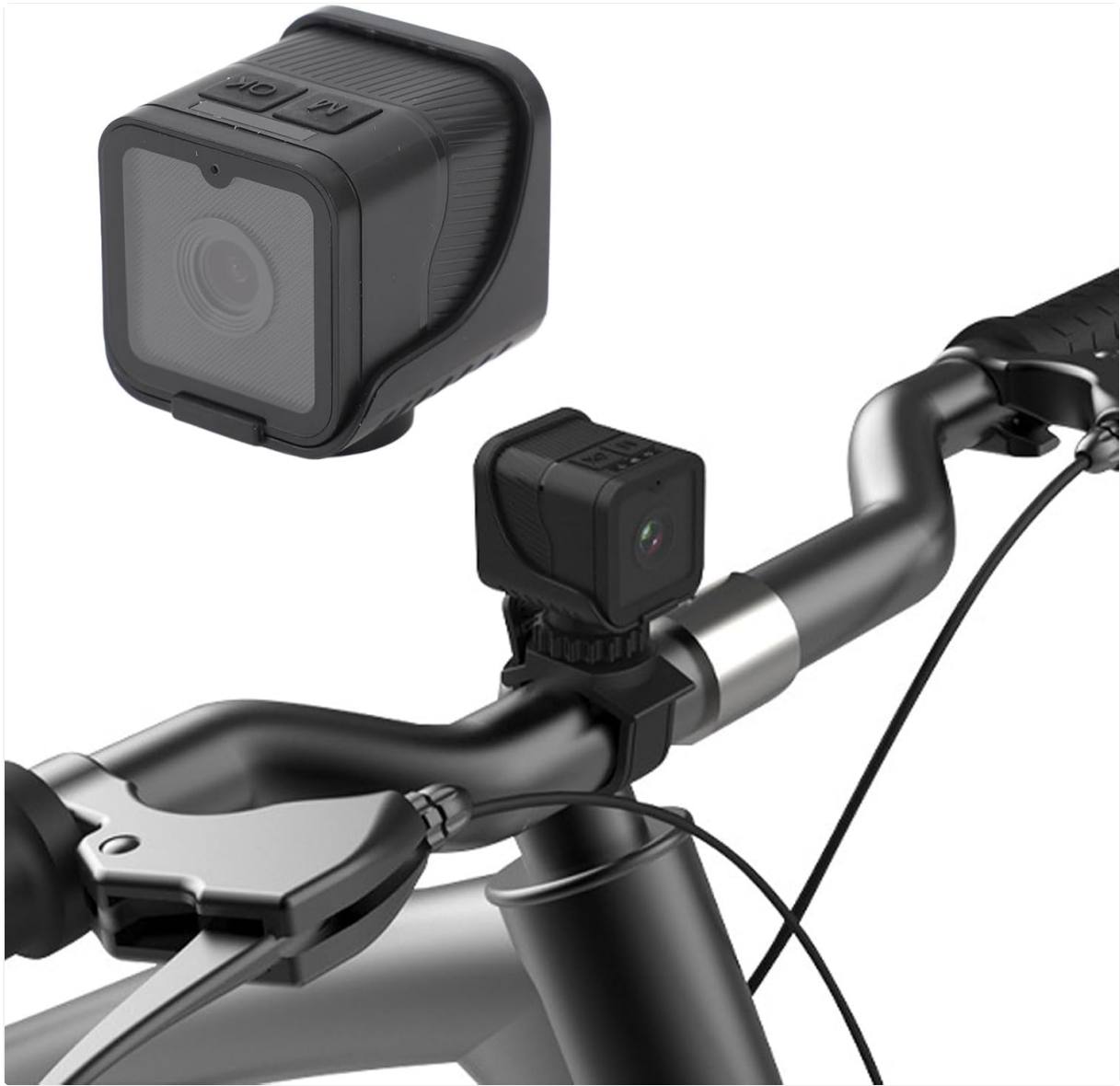
Image: The Bewinner Bike Camera securely mounted on bicycle handlebars, demonstrating a typical installation scenario.