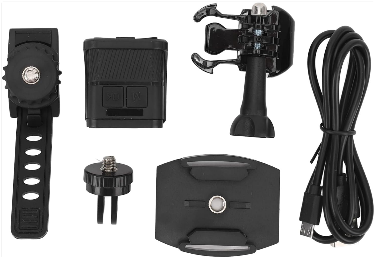
Image: All included components of the Bewinner Bike Camera package, including the camera, various mounts, and charging cable.