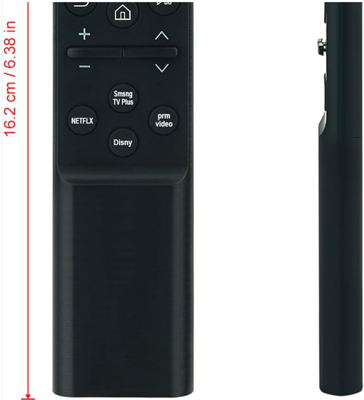
A visual representation of the remote control's physical dimensions, indicating a length of 16.2 cm (6.38 inches) and a width of 3.5 cm (1.38 inches).