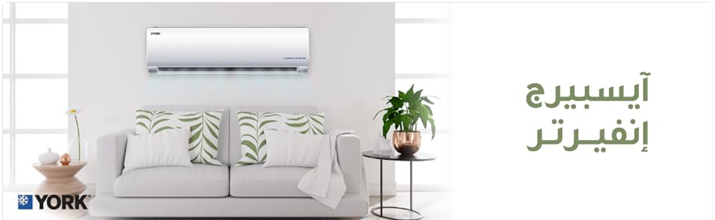
Image: YORK Iceberg Inverter Air Conditioner indoor unit installed in a living room setting.

This manual provides essential information for the safe and efficient operation, installation, and maintenance of your YORK Iceberg Split Inverter Air Conditioner. Please read it thoroughly before using the appliance and keep it for future reference.