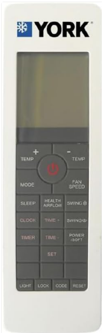
Image: The remote control for the YORK Iceberg Split Inverter Air Conditioner.