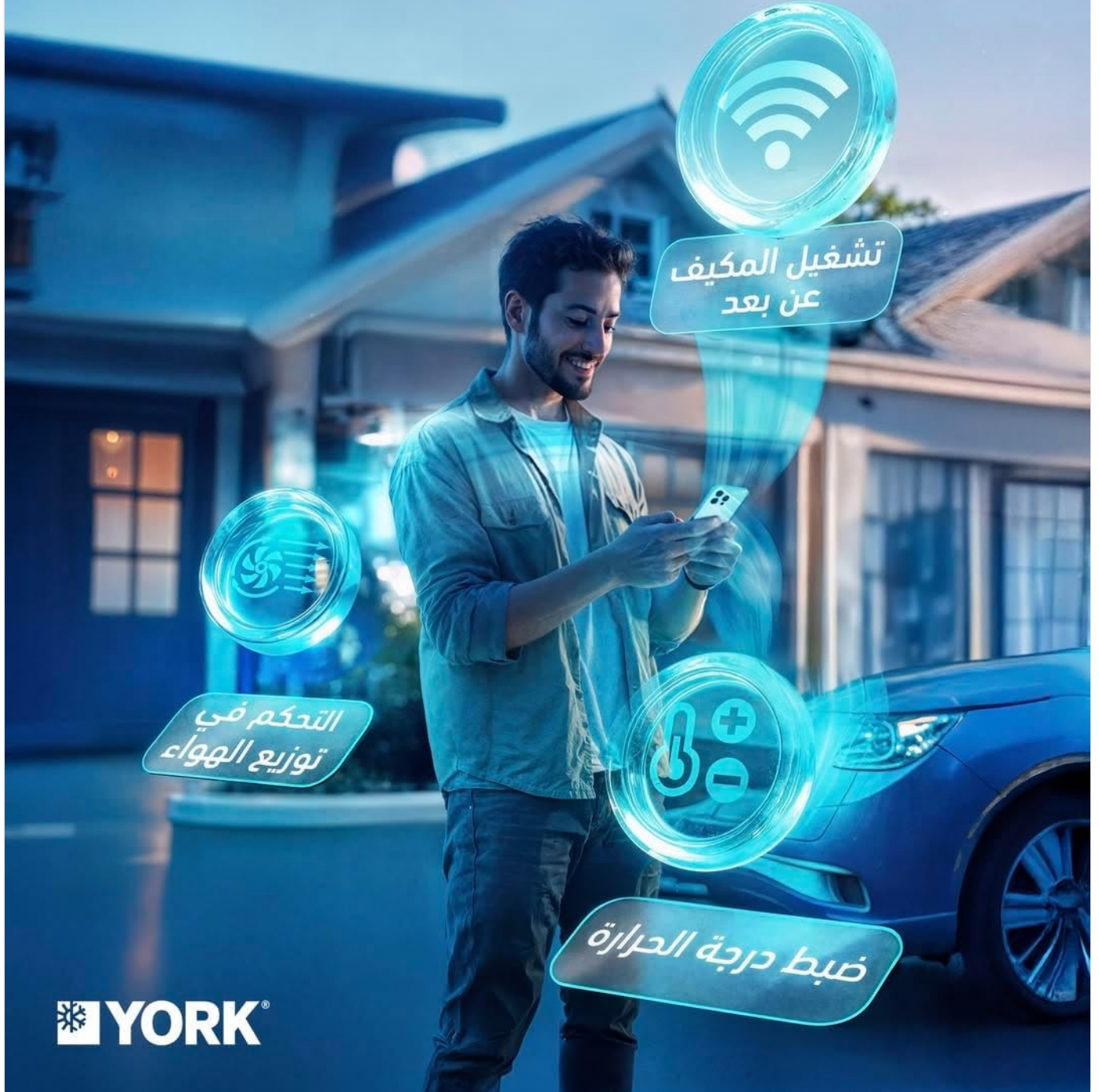
Image: A person using a smartphone to control the air conditioner, illustrating the Wi-Fi control feature.