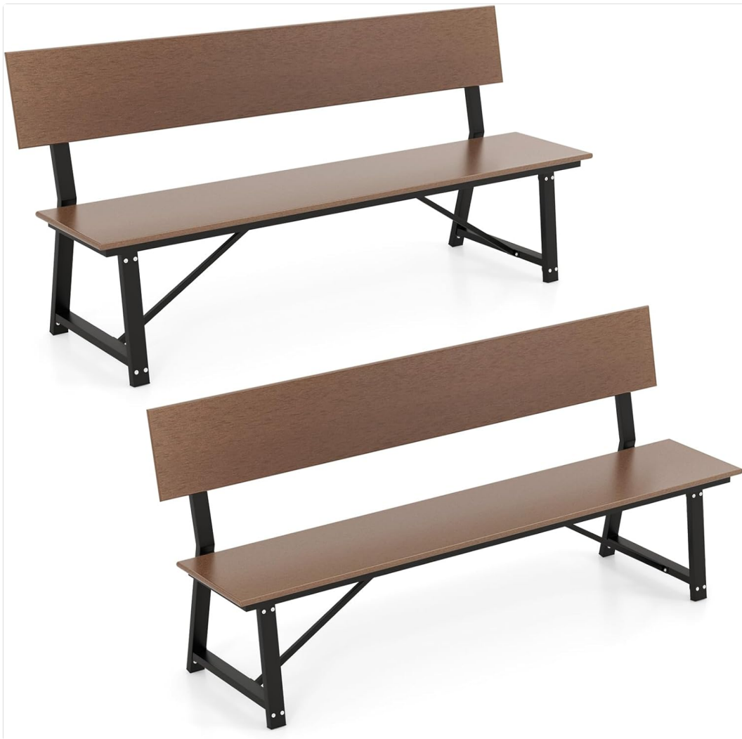
Image: A front-angle view of two fully assembled Tangkula 72-inch Outdoor Benches, showcasing their design and brown finish.