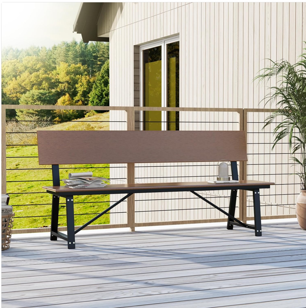
Image: A view from the side of the bench, showing the backrest being attached to the metal frame supports.

Once all components are in place, gradually tighten all screws with the provided Allen wrench until secure. Do not overtighten to avoid stripping threads.