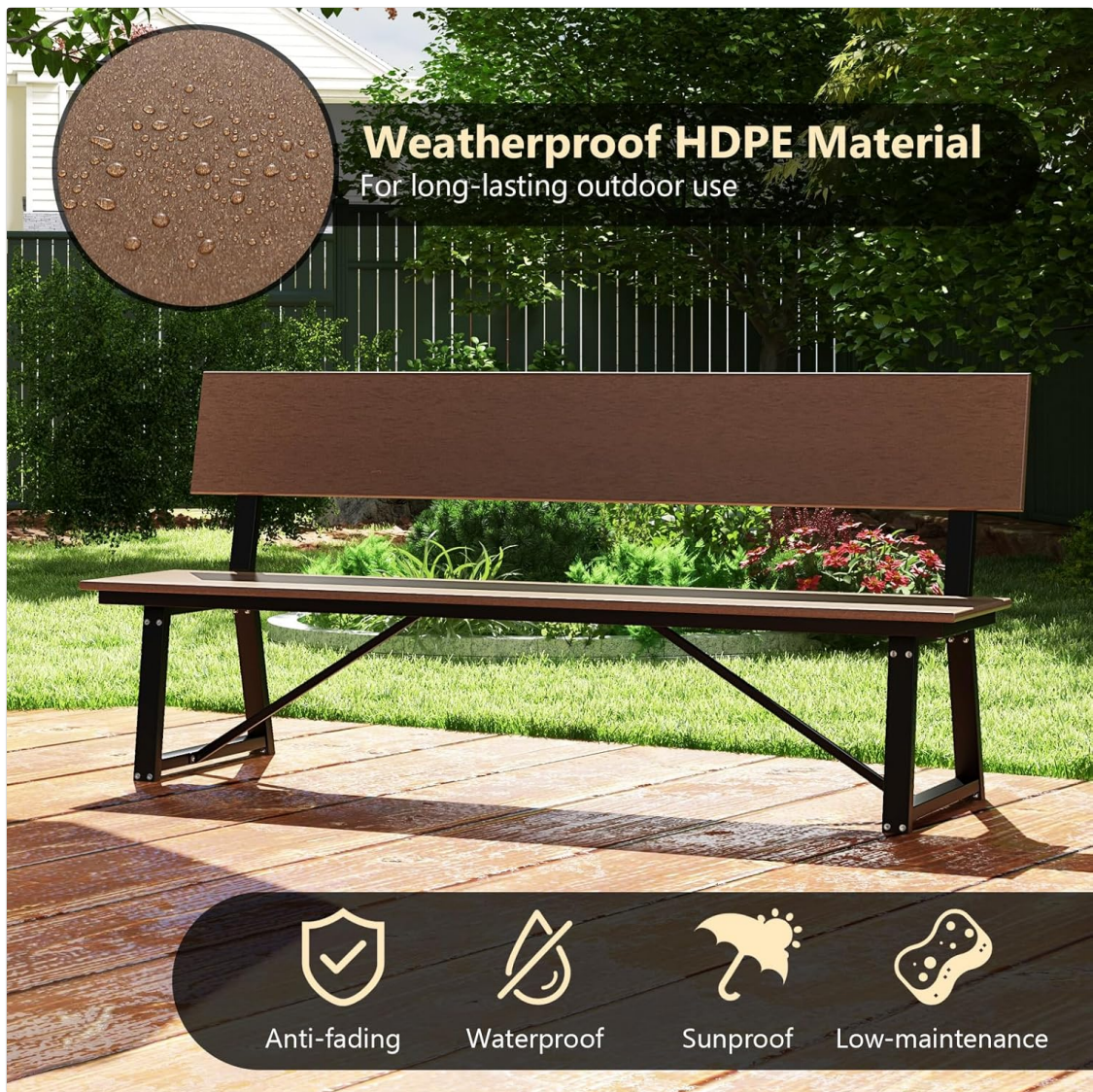
Image: The Tangkula 72-inch Outdoor Bench placed in a lush garden, demonstrating its suitability for outdoor environments.