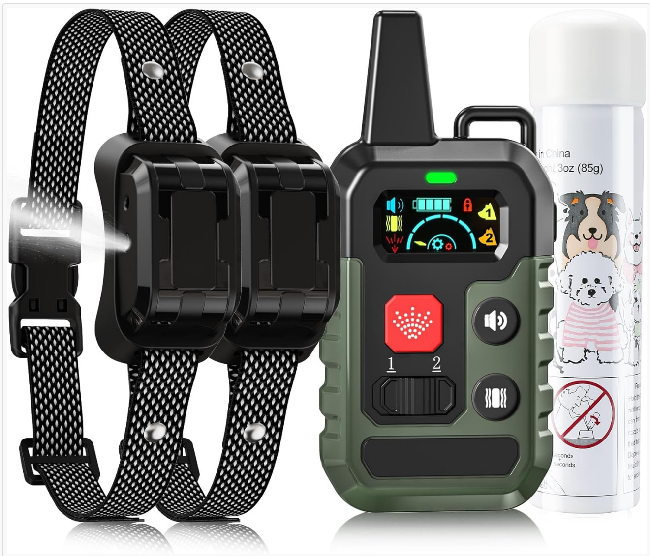
Image: Contents of the KDSZJDV T510 Citronella Training Collar package.