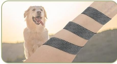
Nylon Collar has Strong Wear Resistance