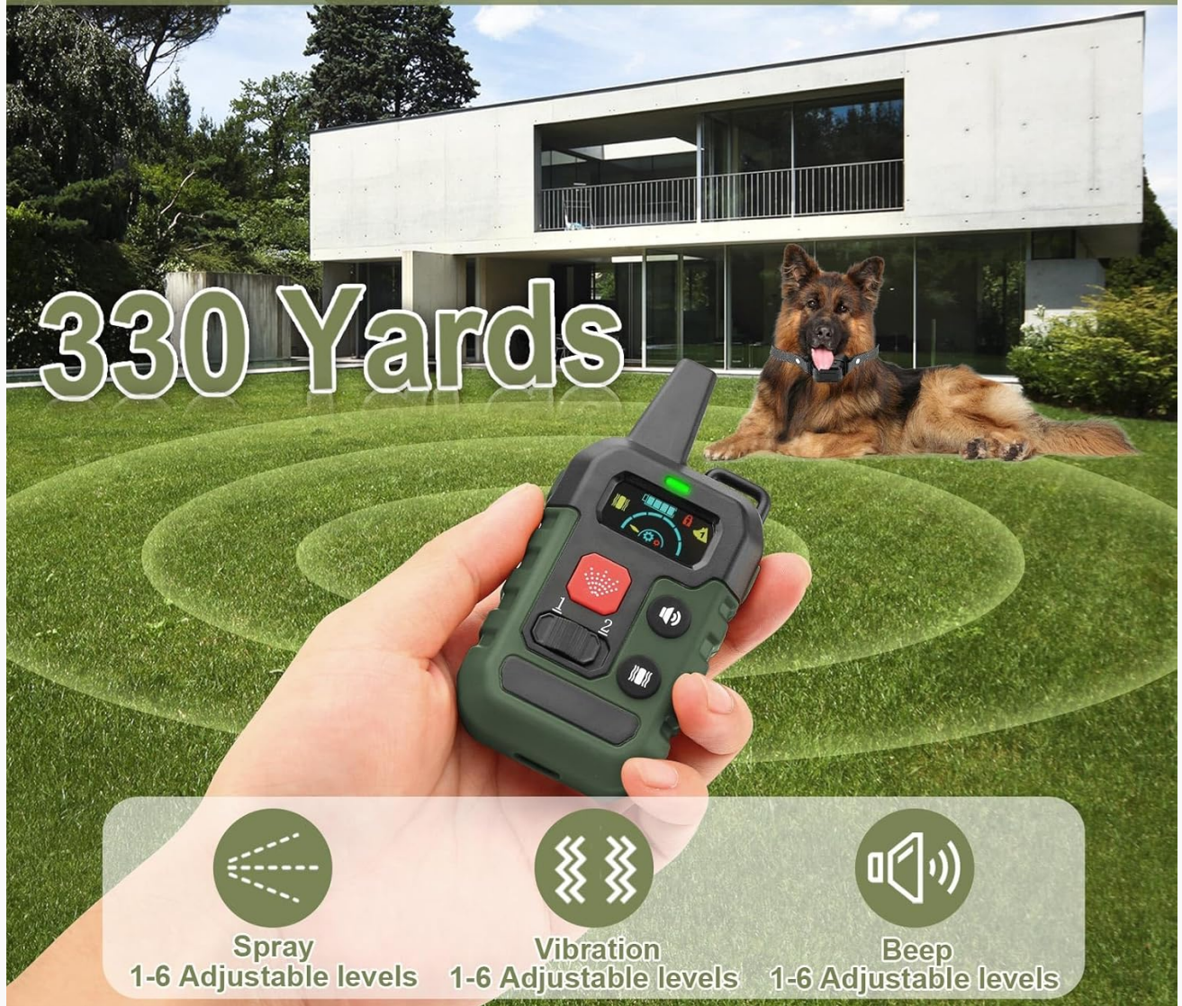
Image: Overview of the three training modes and adjustable levels.