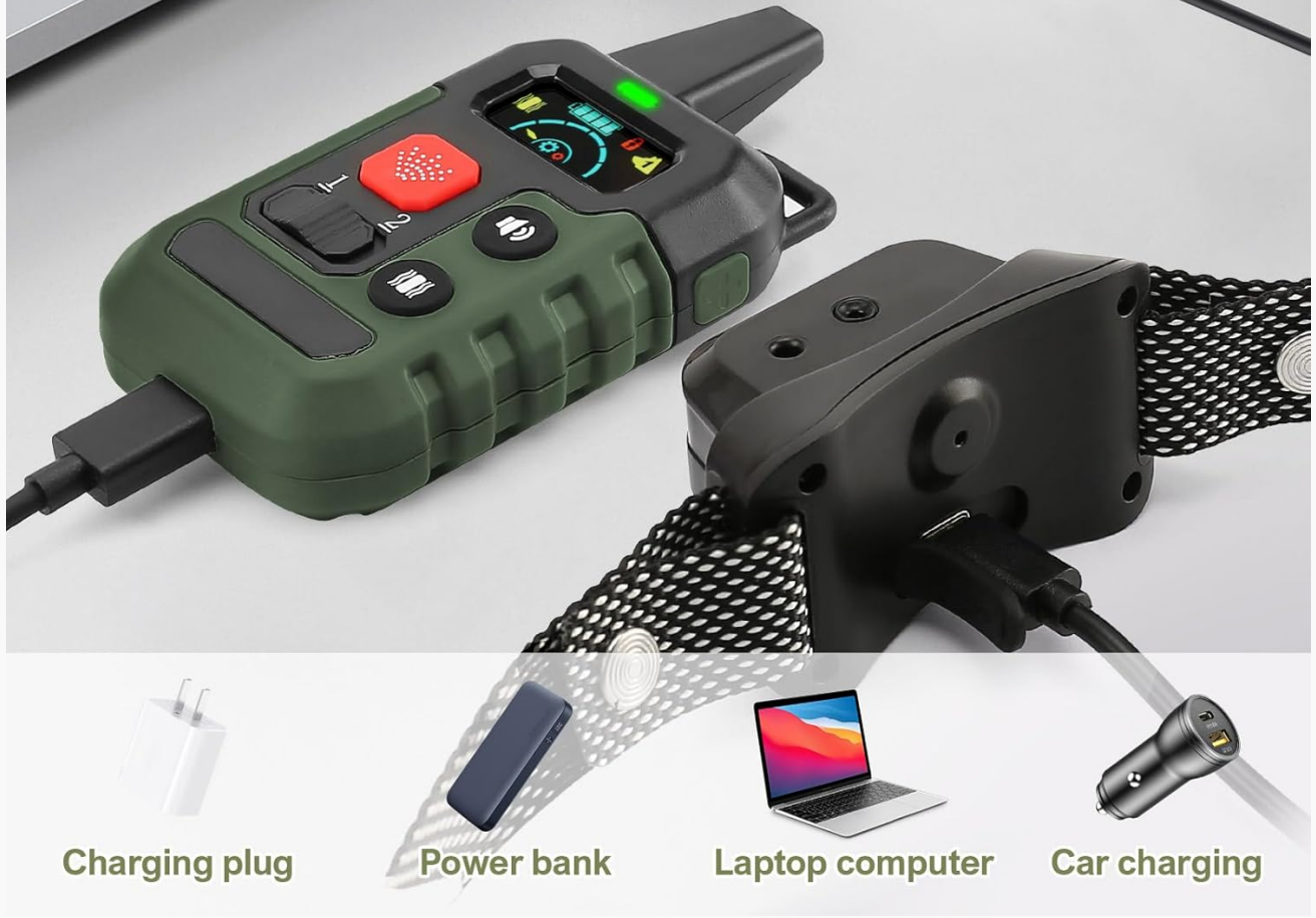
Image: Charging the remote control and collar receiver.

The Citronella remote training collar comes with a built-in battery that can be fully charged in just 1.5-2 hours. Can be used for 10-15 days, compatible with multiple charging ports.