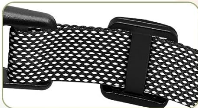
Adjustable Size Buttons