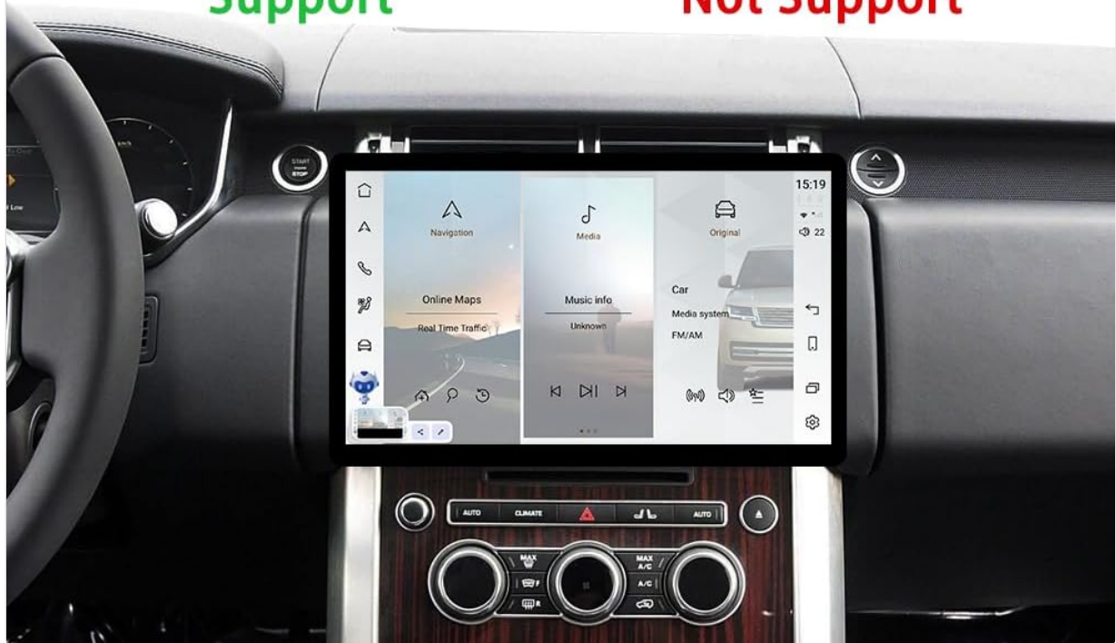
Image illustrating the difference between supported Bosch 8-inch system and unsupported Harman 10-inch system.

Original car 10 inch (for Harman System) Not Support