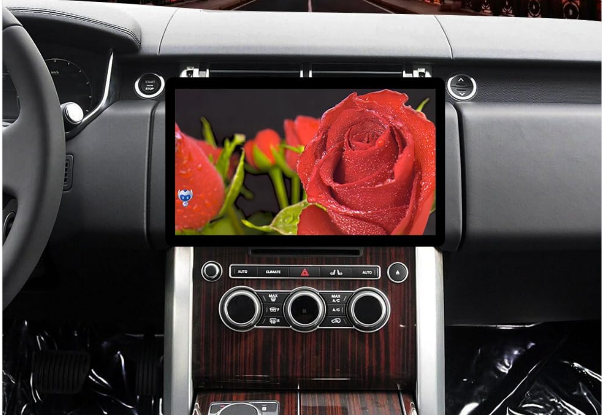
High-resolution LCD display showcasing video playback.

The capacitive touchscreen with HD 1920 x 720 LCD display technology and brightness adjustment, provides you with responsive touch feeling as your home tablet and a clear viewing experience even when the sun is shining or at night. Support 1080P video playback on the stereo monitor.