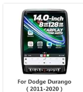
Original steering wheel controls remain functional with the new head unit.

The unit retains full functionality of your original steering wheel controls, allowing you to manage media, calls, and navigation without taking your hands off the wheel.