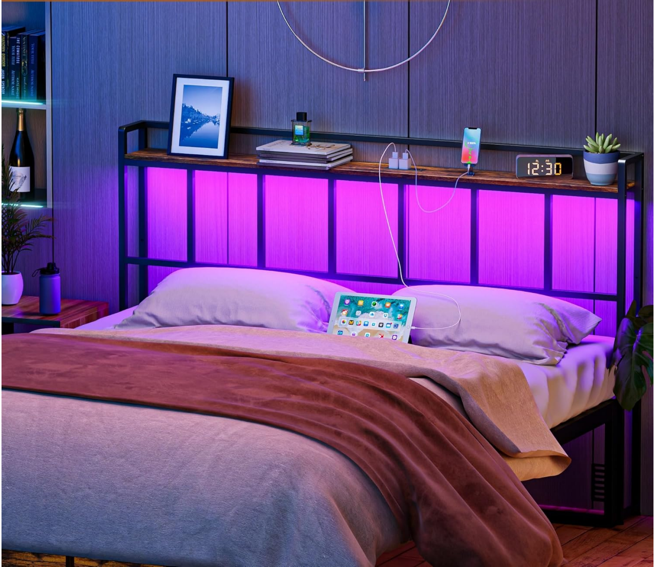
Image: The headboard's storage shelf displaying various items such as a smartphone, an alarm clock, and a small potted plant.