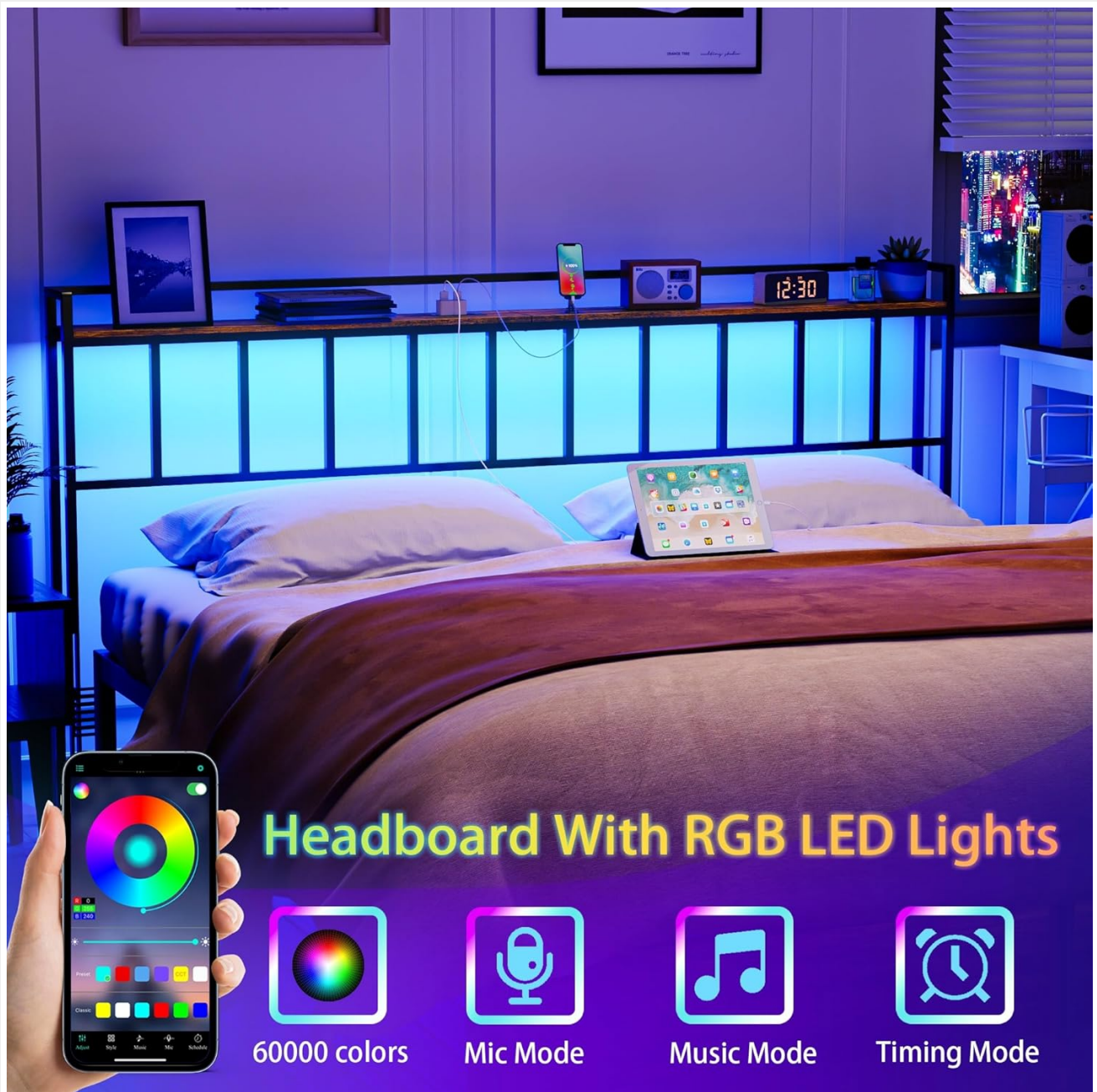
Image: A smartphone interface showing the application used to control the LED lights, featuring a color selection wheel and mode options.