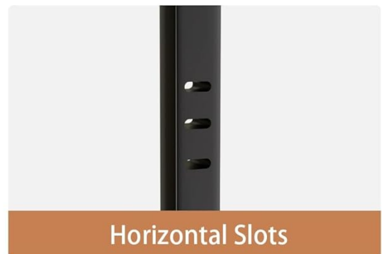
Image: Detail of the bed frame adapters, showing compatibility with round holes, vertical slots, and horizontal slots.