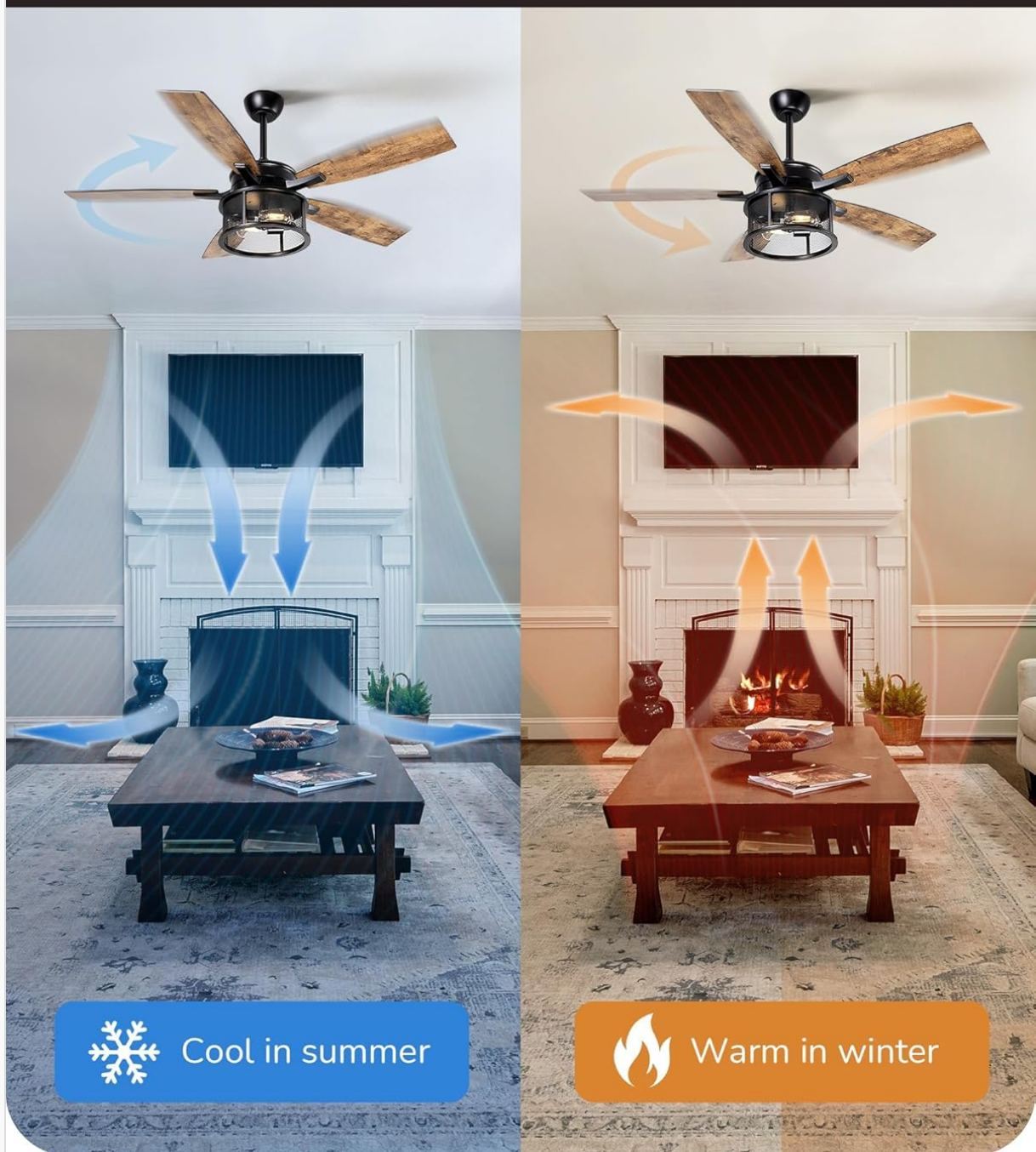
Image: Illustration of the reversible DC motor function, showing downward airflow for cooling in summer and upward airflow for circulating warm air in winter.