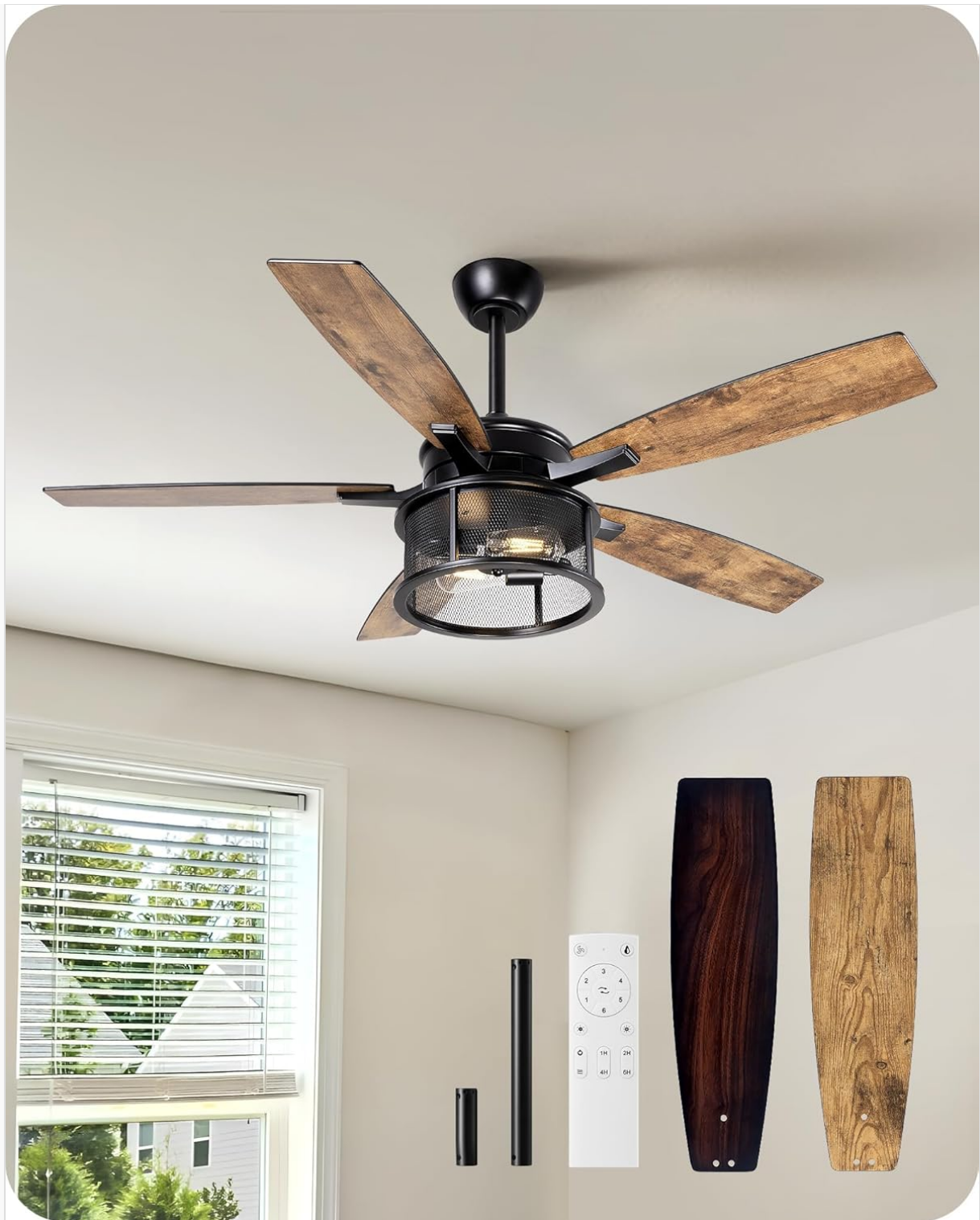
Image: The EDISHINE 52-inch Farmhouse Ceiling Fan, showcasing its light oak wooden blades, black motor housing, and net cage light kit. Also shown are the remote control, downrods, and alternative dark wooden blades.