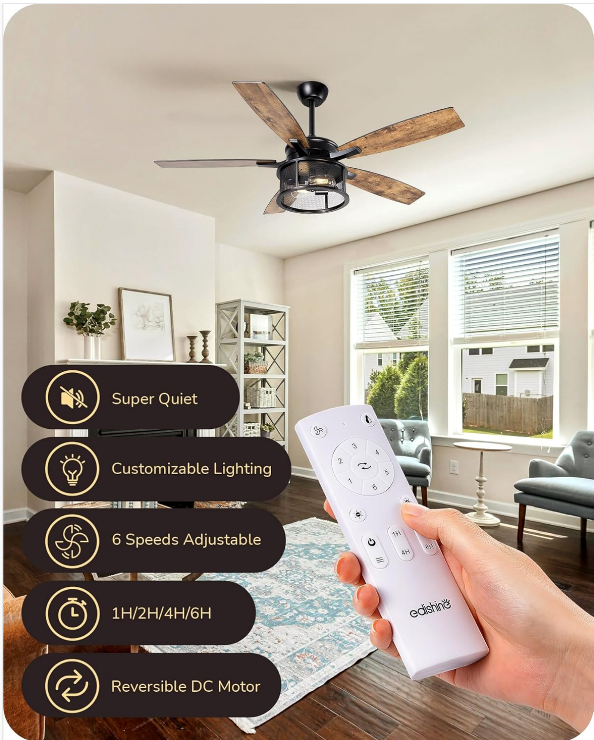
Image: The remote control for the EDISHINE fan, highlighting features such as super quiet operation, customizable lighting, 6 speeds, timer, and reversible DC motor.