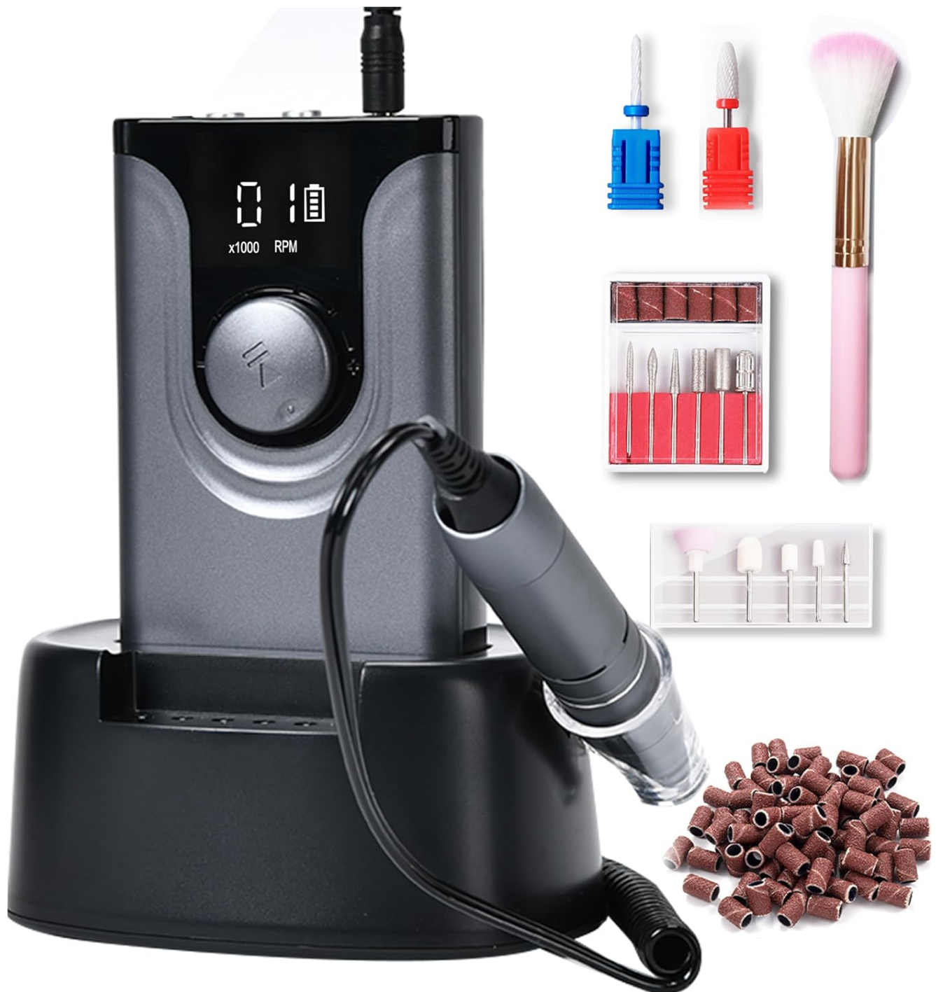
Figure 2.1: Lumcrissy Professional Nail Drill main unit, handpiece, and various accessories.