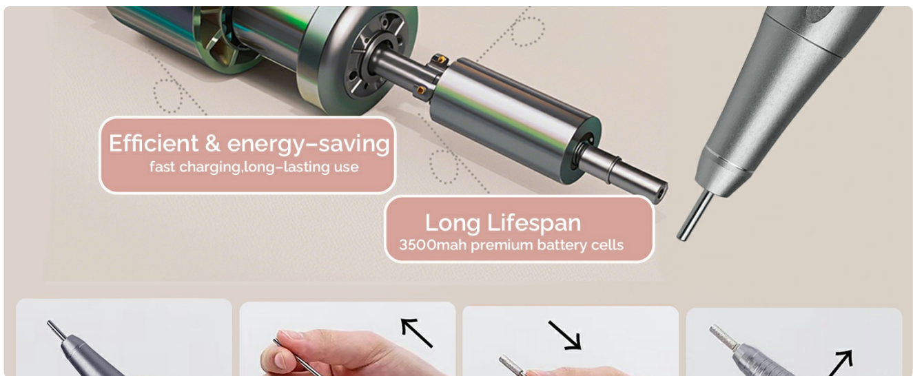
Figure 3.3: Steps for replacing drill bits in the handpiece.