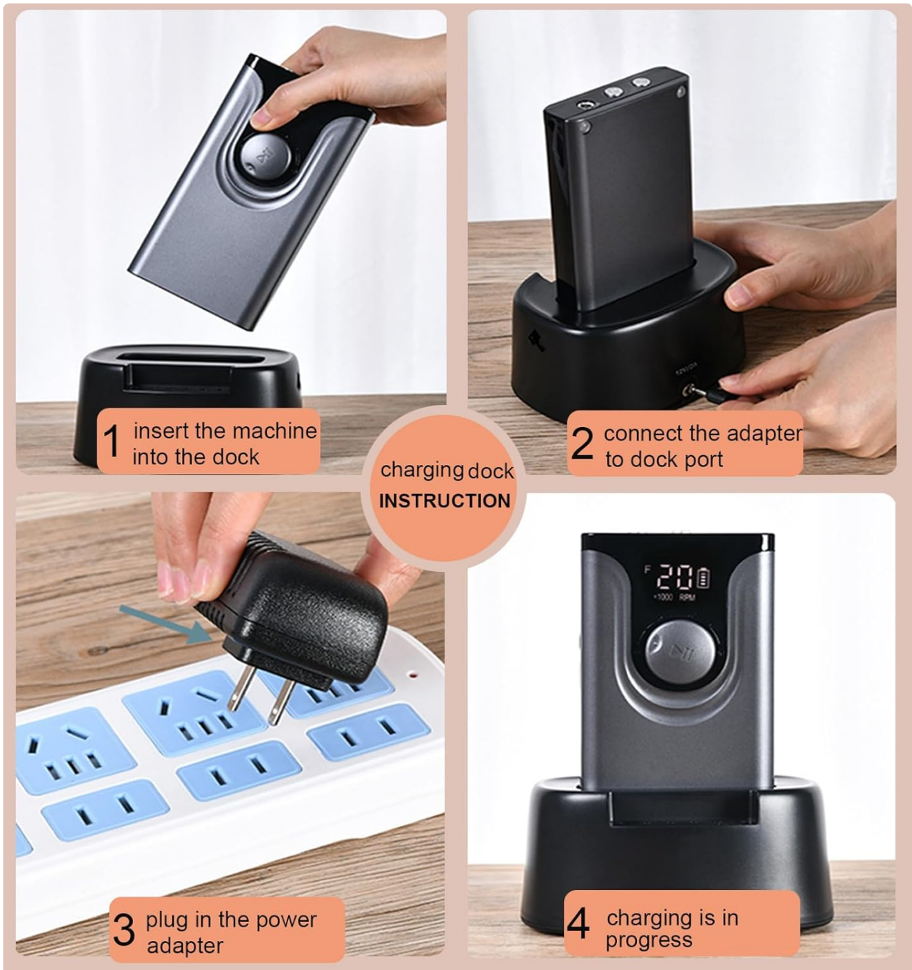
Figure 3.1: Charging dock instructions for the nail drill.