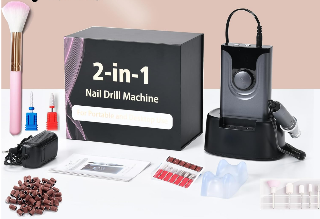
Figure 2.2: Detailed view of the complete Professional Nail Drill Set contents.