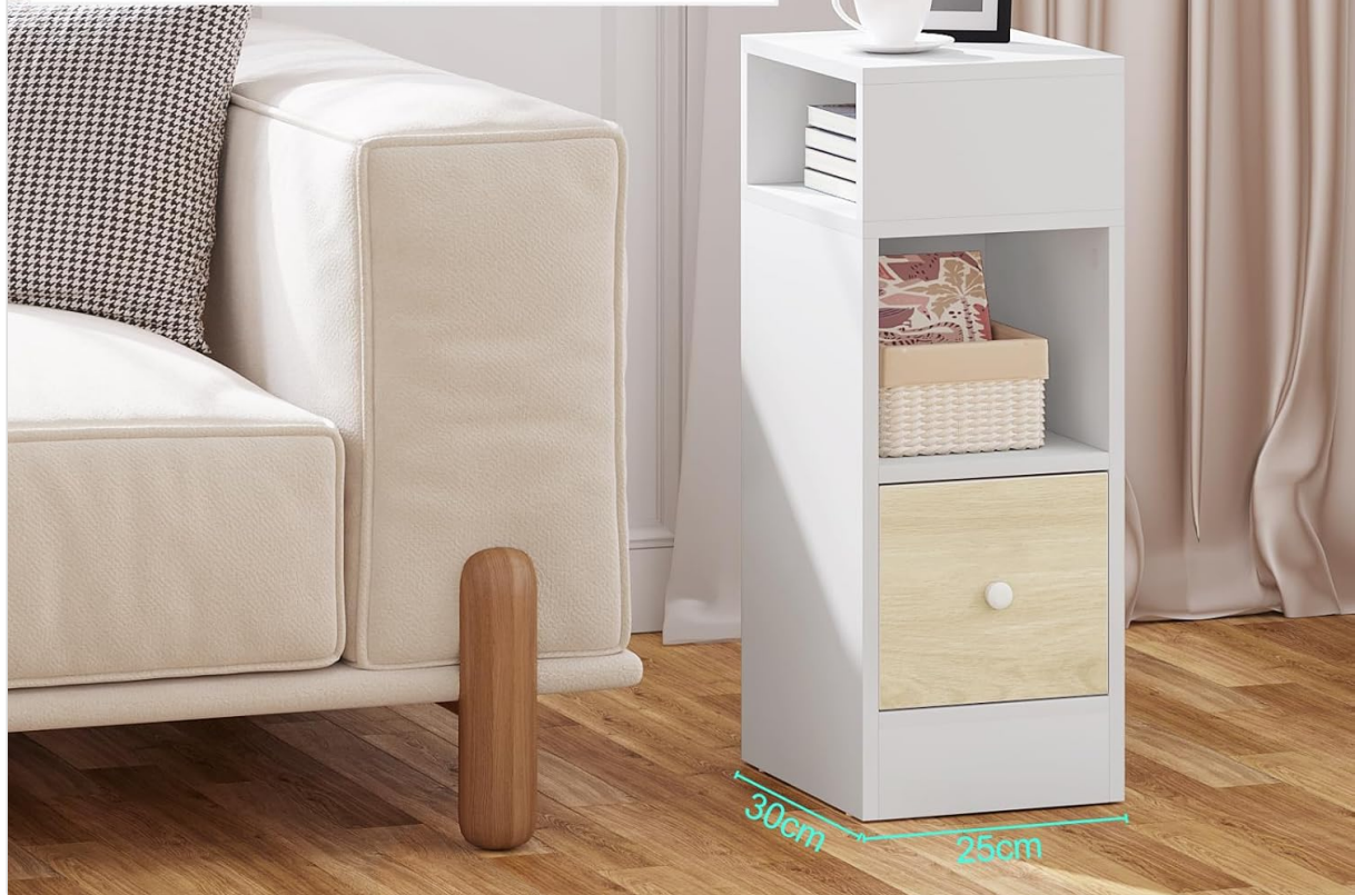
Image: Space-Saving Design. This image shows the bedside table in a living room setting, highlighting its compact 25x30cm footprint and its suitability for small or confined rooms.