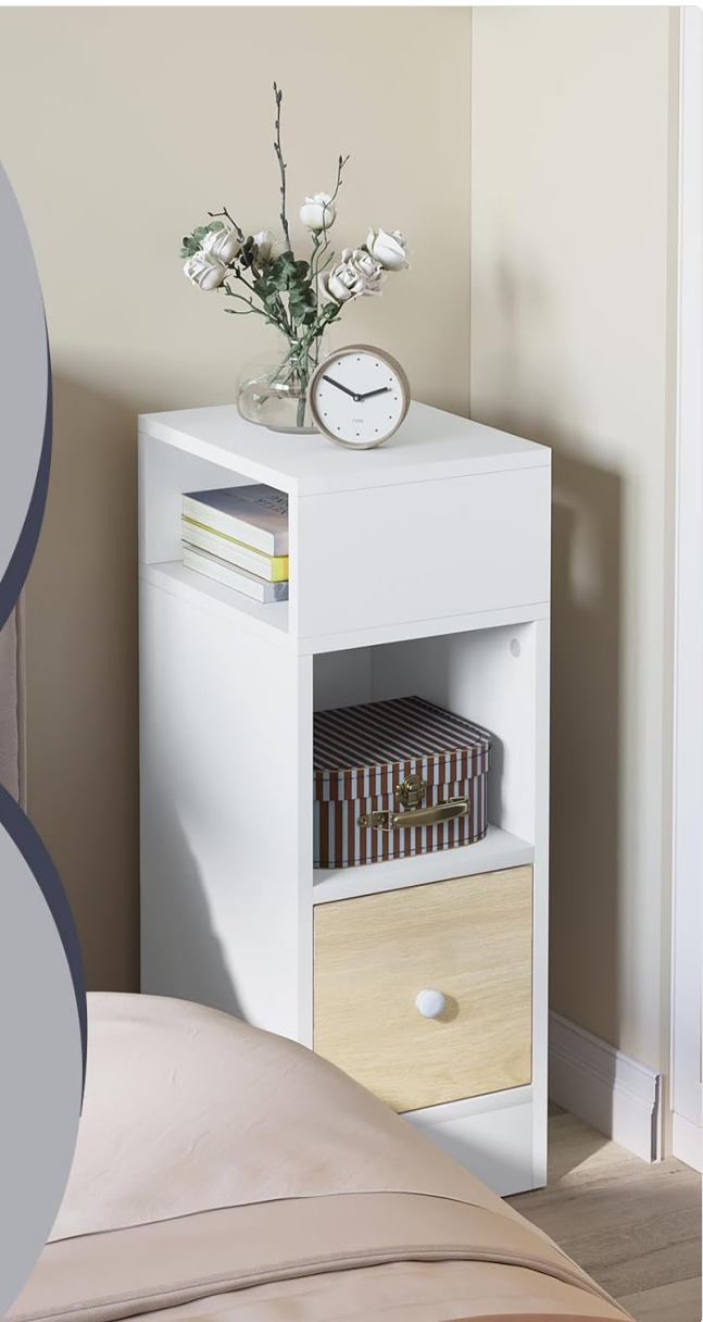
Image: Detail Features. This image showcases the smooth tabletop for easy cleaning, the rounded knob for comfortable drawer access, and the durable metal runners for smooth drawer operation.