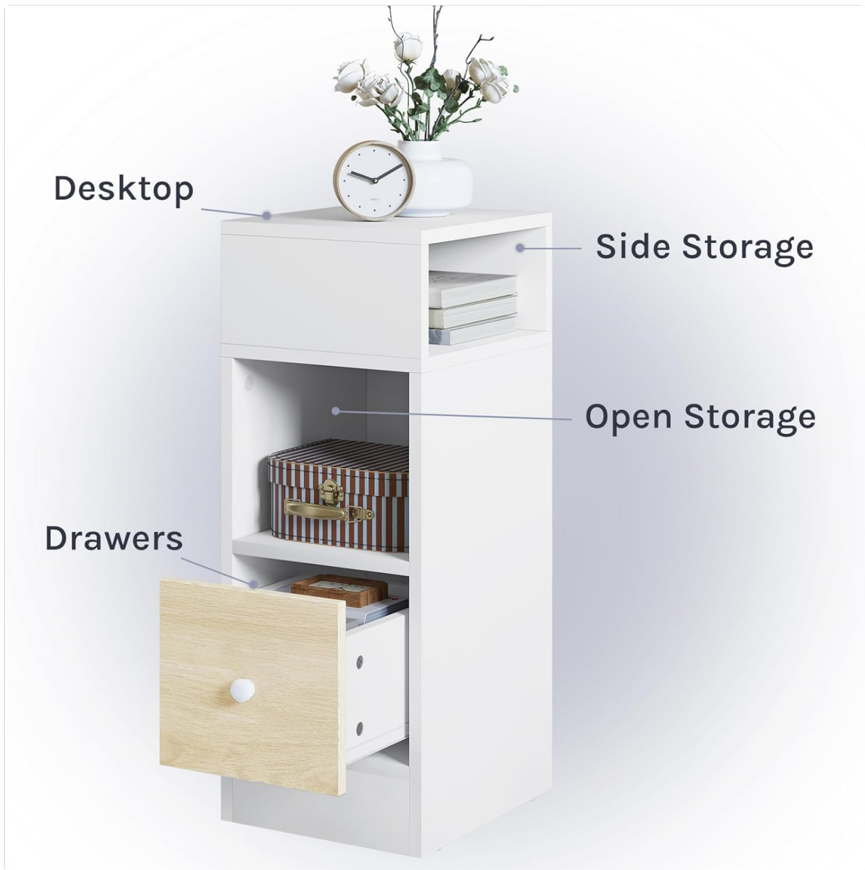
Image: Storage Features. This image labels the different storage areas of the bedside table: the desktop, side storage, open storage, and the drawer, illustrating its multi-functional design.