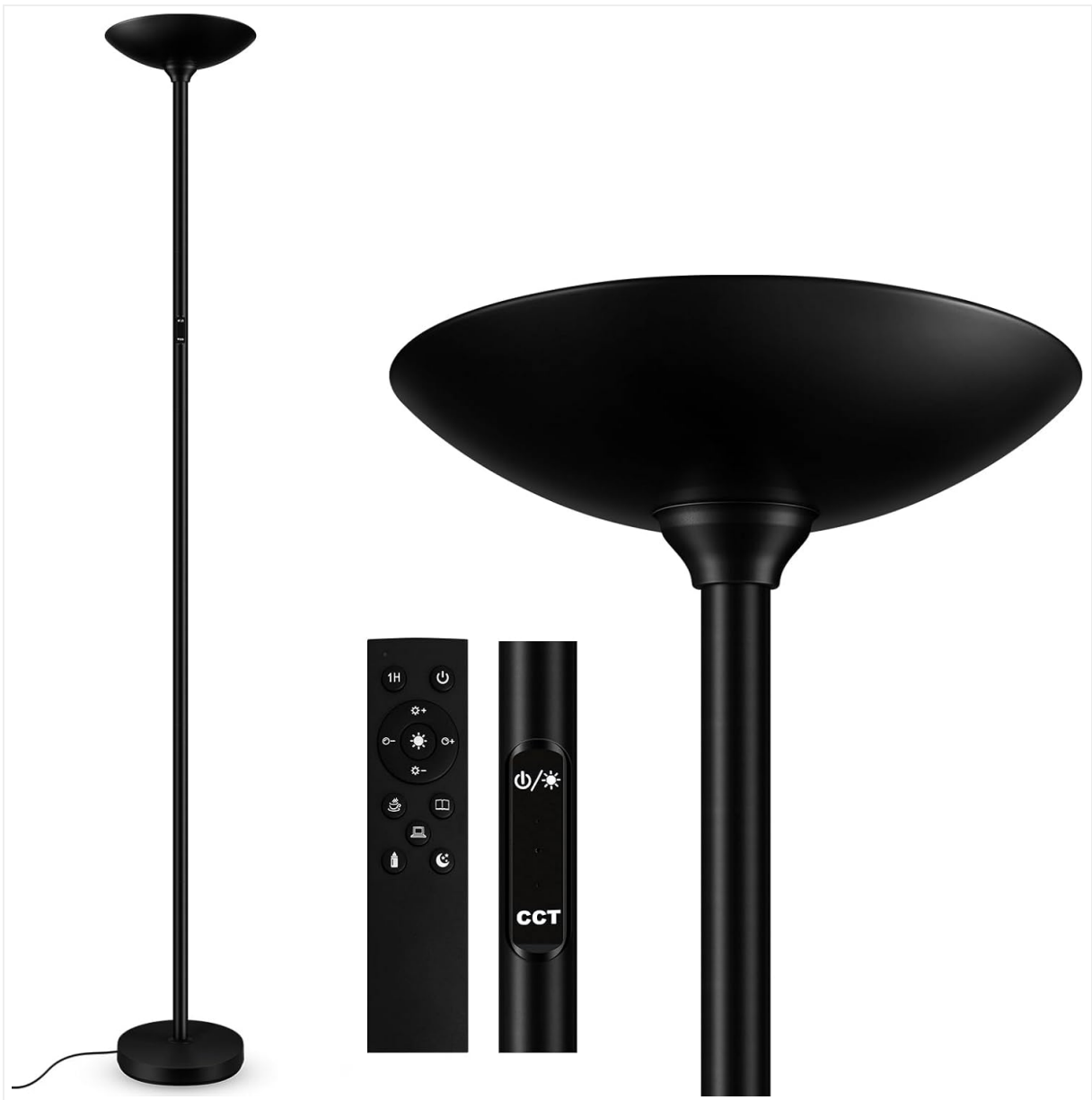
Image: The BoostArea Dimmable Floor Lamp, showing the lamp assembled, along with its remote control and touch control panel on the pole.