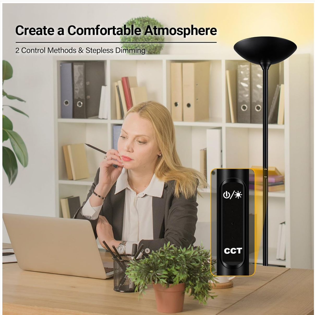
Image: Illustration of the lamp's stepless brightness adjustment, demonstrating light intensity from 5% to 100%.