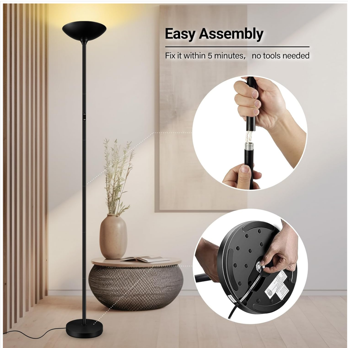
Image: Visual guide demonstrating the simple screw-together assembly process for the lamp pole and base.