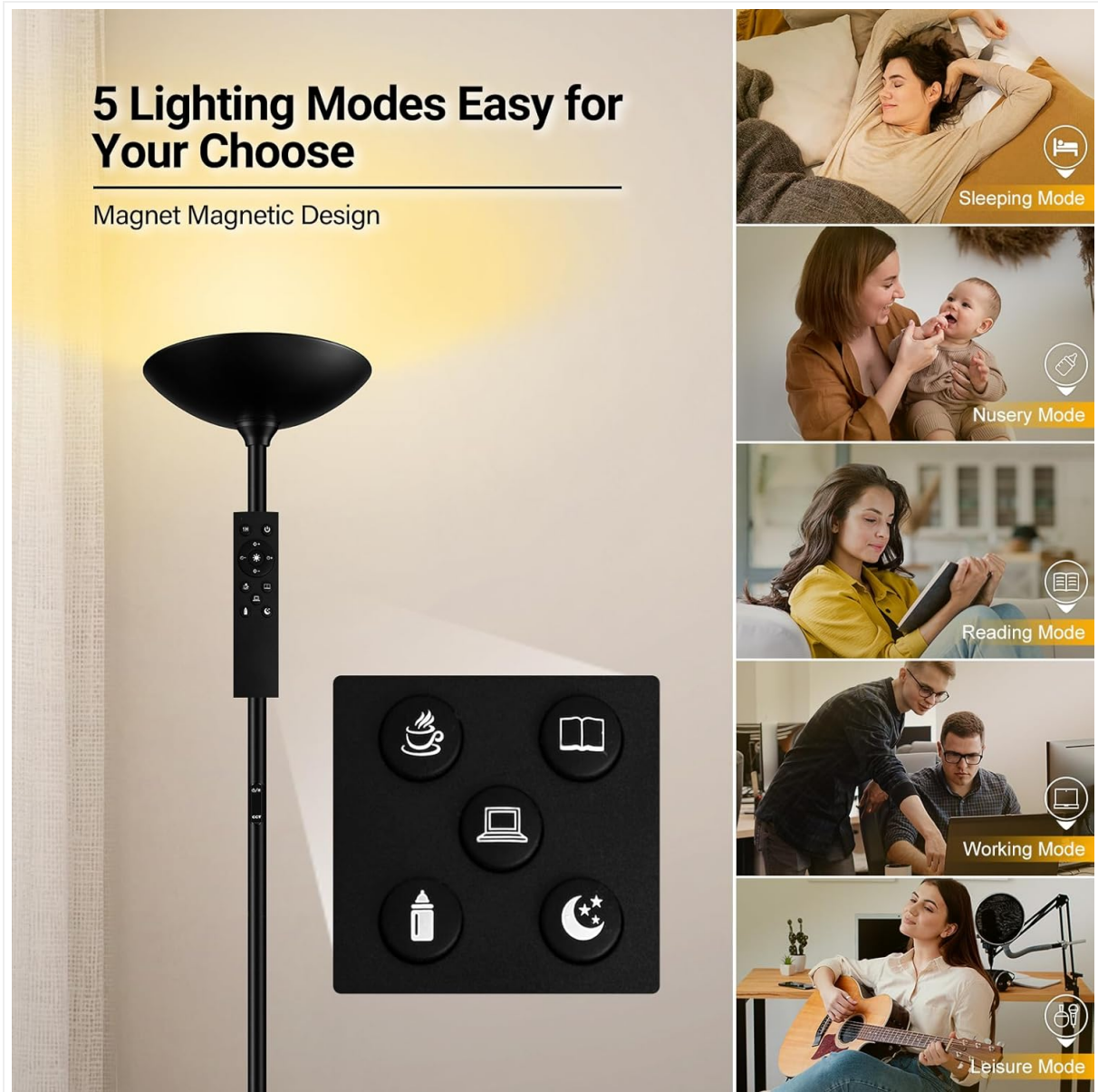
Image: Detailed view of the remote control and the touch-sensitive panel on the lamp's pole, highlighting control options.