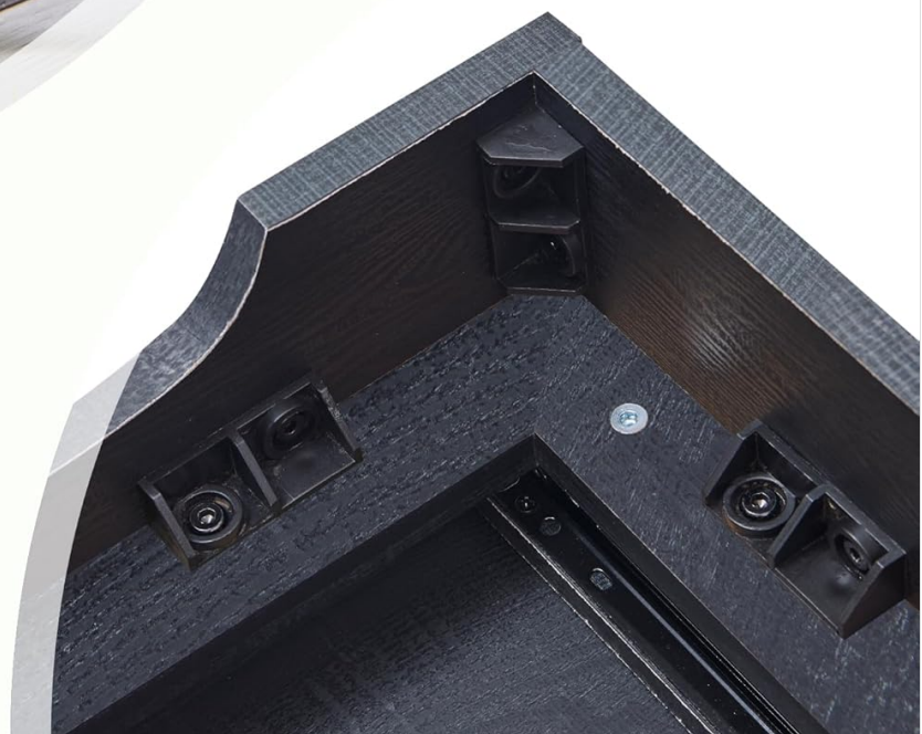
Image: Detailed view of the dresser's base and corner construction, highlighting the hidden reinforced protection and stable wooden pedestal designed for long-term durability.

The wooden pedestal ensures stability and no wobbling