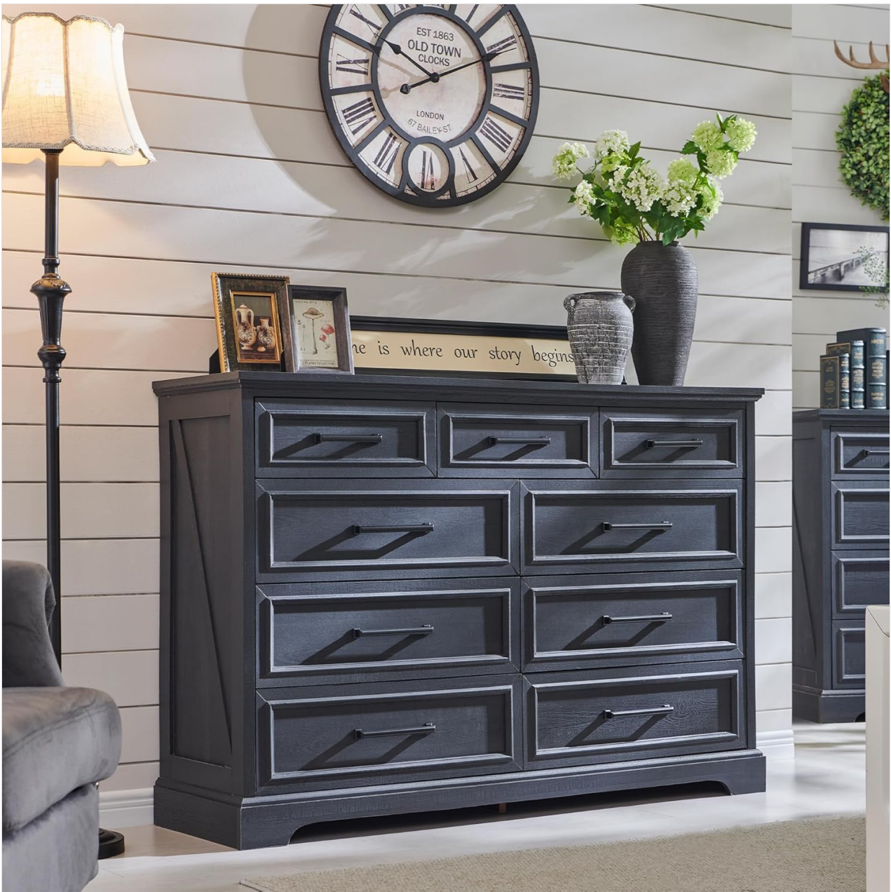
Image: The ACCOHOHO Farmhouse 9-Drawer Dresser, black, positioned in a bedroom setting, showcasing its design and size relative to other furniture.