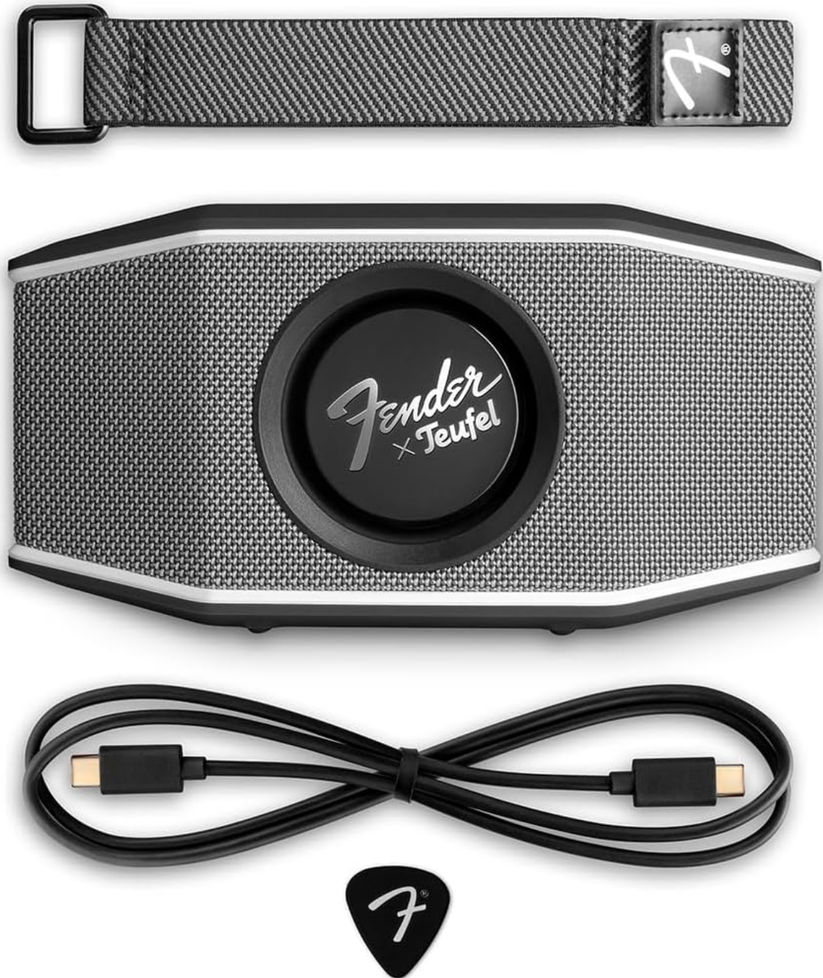
Image: The ROCKSTER GO 2 speaker shown alongside its USB-C charging cable, Fender strap, and Fender guitar pick, illustrating the complete package contents.