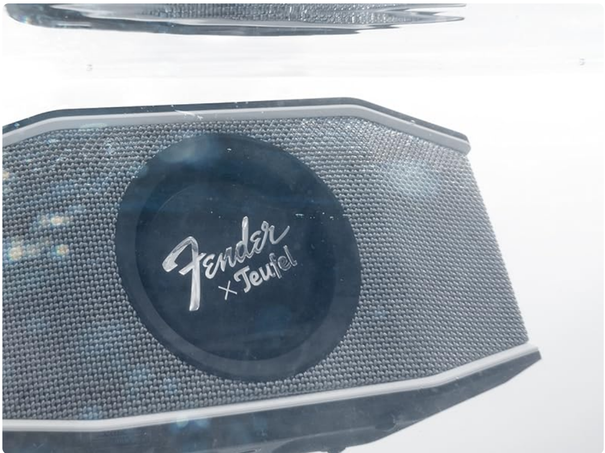
Image: The ROCKSTER GO 2 speaker demonstrating its waterproof capability by being partially submerged in water, with water droplets visible on its surface.