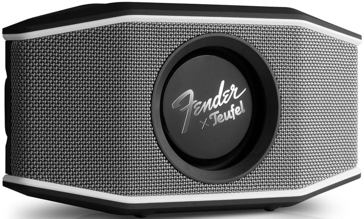
Image: The front of the speaker, showcasing the central passive bass radiator with the 'Fender x Teufel' logo and the surrounding speaker grille.