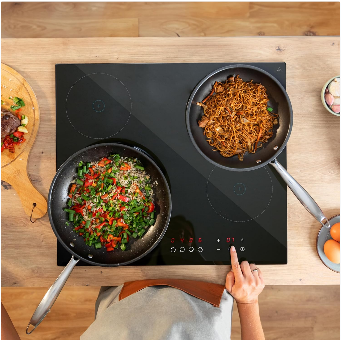
Figure 4: Adjusting power levels using the touch control panel.