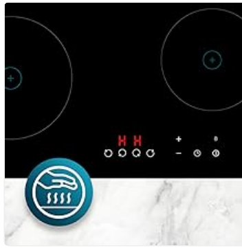
Figure 6: Residual heat indicator ('H').