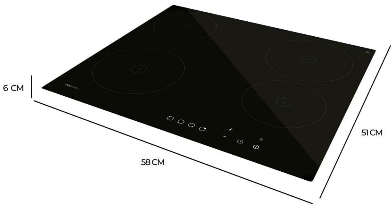
Figure 3: Product dimensions for installation.