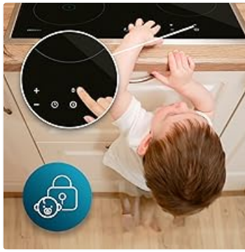
Figure 1: The child safety lock feature helps prevent accidental operation by children.