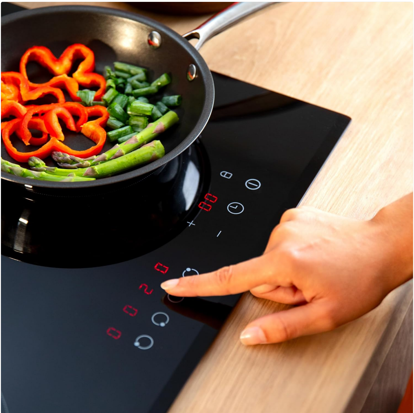
Figure 5: Setting the cooking timer.