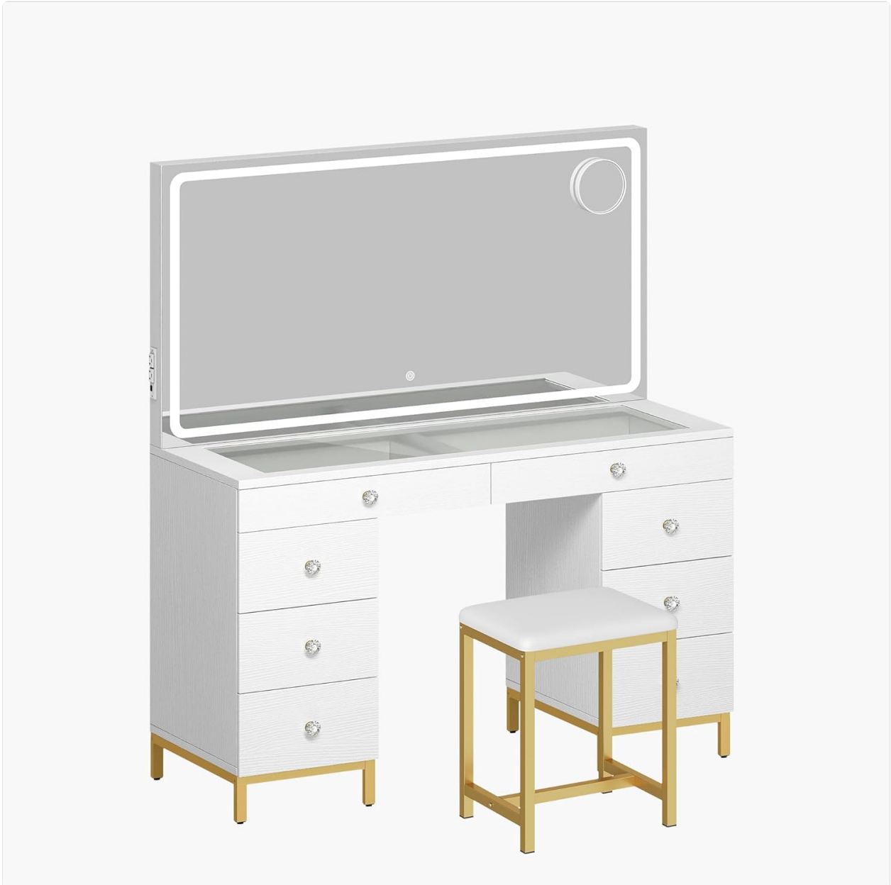
Figure 2.1: The YITAHOME Vanity Desk Set, showcasing the large LED mirror, desk with drawers, and accompanying stool.