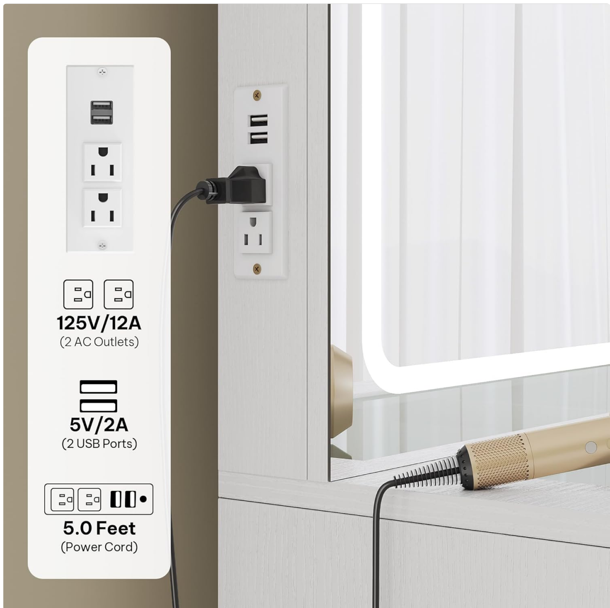
Figure 4.1: Detail of the integrated power outlet, showing two AC outlets and two USB ports for convenient charging and power access.