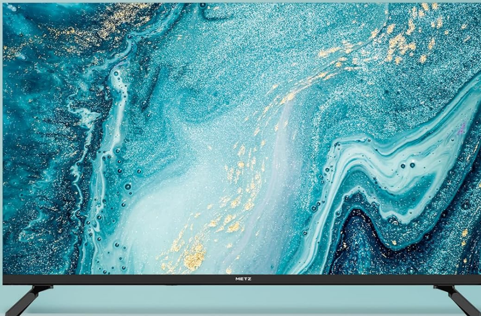
Figure 5: The Metz MTE2000Z TV provides an enjoyable viewing experience for the whole family, suitable for various room sizes.