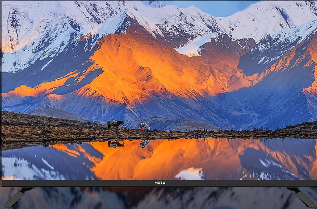
Figure 3: The TV's image processing unit optimizes color precision, ensuring pure and realistic colors for a superior viewing experience. The borderless design maximizes the screen area, providing a more immersive viewing experience without distractions.

Con un rapporto schermo-cornice del 96,6%, la tecnologia a schermo intero offre un'esperienza visiva più coinvolgente.