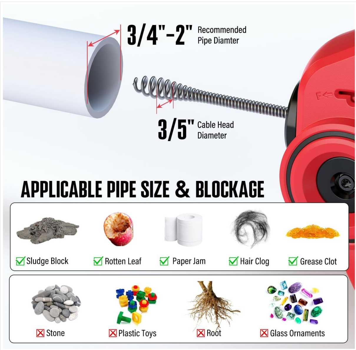
Figure 4: This image details the recommended pipe diameter for the drain snake (3/4" to 2") and lists common blockages it can clear (sludge, rotten leaves, paper, hair, grease) versus those it cannot (stone, plastic toys, roots, glass ornaments).