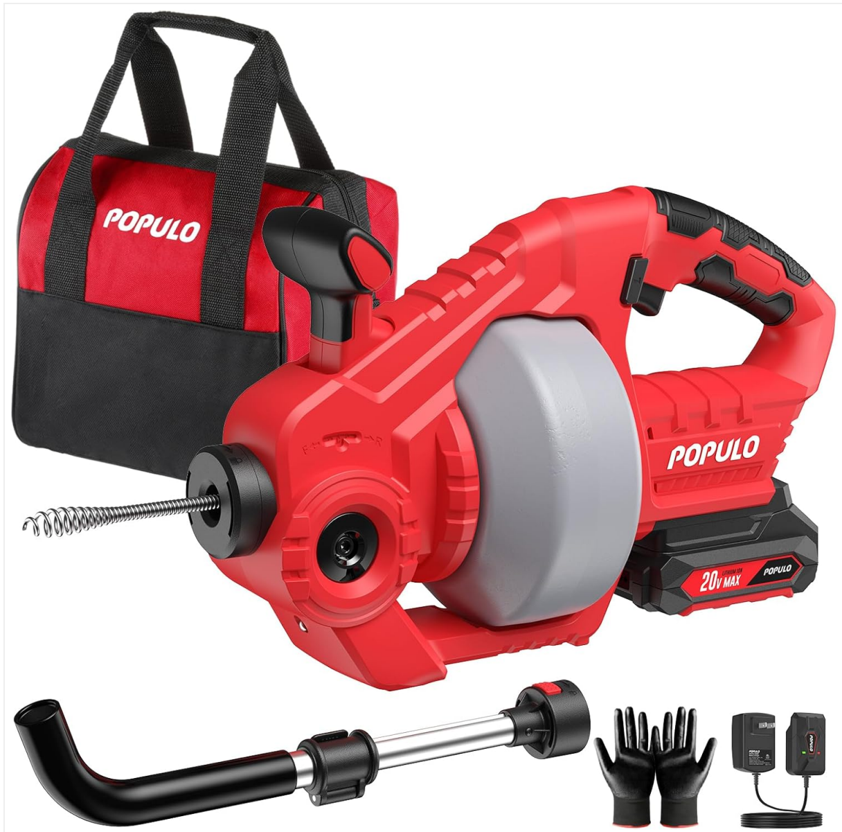
Figure 1: The POPULO 20V Cordless Electric Drain Snake shown with its 2.0Ah battery, charger, 25ft cable, extension tube, protective gloves, and cloth bag.