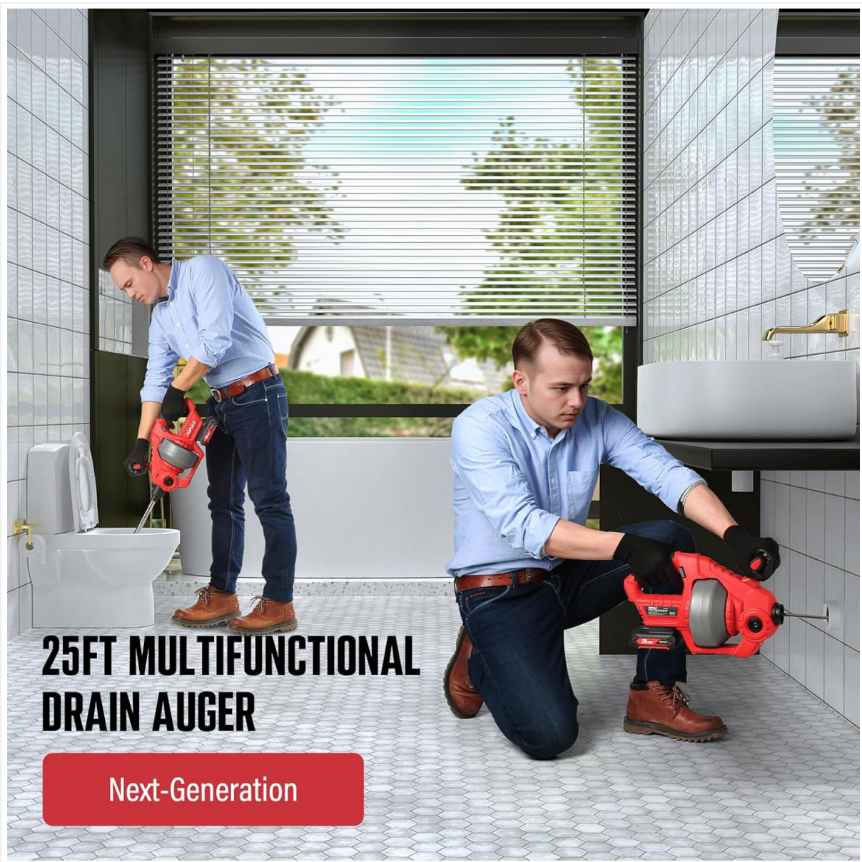
Figure 6: Demonstrations of the 25ft multifunctional drain auger in use for both toilet and floor drain applications.