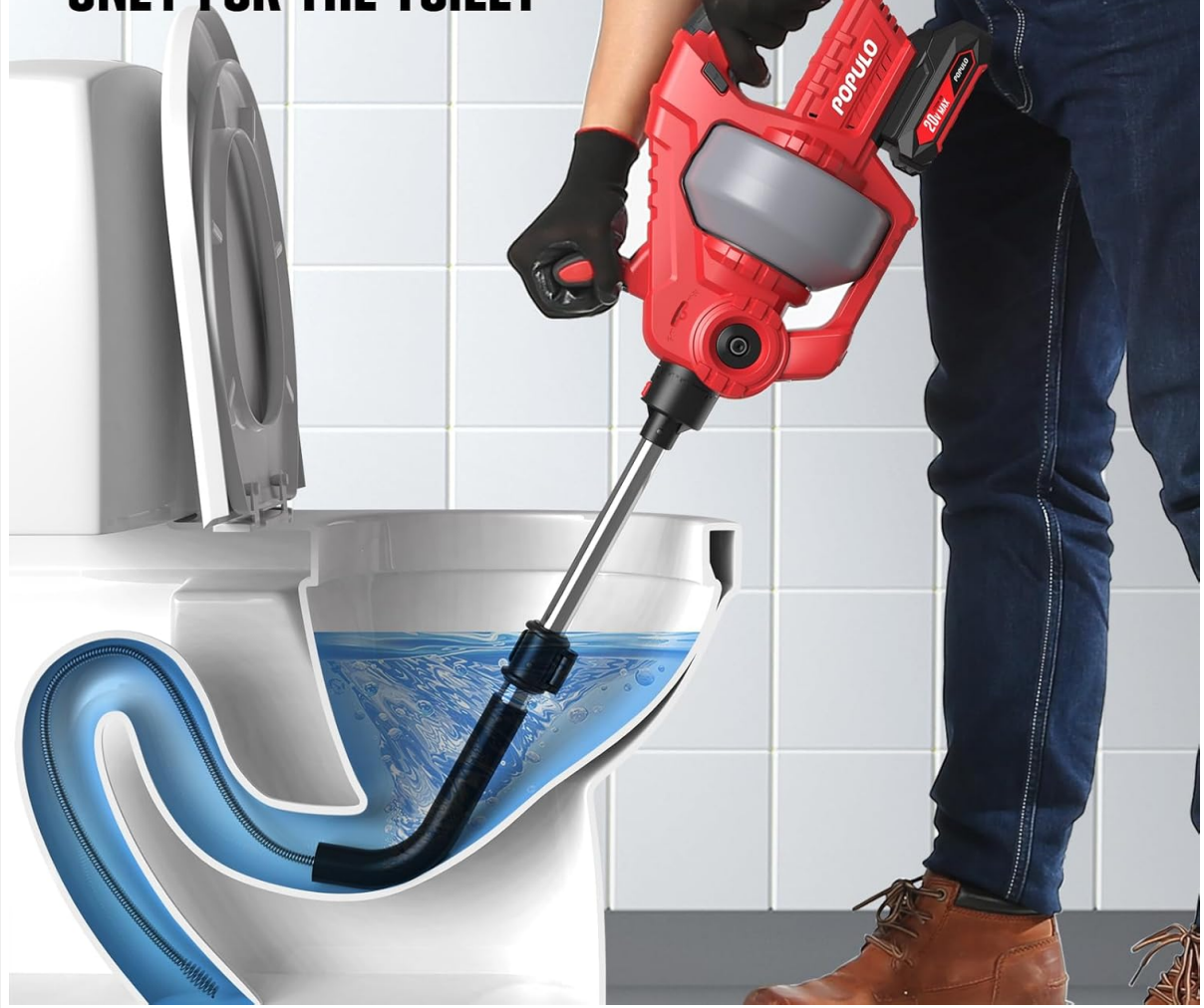
Figure 5: The extension tube is specifically designed for use with toilets to prevent damage to the porcelain bowl while clearing clogs.