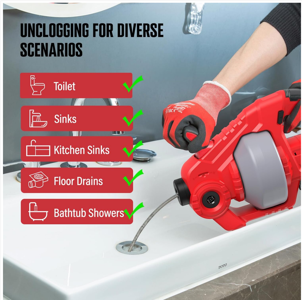
Figure 3: The POPULO drain snake is effective for unclogging toilets, sinks, kitchen sinks, floor drains, and bathtub showers.

The drain snake is suitable for clearing clogs in pipes ranging from 3/4" to 2" in diameter. It effectively addresses common blockages such as sludge, rotten leaves, paper jams, hair clogs, and grease clots.