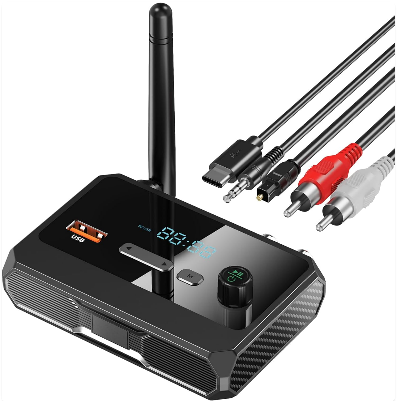
Image: SUYEE C36 Bluetooth 5.3 Receiver with its various connection cables.