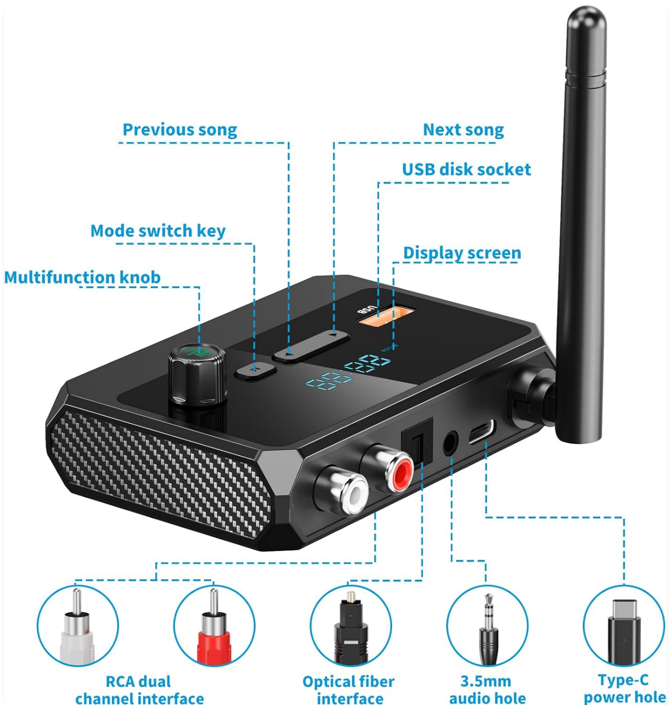
Image: An annotated diagram highlighting the various buttons, ports, and features of the C36 receiver.