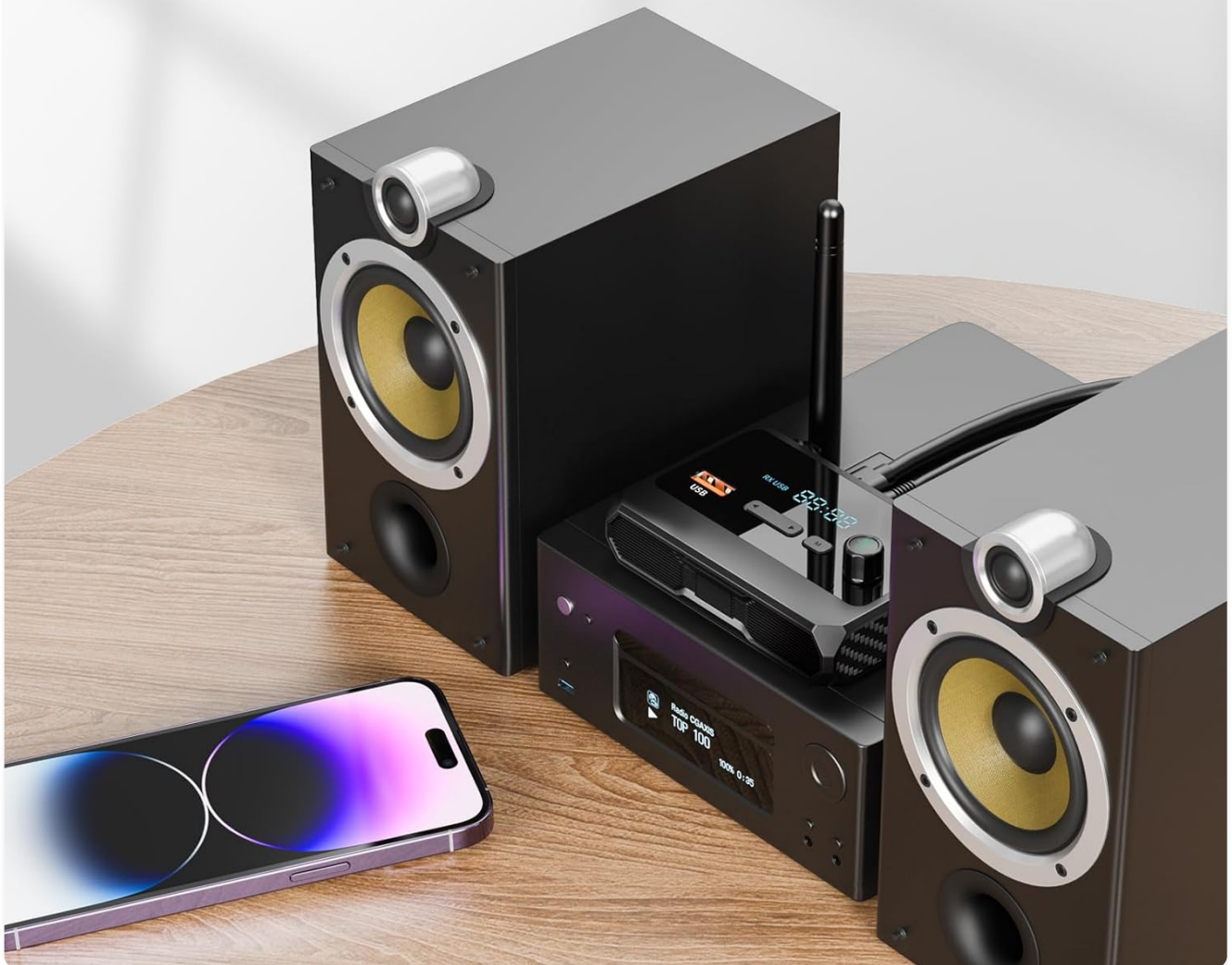
Image: A smartphone displaying the Bluetooth settings, showing the C36 device as connected.