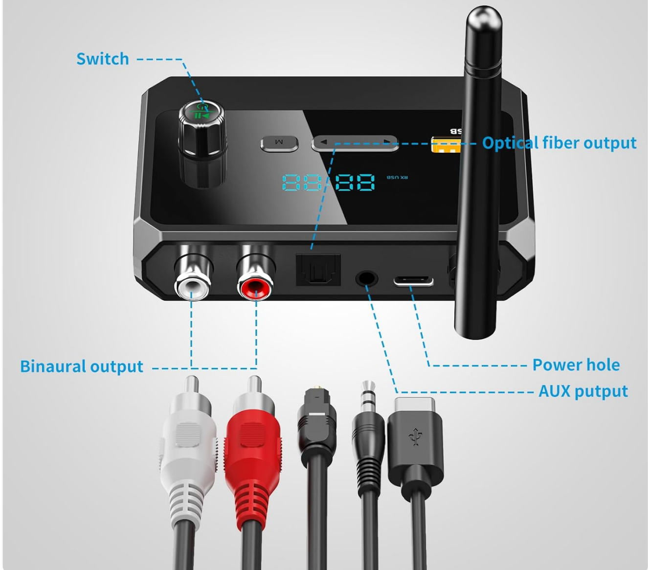
Image: Close-up of the receiver's flexible connectivity options, highlighting each port.