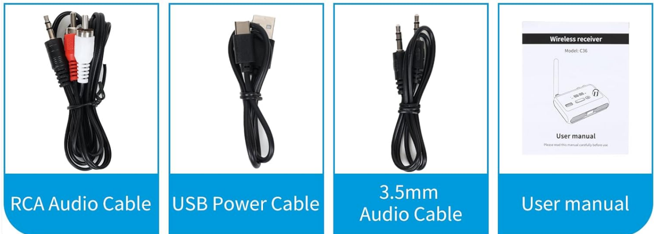
Image: All items included in the SUYEE C36 product package.