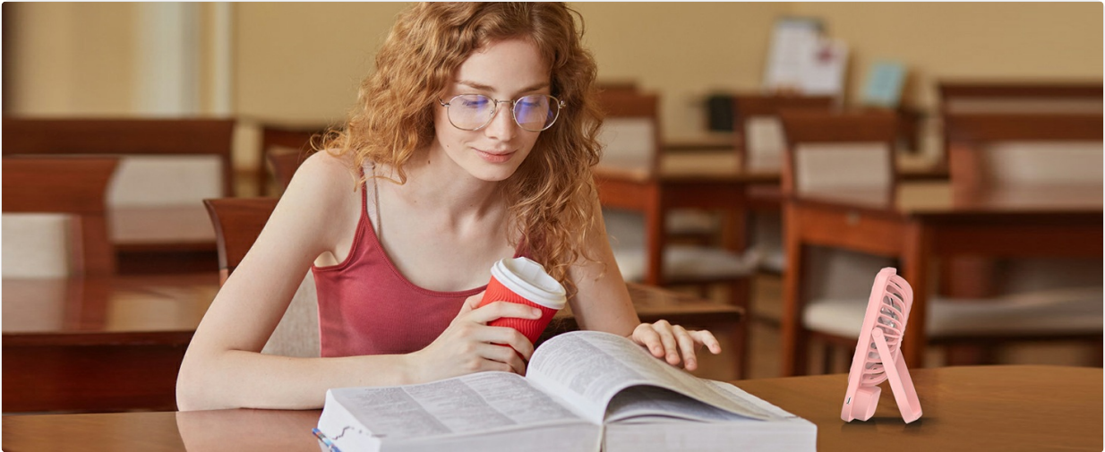
Image: The fan in a quiet setting, illustrating its low-noise operation, which also benefits from regular cleaning.