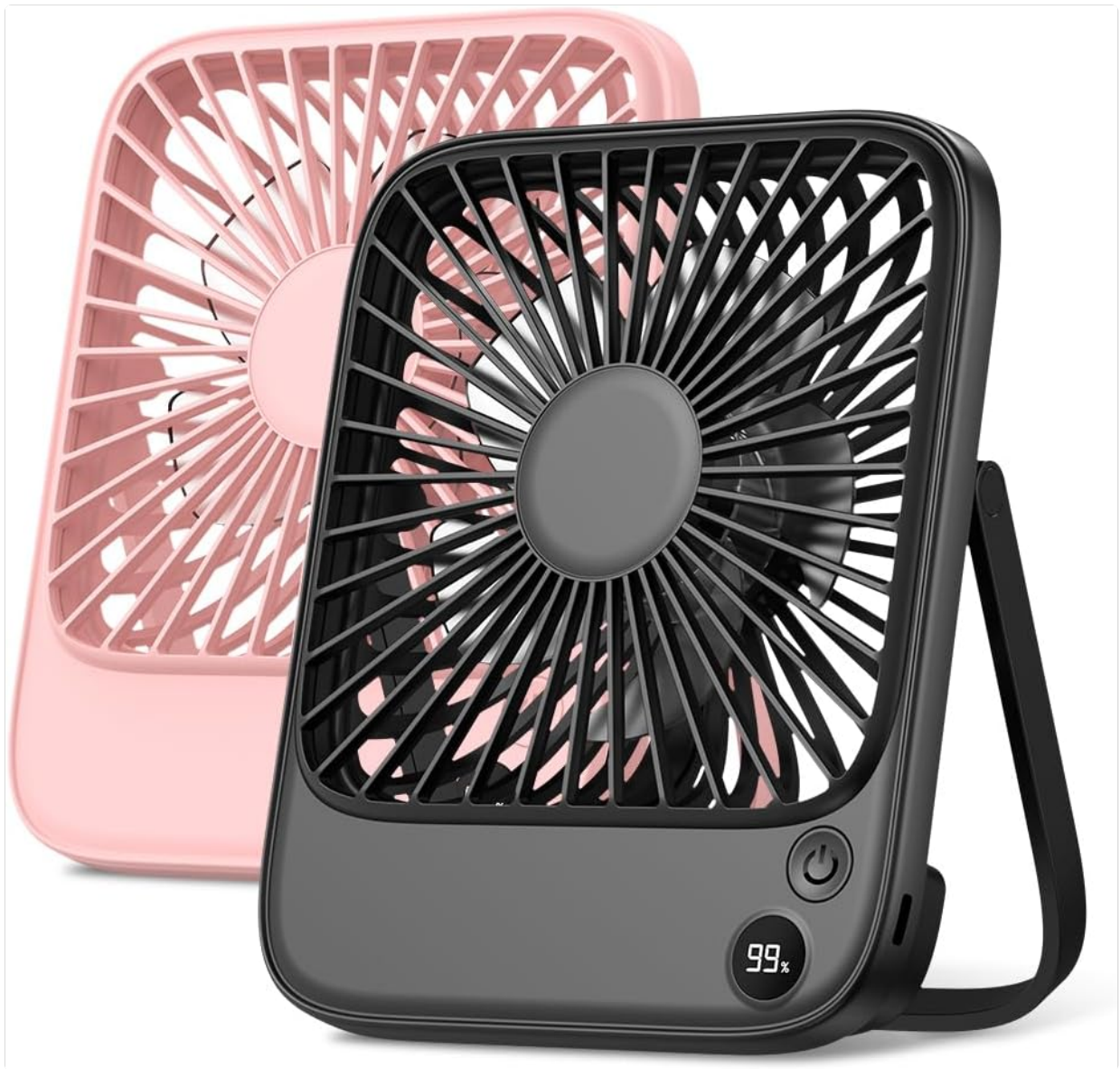
Image: The TOPK 5000mAh Portable Desk Fan, available in black and pink, showcasing its compact design.