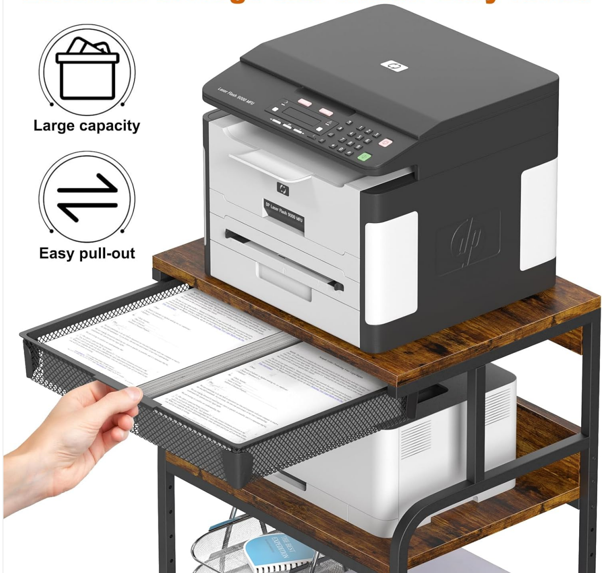
Image: A hand demonstrating the easy pull-out functionality of the mesh drawer basket, which offers efficient storage for office essentials.