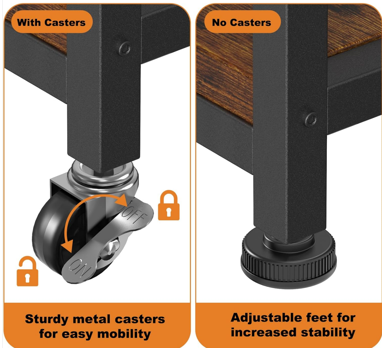
Image: A visual comparison of the two installation methods: with sturdy metal casters for mobility and with adjustable feet for increased stability, demonstrating how each option is attached to the stand's legs.