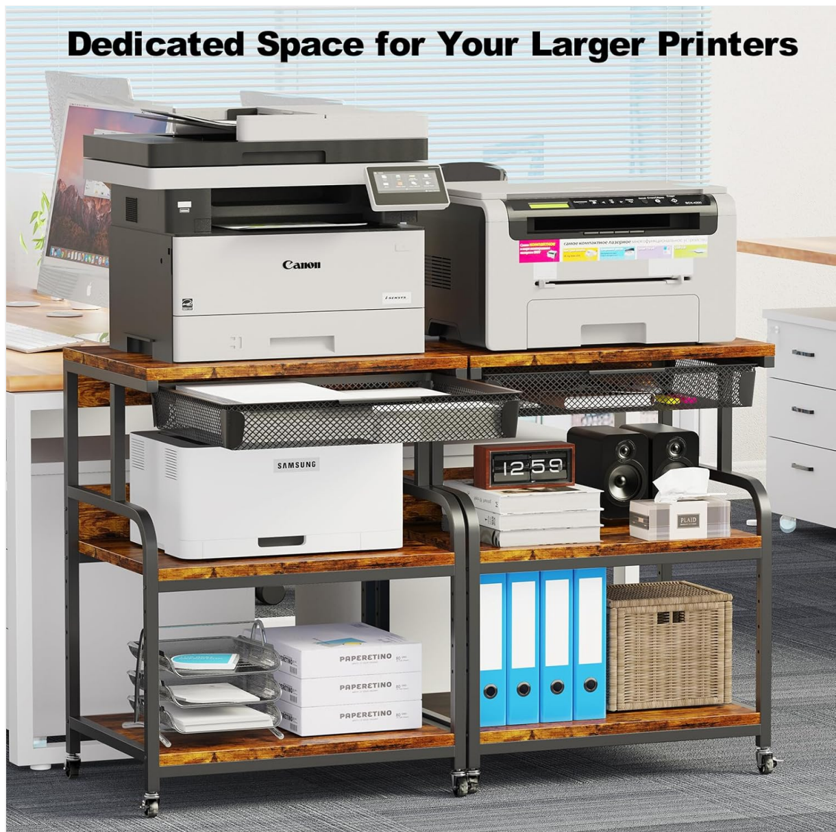
Image: The assembled EasyCom printer stand, demonstrating its capacity for two printers and various office supplies. This image provides an overview of the product's intended use and storage capabilities.