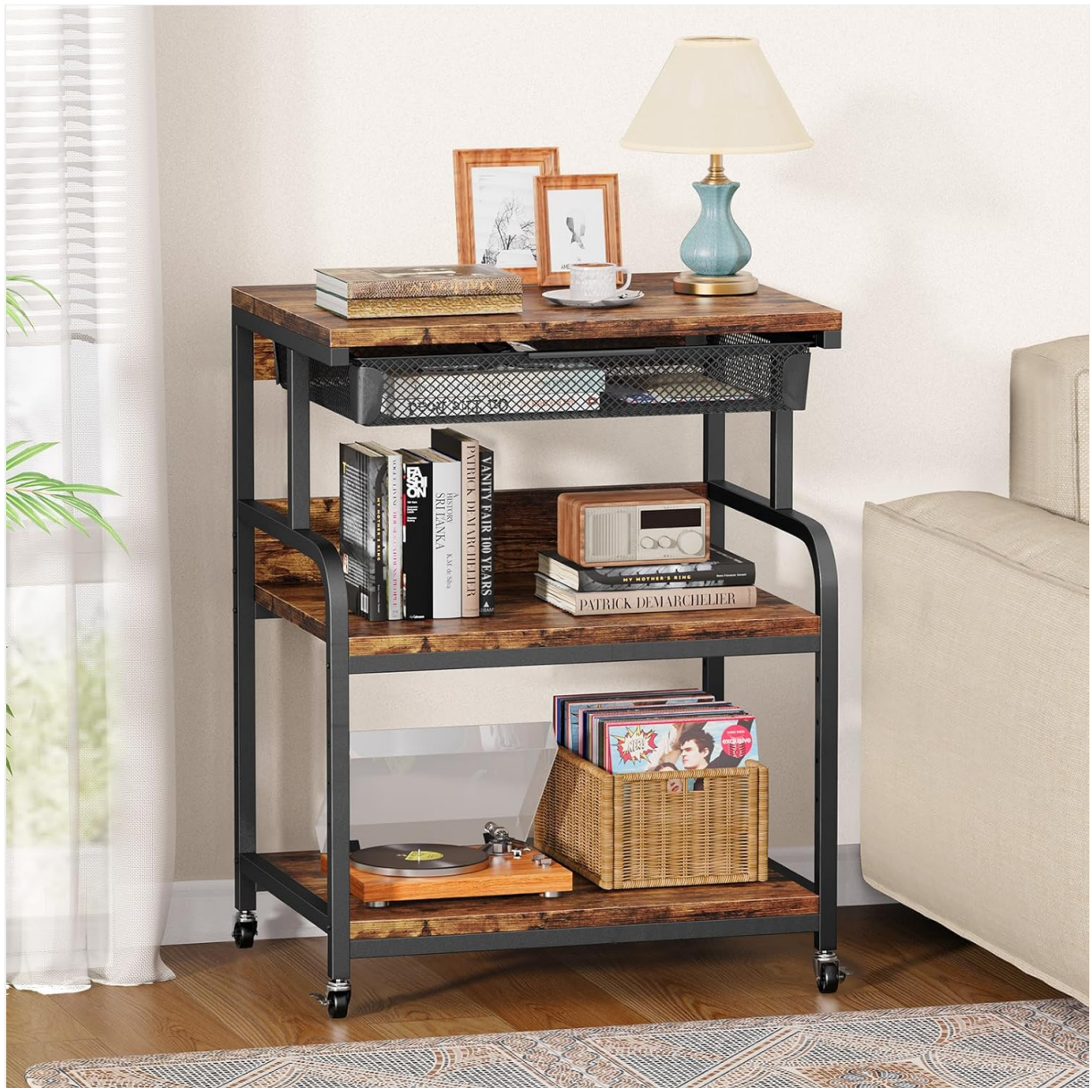
Image: The printer stand repurposed as a stylish side table in a living room, holding books, a record player, and decorative items, showcasing its versatile functionality.