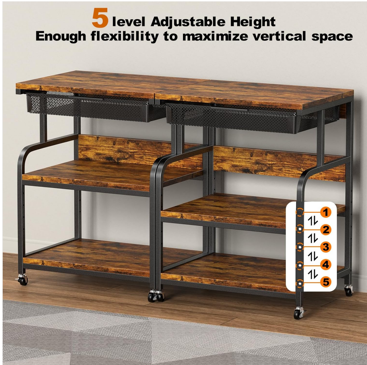
Image: A side view of the printer stand highlighting the five distinct adjustable height levels for the middle shelf, offering flexibility for various storage requirements.