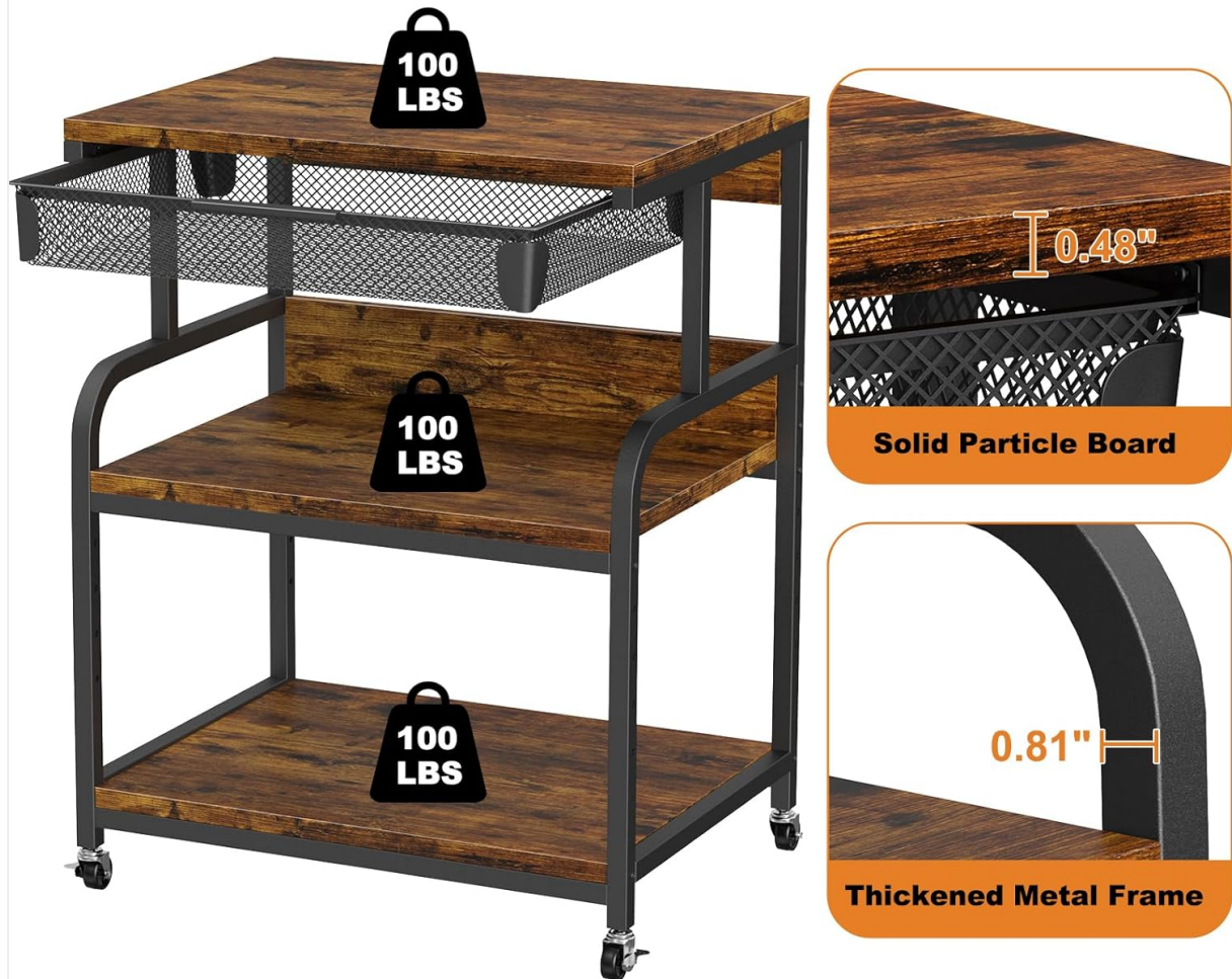
Image: This image highlights the stability and durability of the stand, showing the 100 lbs weight capacity per shelf, the solid particle board material, and the thickened metal frame.

Thanks to reinforced wood panels and steel tubes, the printer stand can withstand heavy weights and be used for a long time.