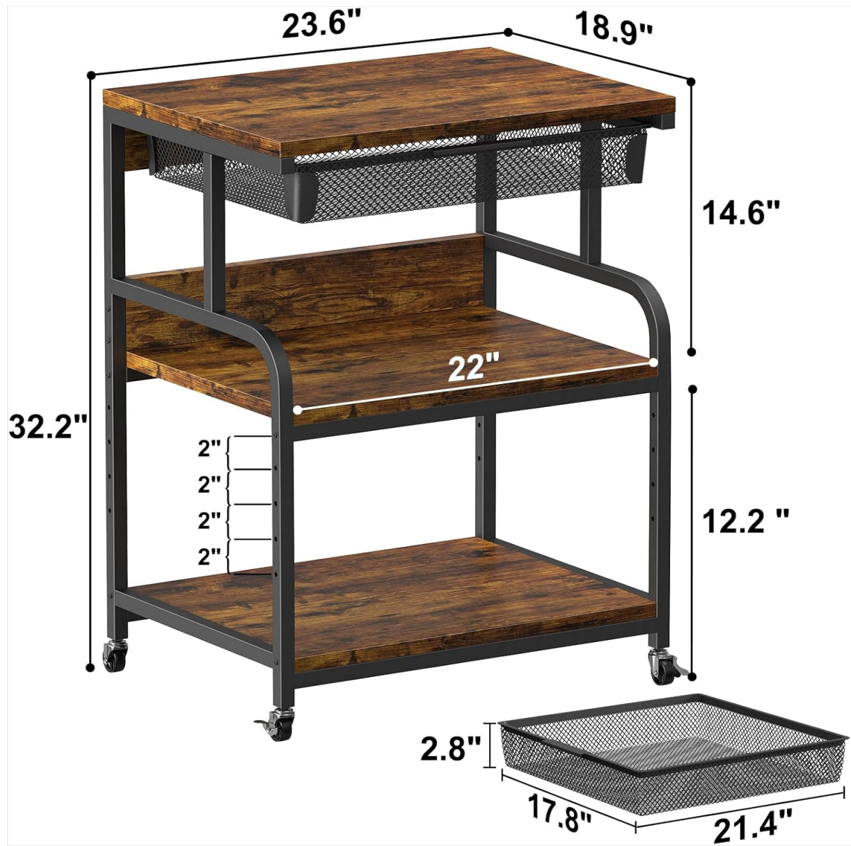
Image: A detailed diagram illustrating the overall dimensions of the printer stand, including width, depth, height, and internal shelf measurements.