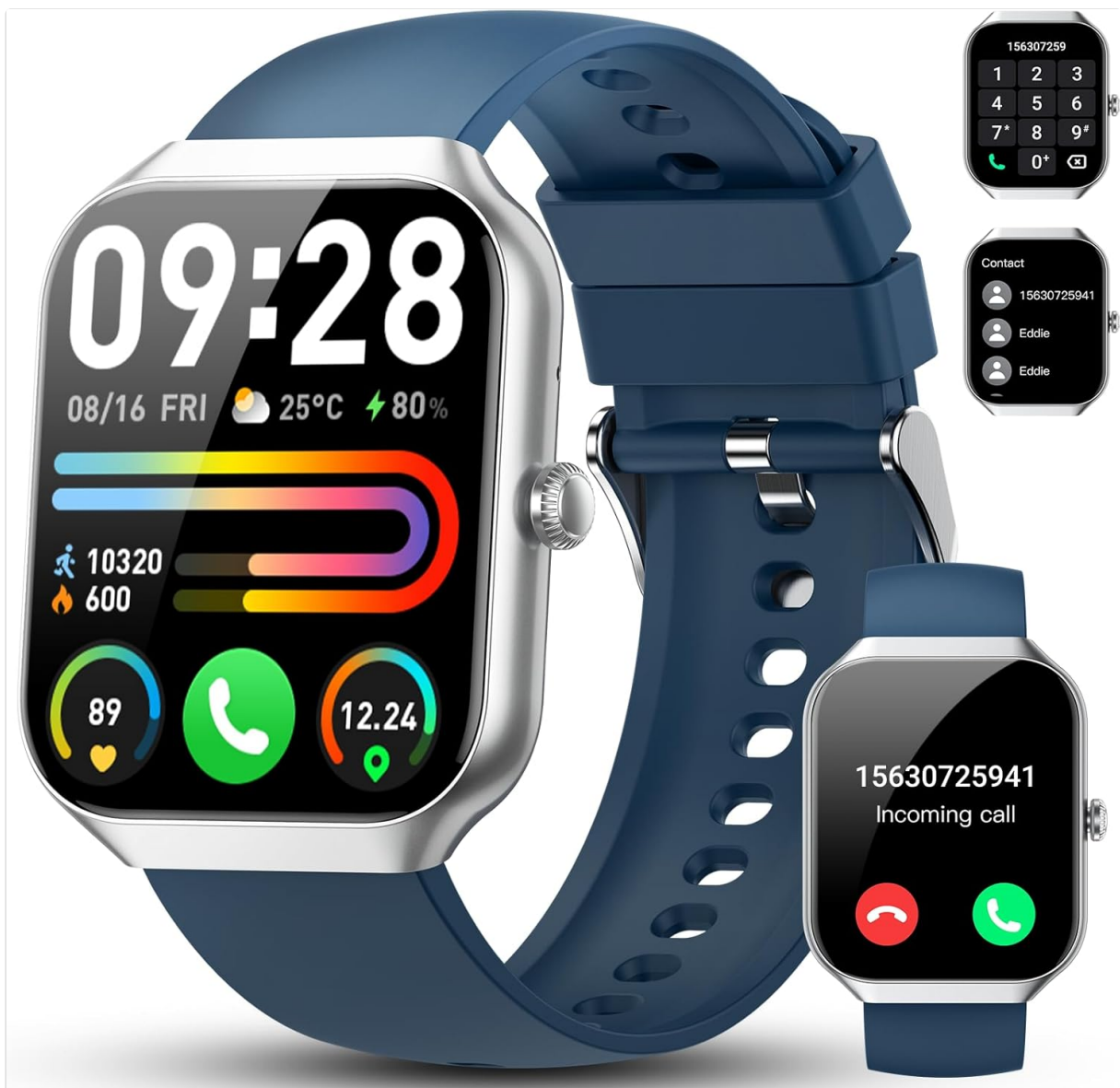
Image: The Motast P99-2024 Smart Watch displaying time, date, weather, and activity metrics on its main screen.

The Motast P99-2024 features a 1.96-inch HD touchscreen for intuitive control. Swipe left, right, up, or down to access different functions and menus. Press the side button to return to the home screen or wake the device.