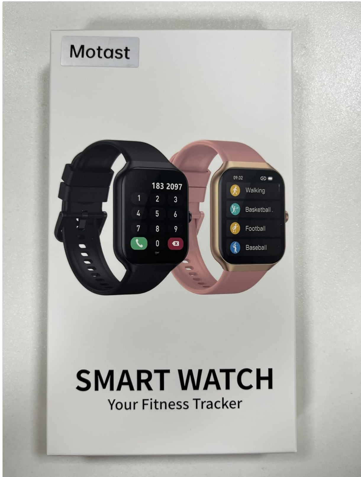
Image: The Motast P99-2024 Smart Watch displaying an incoming call and a dial pad for phone functions.