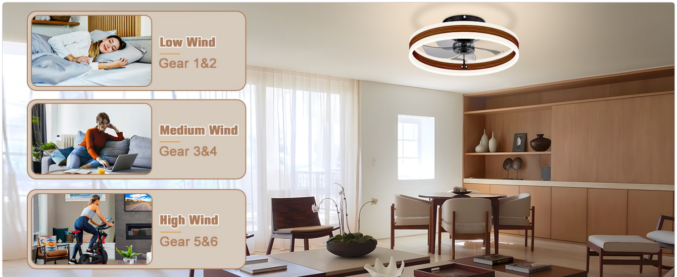
Image: Key features of the fan, including its brightness (4320 lumens), recommended room area (15-25 m 2 ), quiet operation, 6 wind speeds, smart lighting, and dual memory function.

Image: Visual representation of the fan's dimensions, highlighting its low-profile design with a 19.7-inch diameter and 5.3-inch height.