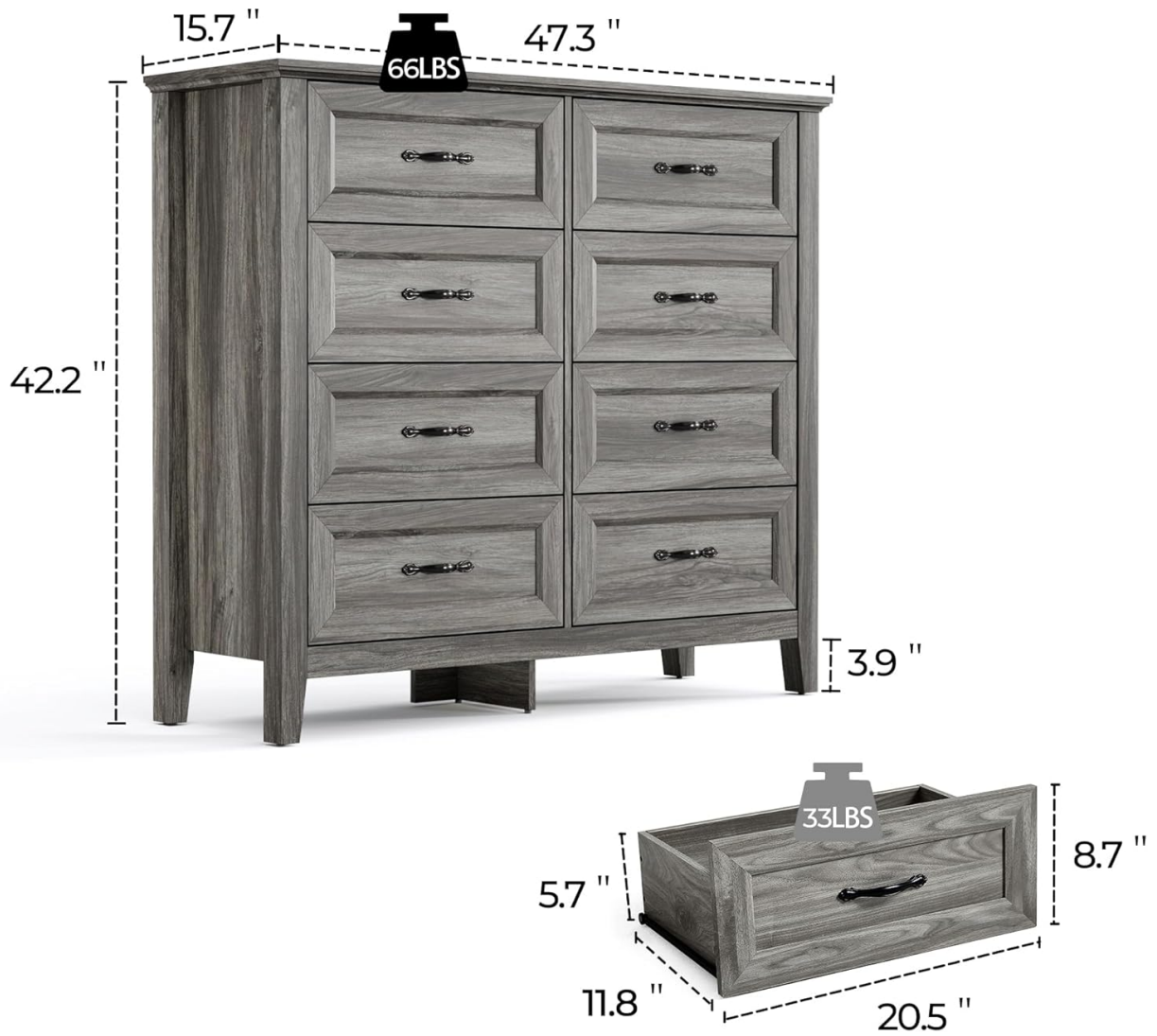
Image: Diagram illustrating the precise dimensions of the dresser and individual drawers, including weight capacities.