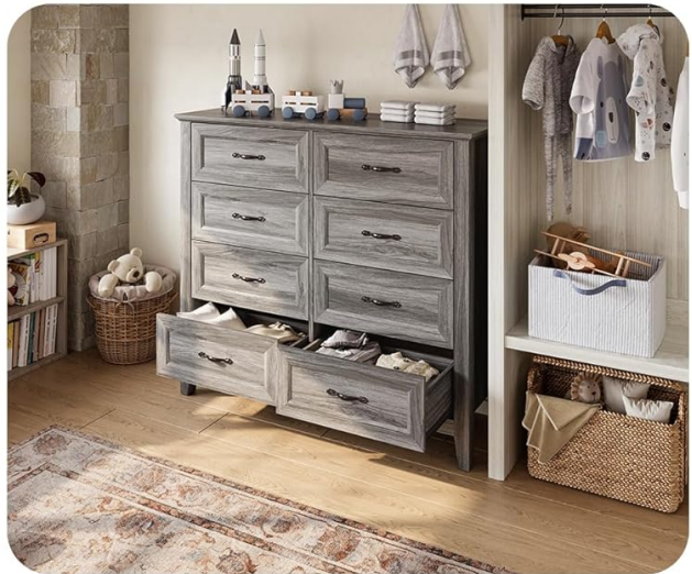
Image: The 8-drawer dresser displayed in different environments, including a bedroom, living room, and nursery, highlighting its versatility.