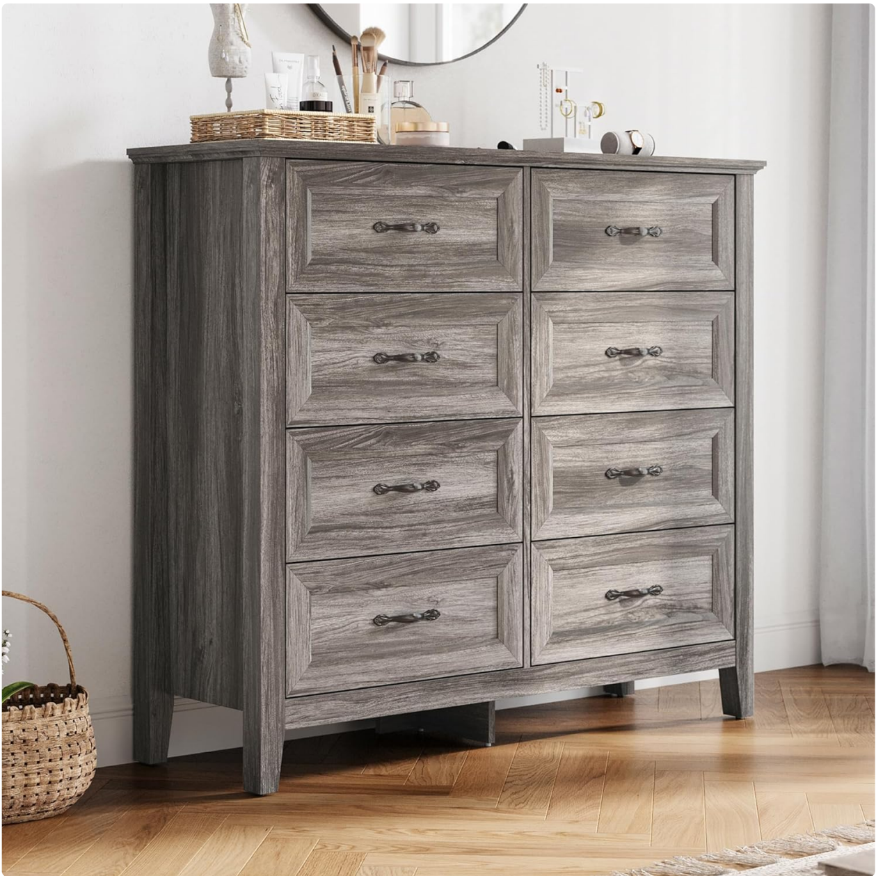
Image: The LINSY HOME Farmhouse 8-Drawer Dresser, showcasing its grey finish and eight drawers.