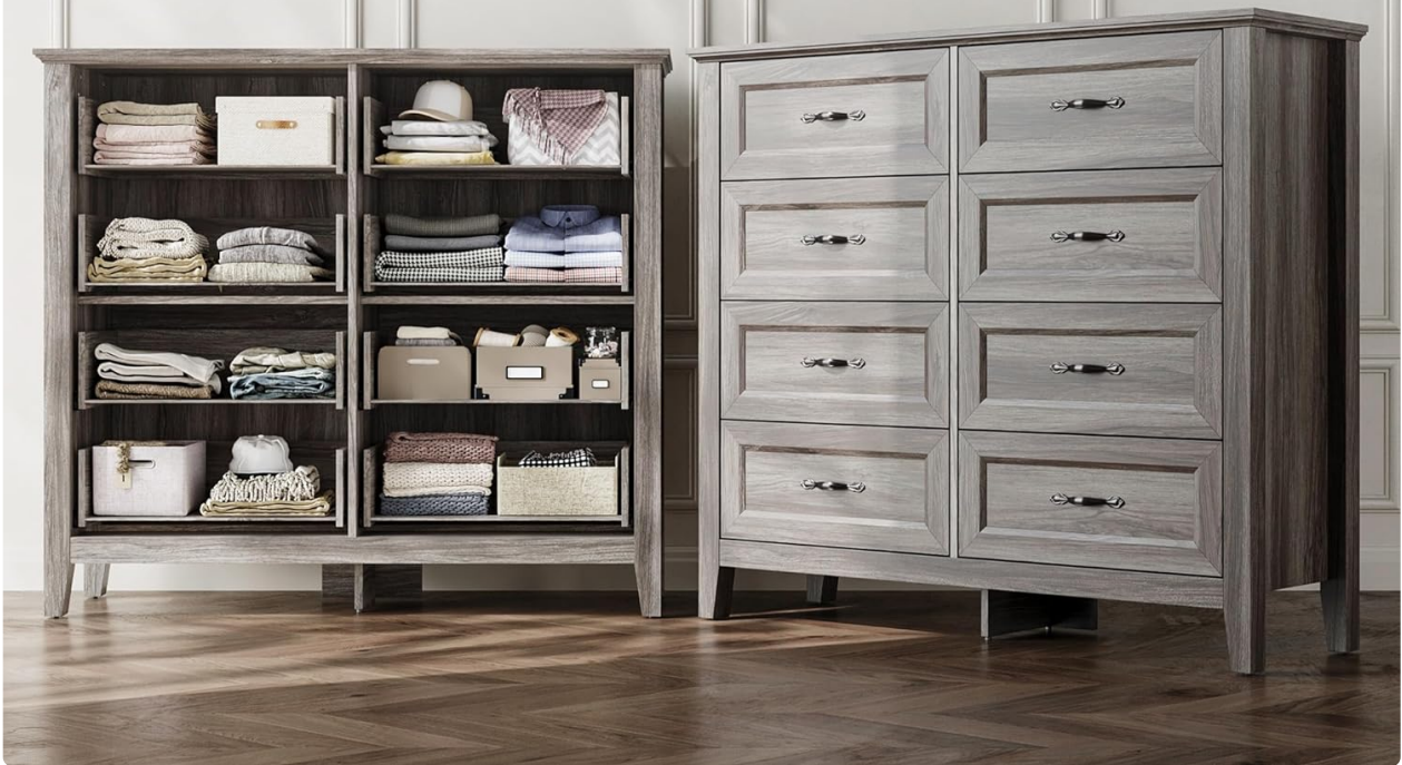
Image: A visual representation of the dresser's storage capacity, showing organized drawers for clothing and other items.