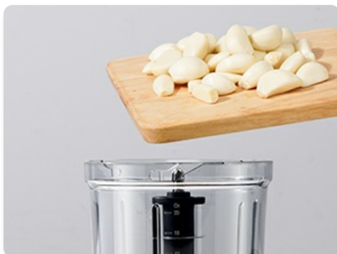
Step 3: Add ingredients to the bowl.