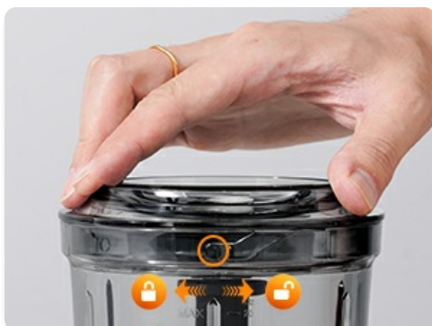
Step 4: Secure the bowl connection cover.