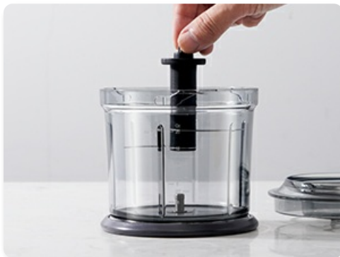
Step 2: Carefully insert the blade assembly.