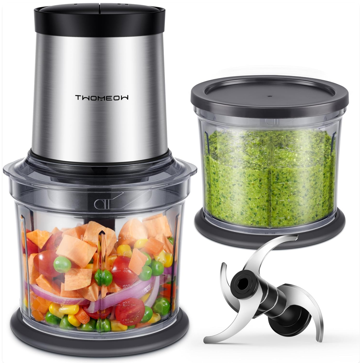
The TWOMEOW 4-Cup Electric Food Processor, showcasing its compact design, dual bowls, and sharp blade assembly.