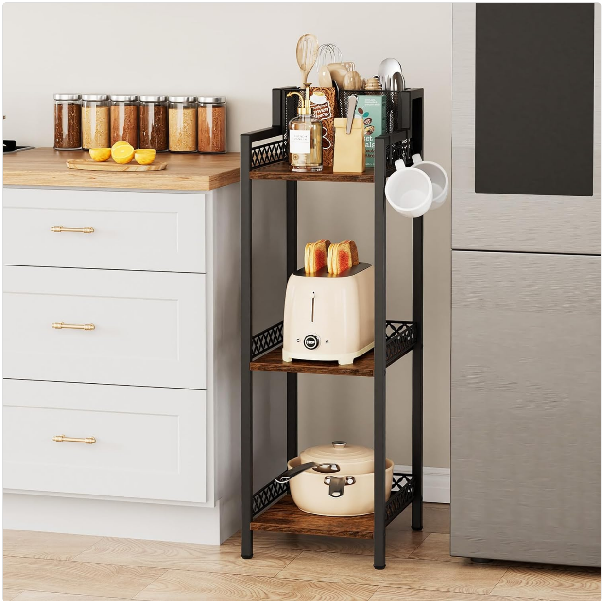
Figure 4: Rack in a kitchen setting. This image shows the rack holding kitchen items like a toaster, pots, and utensils, highlighting its adaptability.

Video 1: Overview of the bathroom storage shelf. This video demonstrates the features and potential uses of the FURFUN storage rack in a bathroom environment.