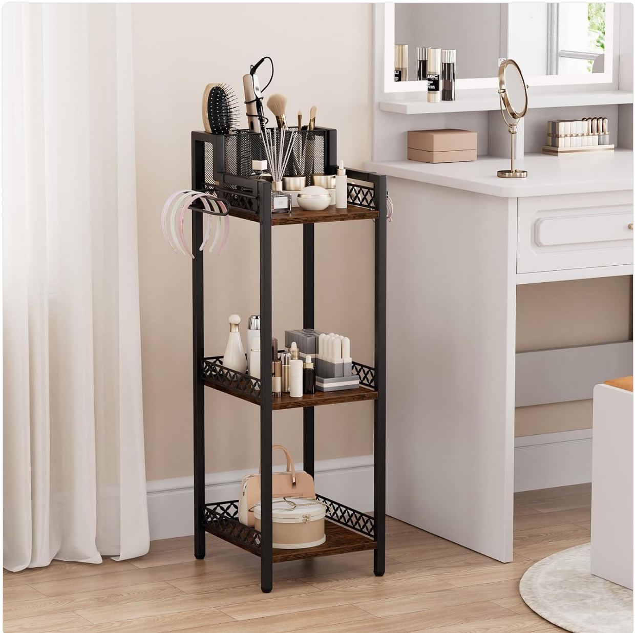
Figure 3: Rack utilized as a vanity organizer. This image demonstrates how the rack can store various cosmetic and hair care items, keeping a vanity area organized.