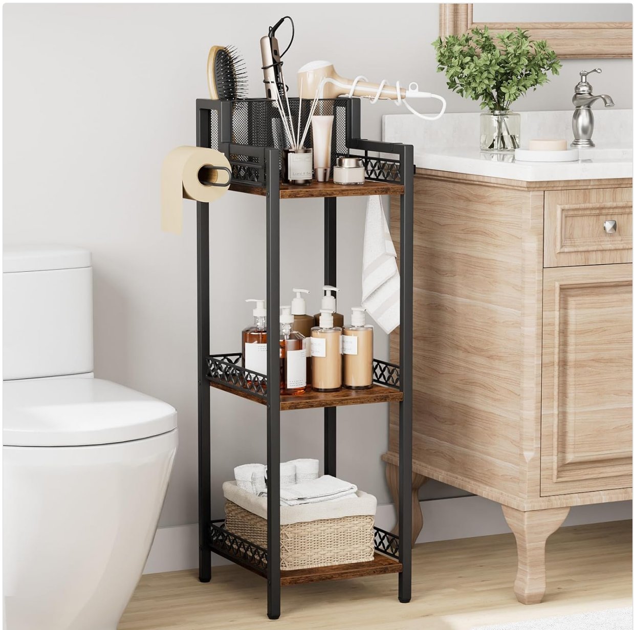
Figure 2: Assembled unit in a bathroom setting. This image demonstrates the rack's compact size and how it fits into narrow