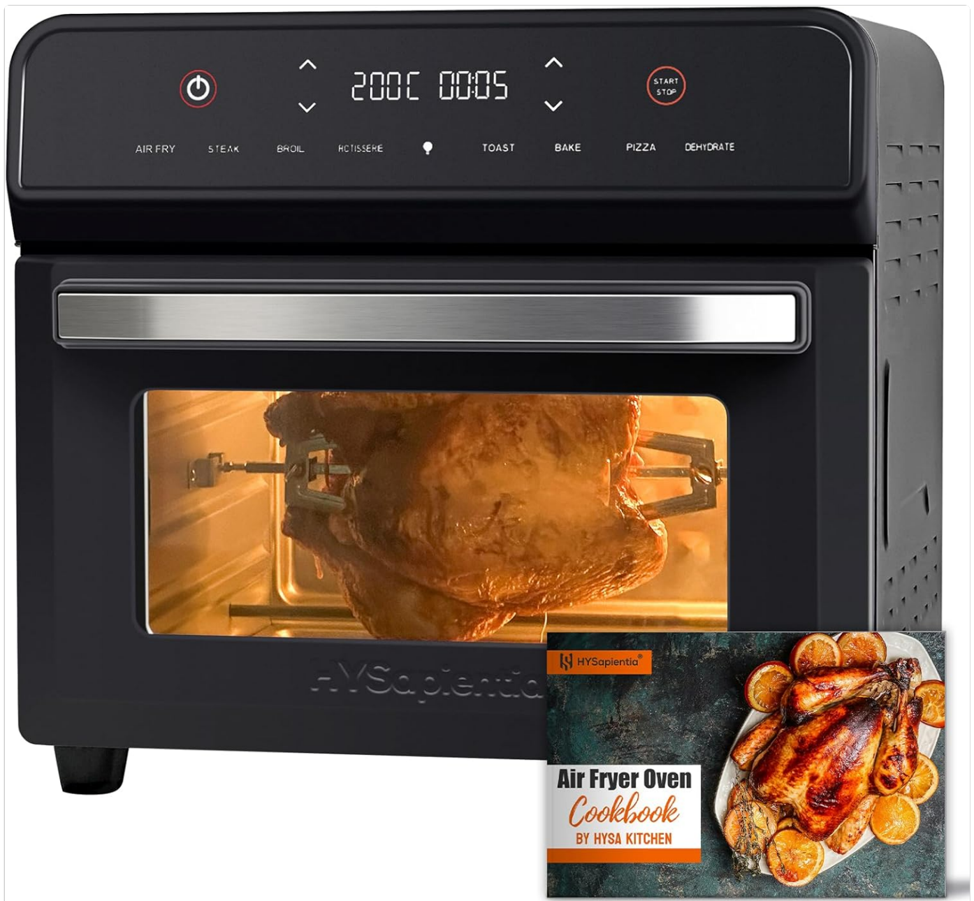
Image 5.2: Control Panel and Interior. This image shows the front of the HYSapientia Air Fryer Oven, highlighting the digital LED touchscreen control panel at the top and a rotisserie chicken cooking inside the oven cavity.