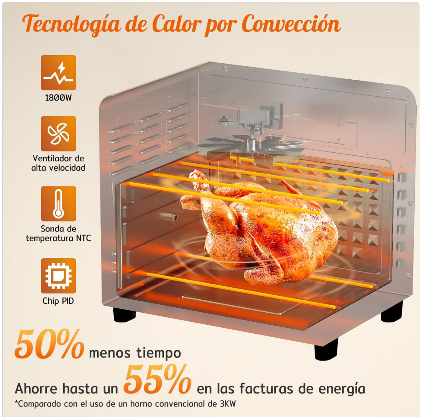
Image 5.1: Convection Heating Technology. This diagram shows the internal workings of the oven, highlighting the 1800W heating element, high-speed fan, NTC temperature probe, and PID chip, all contributing to efficient and even heat distribution.

The HYSapientia Air Fryer Oven features a digital LED touchscreen for intuitive control. It utilizes convection heating technology with an 1800W motor, high-speed fan, NTC temperature probe, and PID control chip for precise and efficient cooking.