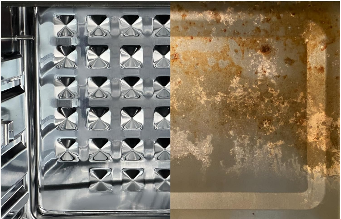
Image 6.1: Stainless Steel Interior Advantage. This image contrasts the HYSapientia oven's stainless steel interior, which is rust-resistant and easy to clean, with a coated interior that shows signs of rust and difficult-to-remove grease stains.