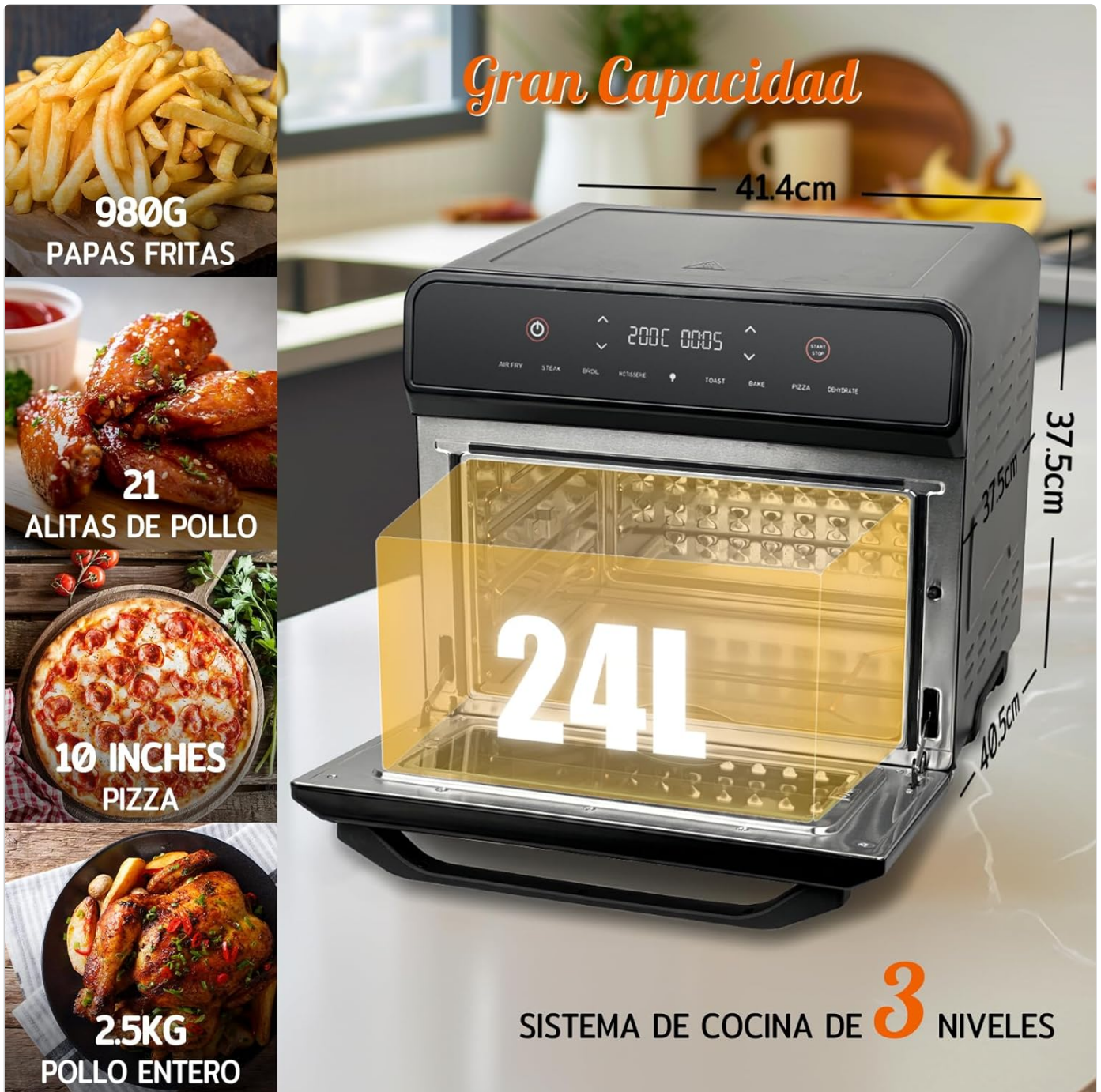
Image 8.1: Product Dimensions and Capacity. This image visually represents the 24-liter capacity of the HYSapientia Air Fryer Oven and provides its external dimensions (41.4 cm length, 37.5 cm width, 37.5 cm height), along with examples of food quantities it can accommodate.