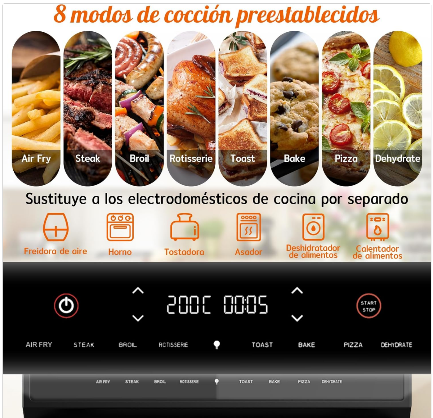
Image 5.3: 8 Preset Cooking Modes. This image illustrates the eight distinct cooking functions available on the HYSapiencia Air Fryer Oven: Air Fry, Steak, Broil, Rotisserie, Toast, Bake, Pizza, and Dehydrate, demonstrating its versatility. Each preset program has a default temperature and time, which can be adjusted manually to suit your specific recipe.