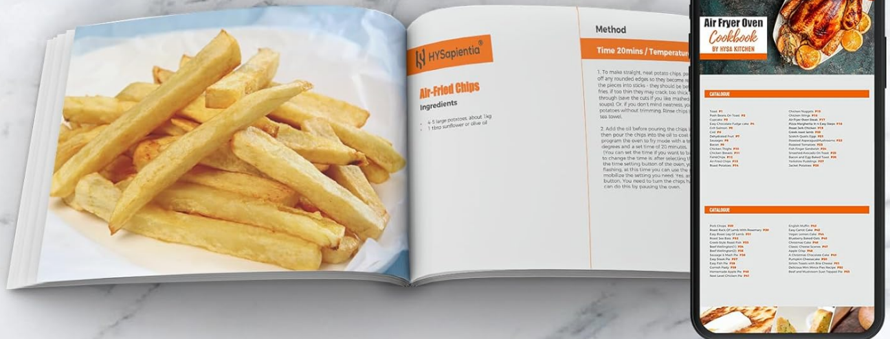
Image 5.4: Recipe Guide. This image shows an open cookbook provided with the HYSapientia Air Fryer Oven, featuring a recipe for air-fried chips, along with a digital display of various food items that can be prepared.