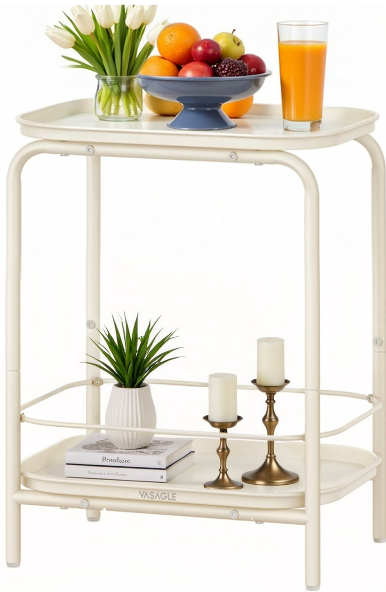
Image: The VASAGLE 2-Tier Side Table in Cream White, showcasing its elegant design and two-tier storage in a modern living room.