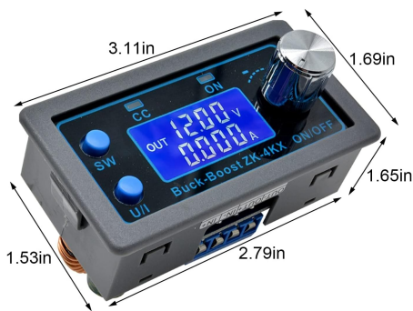
Figure 4.2: Product Dimensions

This image illustrates the physical dimensions of the ZK-4KX module. The length is approximately 3.11 inches (7.9 cm), width 1.69 inches (4.3 cm), and height 1.53 inches (3.9 cm). The mounting hole distance is 2.79 inches (7.1 cm).