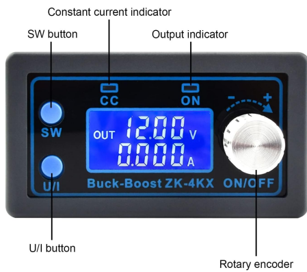
Figure 4.3: Product Function Keys

This image highlights the control elements: the "SW" button, "U/I" button, constant current indicator (CC), output indicator (ON), and the rotary encoder.