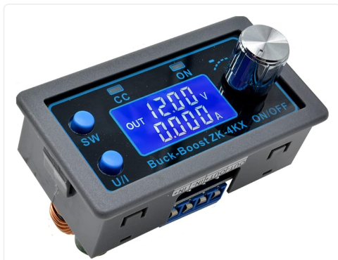
Figure 4.1: Front View of the ZK-4KX Module

This image displays the front of the Heemol ZK-4KX DC Buck Boost Converter, showing the LCD screen, two control buttons (SW and U/I), and the rotary encoder on the right. The screen indicates "OUT 12.00V 0.000A".