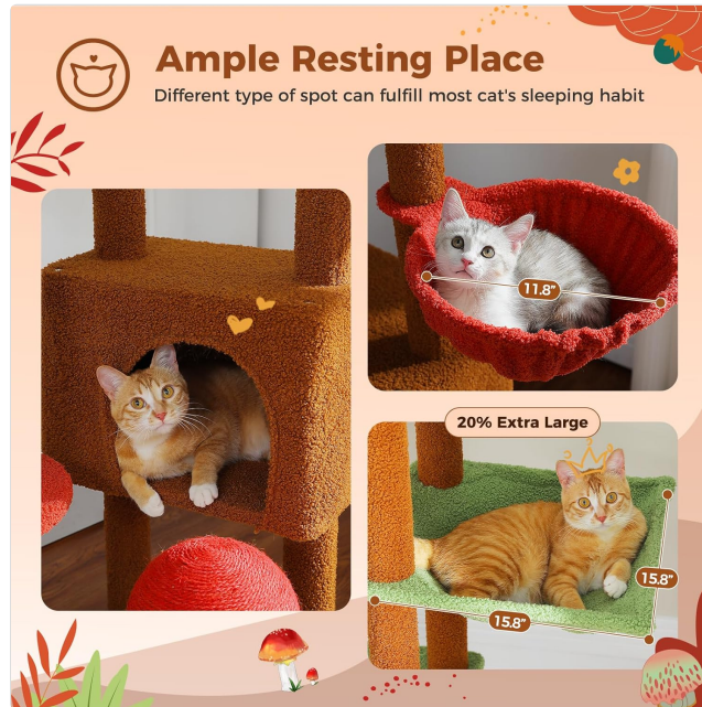
Image: Diagram illustrating the total height and various platform dimensions of the cat tree.