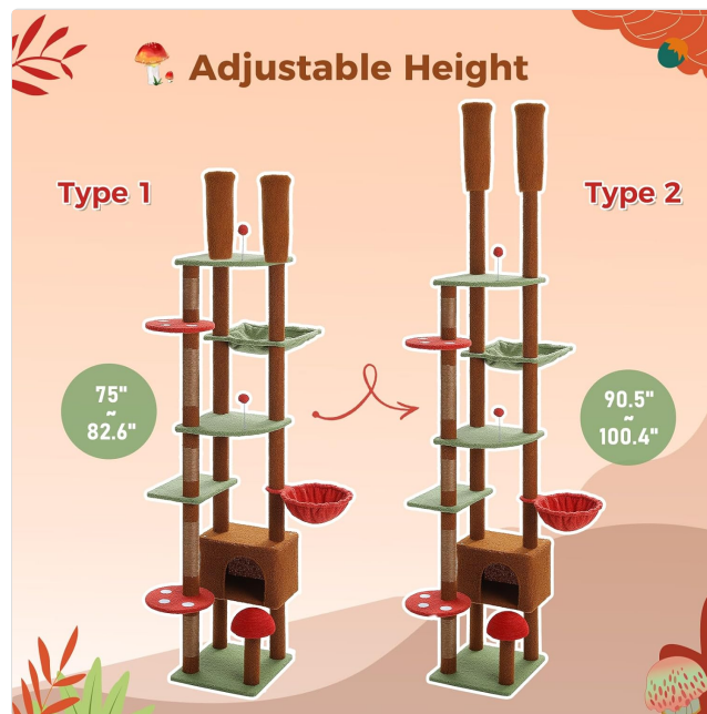
Image: Illustration of the cat tree's adjustable height feature, showing two possible configurations (Type 1 and Type 2) to fit different ceiling heights.

5. Integrate the hammock and mushroom-shaped elements as indicated in the assembly guide.