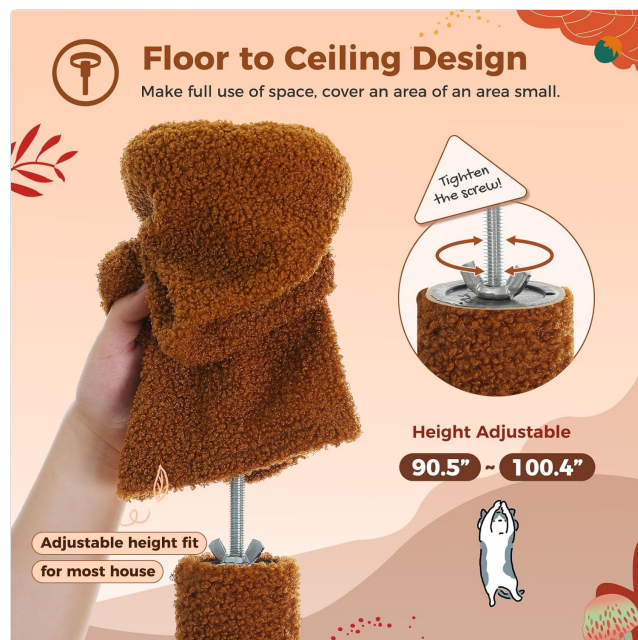
Image: Detail of the adjustable height mechanism, showing how to tighten the screw to secure the cat tree against the ceiling for stability.