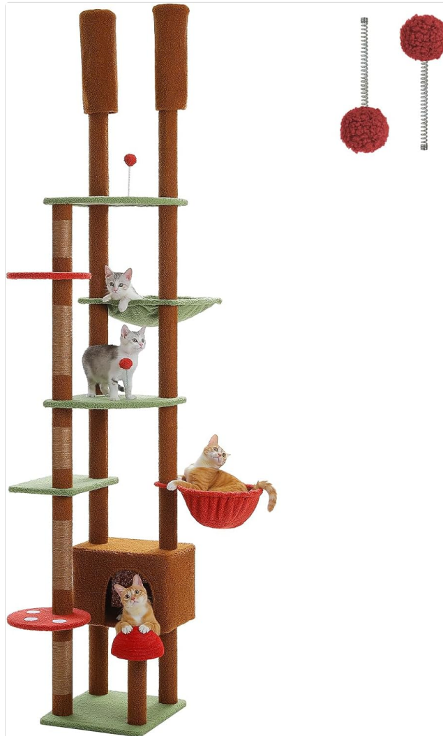
Image: Overview of the PEQULTI Mushroom Cat Tree, showing all main components including platforms, condo, hammock, and scratching posts.