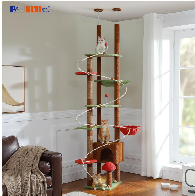
Image: A cat scratching a sisal post and another cat on a mushroom-shaped springboard, highlighting the scratching support features.