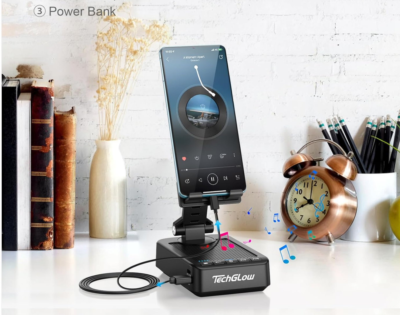
Image: The TechGlow L40 device highlighting its three core functions: cellphone stand, Bluetooth speaker, and power bank.