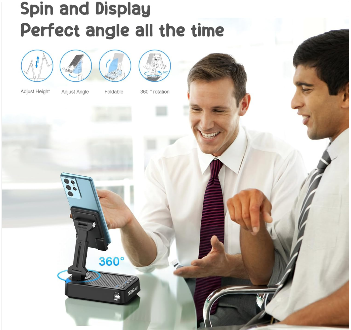
Image: The TechGlow L40 stand demonstrating its adjustable height, angle, and 360-degree rotation features.