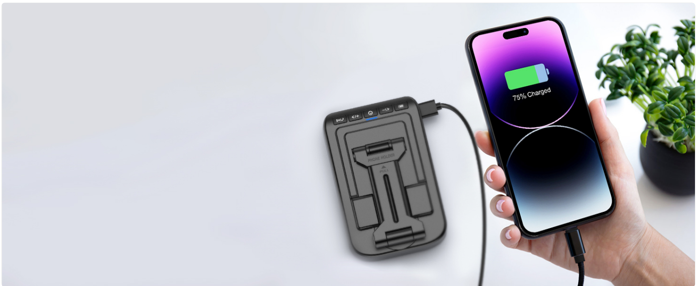
Image: A smartphone connected to the TechGlow L40, demonstrating its power bank functionality to charge external devices.