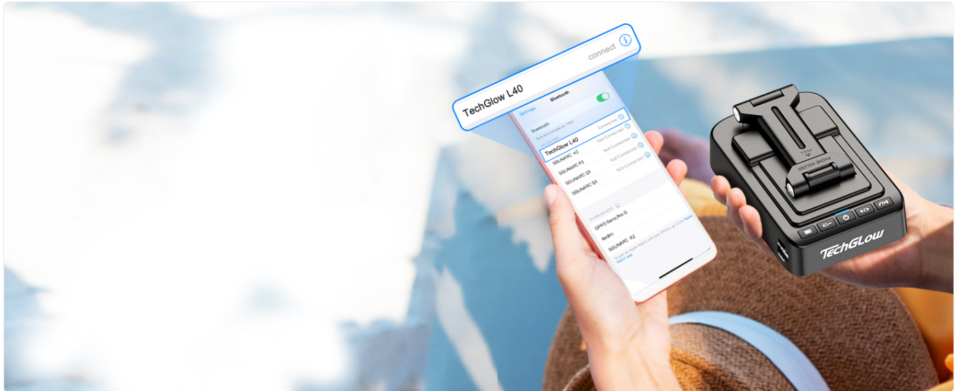
Image: A smartphone displaying its Bluetooth settings, ready to connect to the "TechGlow L40" device.