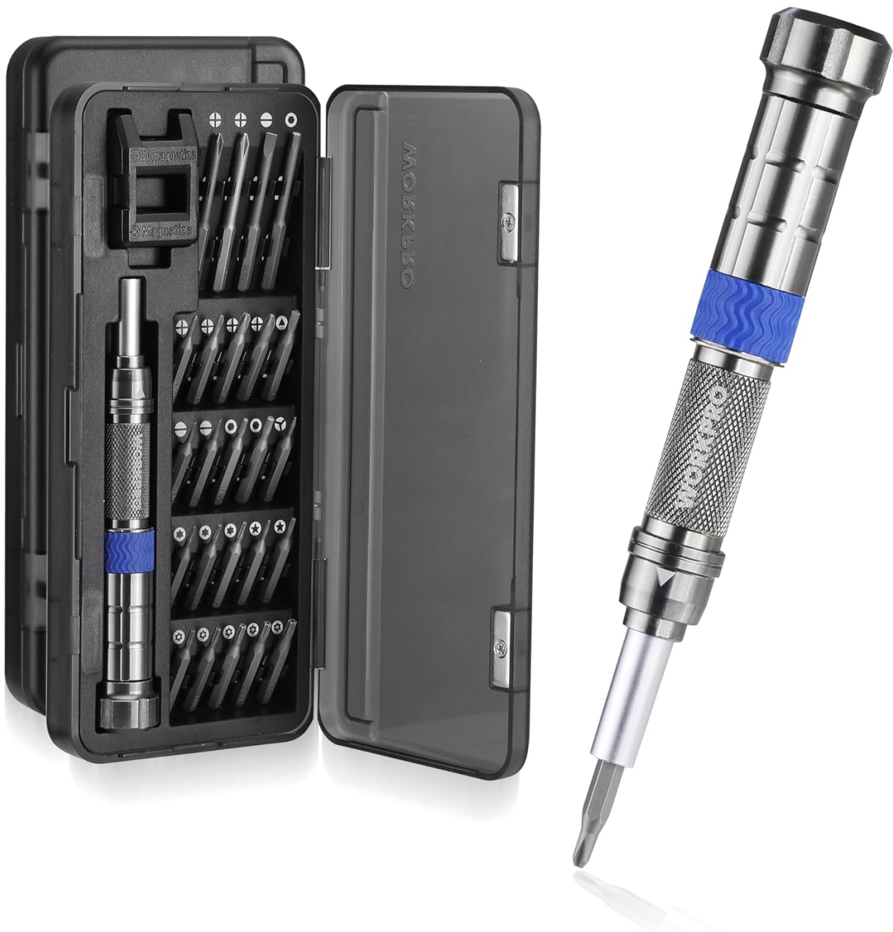
Image 1: The WORKPRO 24-in-1 Small Screwdriver Set, showcasing the compact case and the main screwdriver handle.