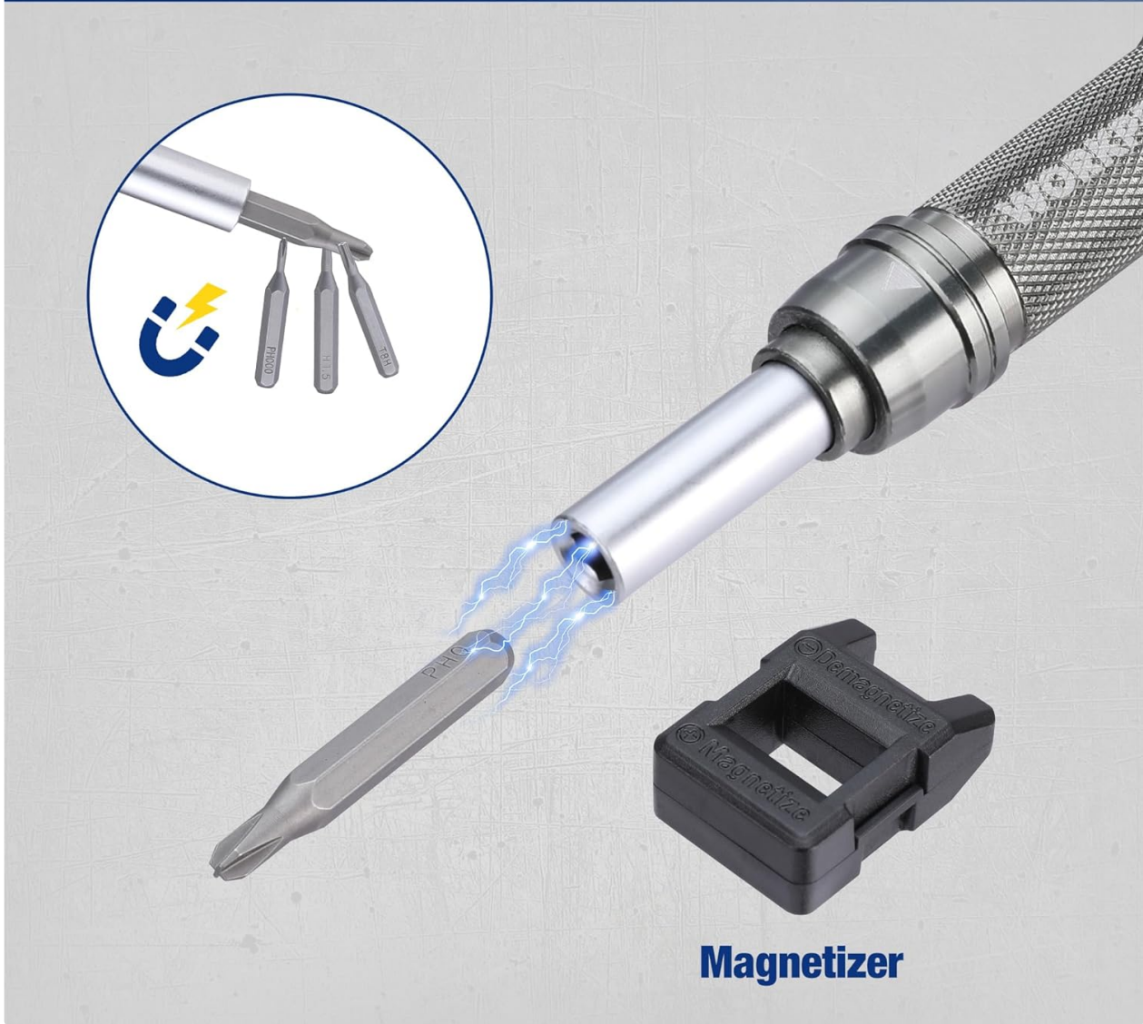
Image 5: Illustration of the strong magnetism feature, showing a bit attracting small screws and the magnetizer tool.