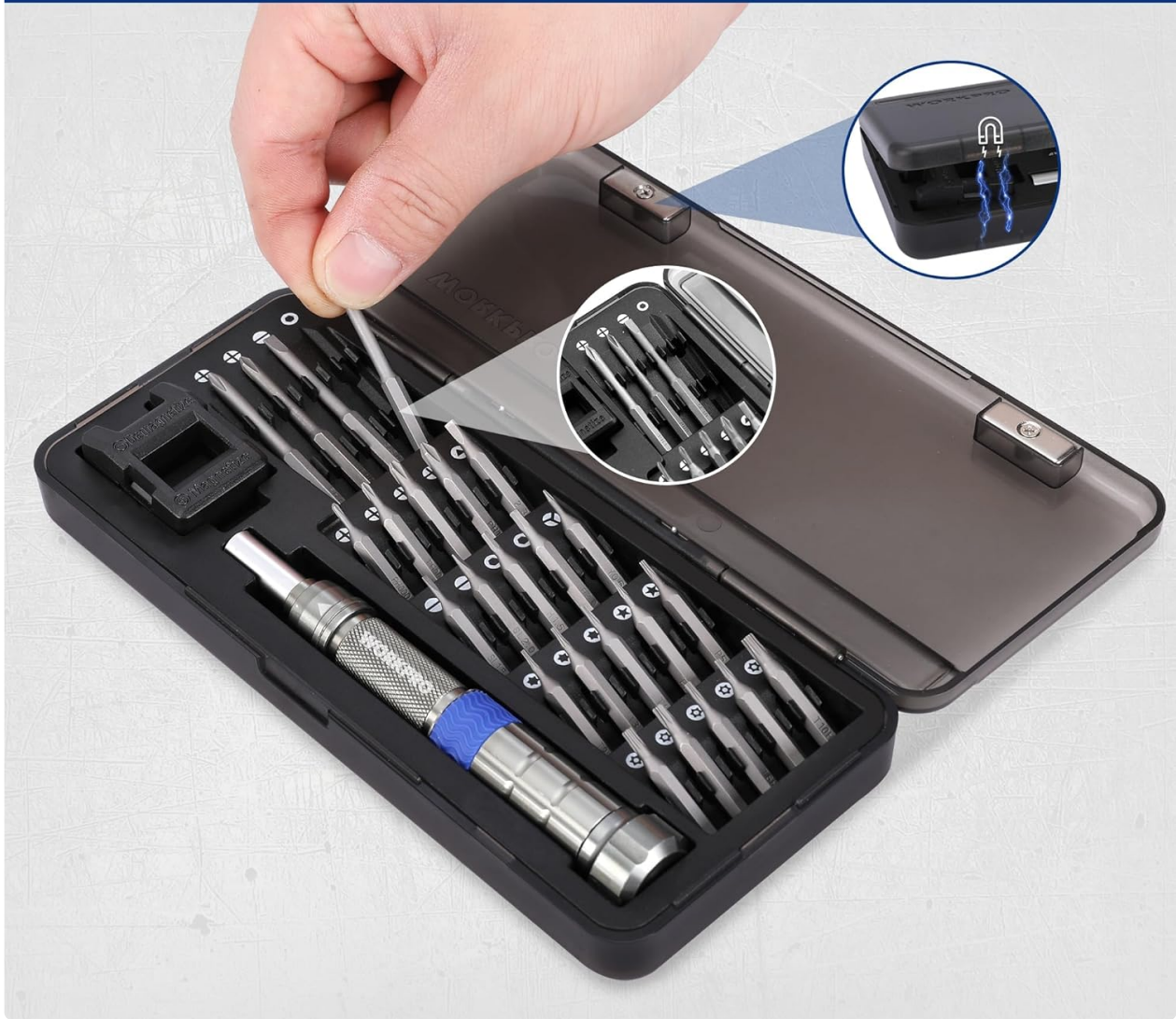
Image 3: The magnetic storage box, designed for stable and easy transport, keeping all bits in place.

Stable and easy transport Keep bits in place and easy access