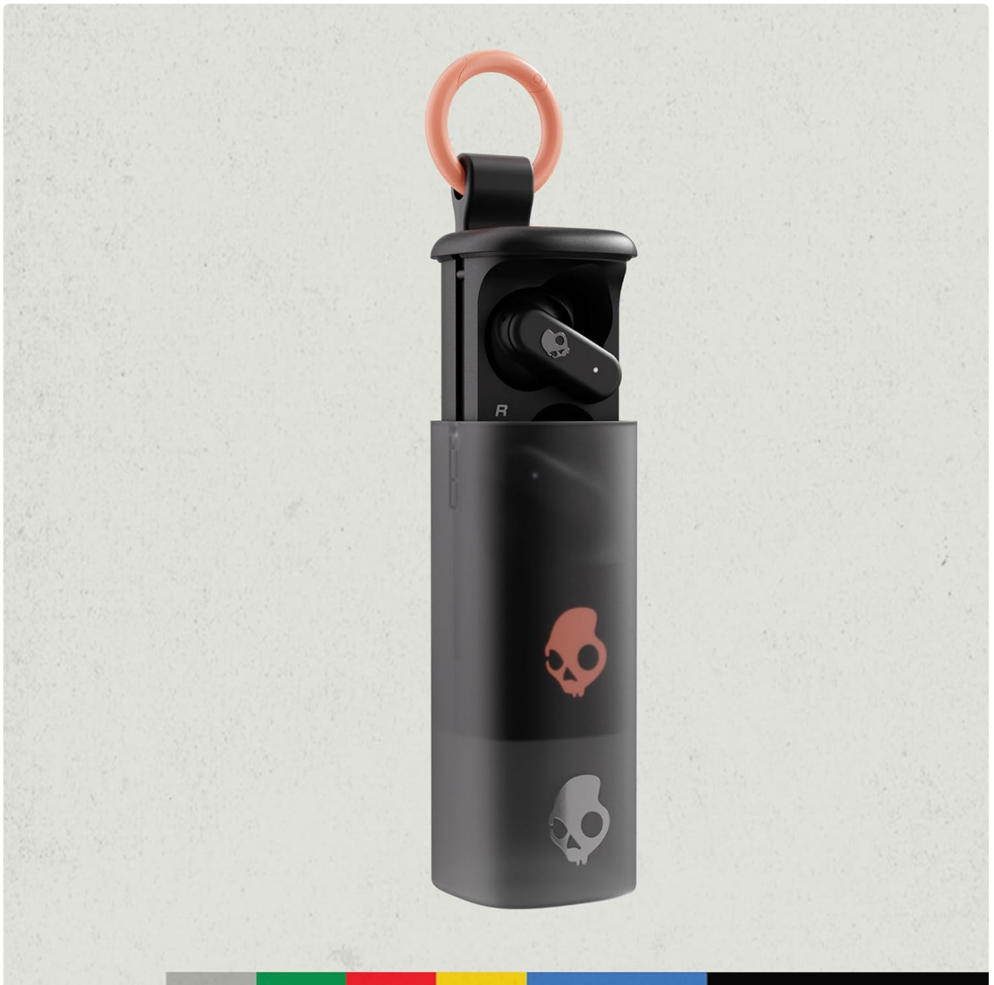
Image: Skullcandy Dime Evo earbuds securely placed inside their charging case, ready for charging or storage.