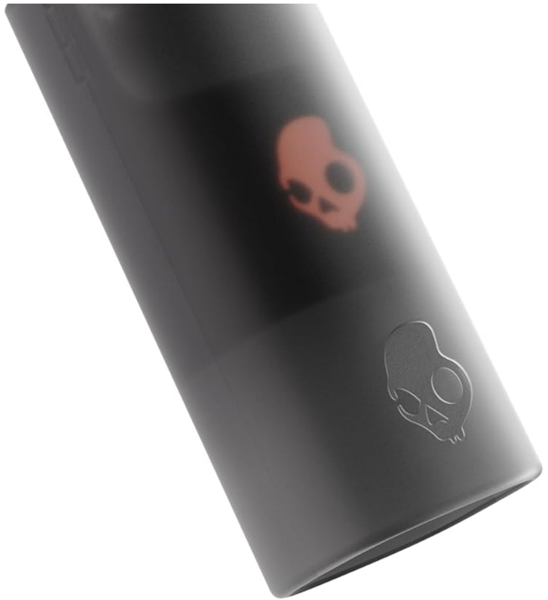
Image: Skullcandy Dime Evo Wireless Earbuds with their charging case, featuring a clip for easy portability.