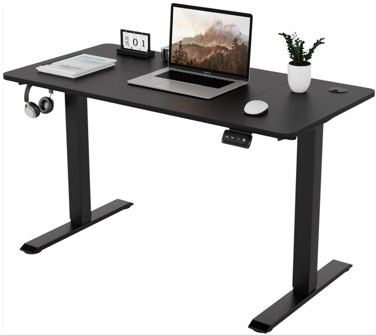
Image 1: The TRIUMPHKEY Electric Standing Desk, showcasing its sleek design and functionality in a typical workspace.