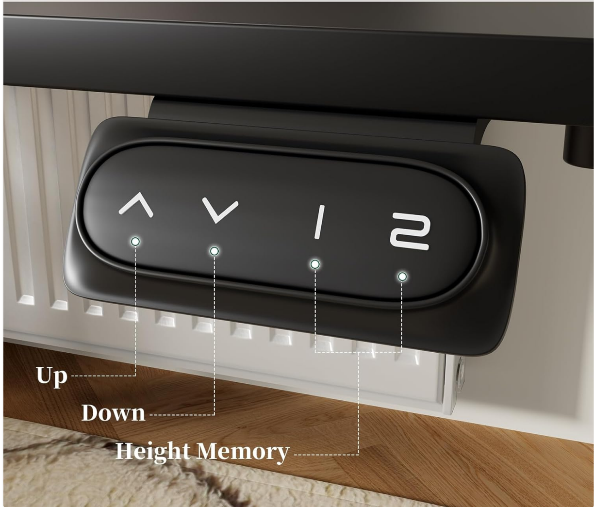
Image 4: Visual representation of the desk's height adjustment capabilities, accommodating various user heights and postures.