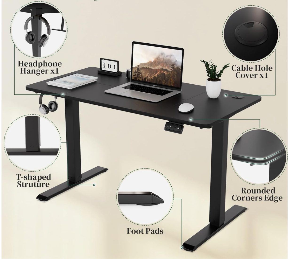
Image 2: Key product details, illustrating the headphone hanger, cable management hole, rounded corners, stable T-shaped leg structure, and protective foot pads.