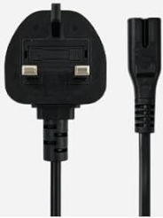
100~240V AC power cable