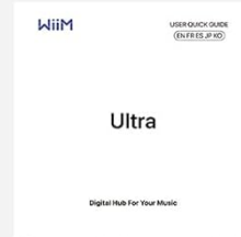
Quick start guide