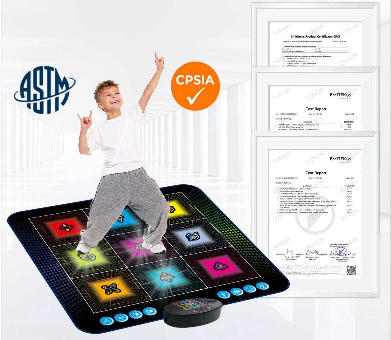
Image: The SUNLIN dance mat with a child playing, alongside certifications for safety and durability, including ASTM and CPSIA standards. This illustrates the product's adherence to safety regulations.