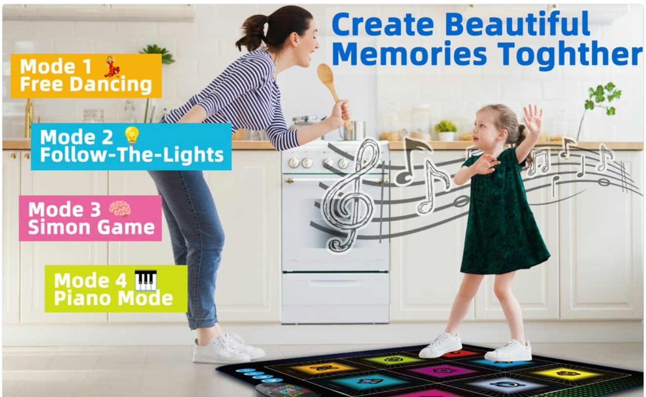
Image: A family interacting with the SUNLIN dance mat, with overlaid text indicating the four game modes: Free Dancing, Follow-The-Lights, Simon Game, and Piano Mode. This visually explains the different play options available.