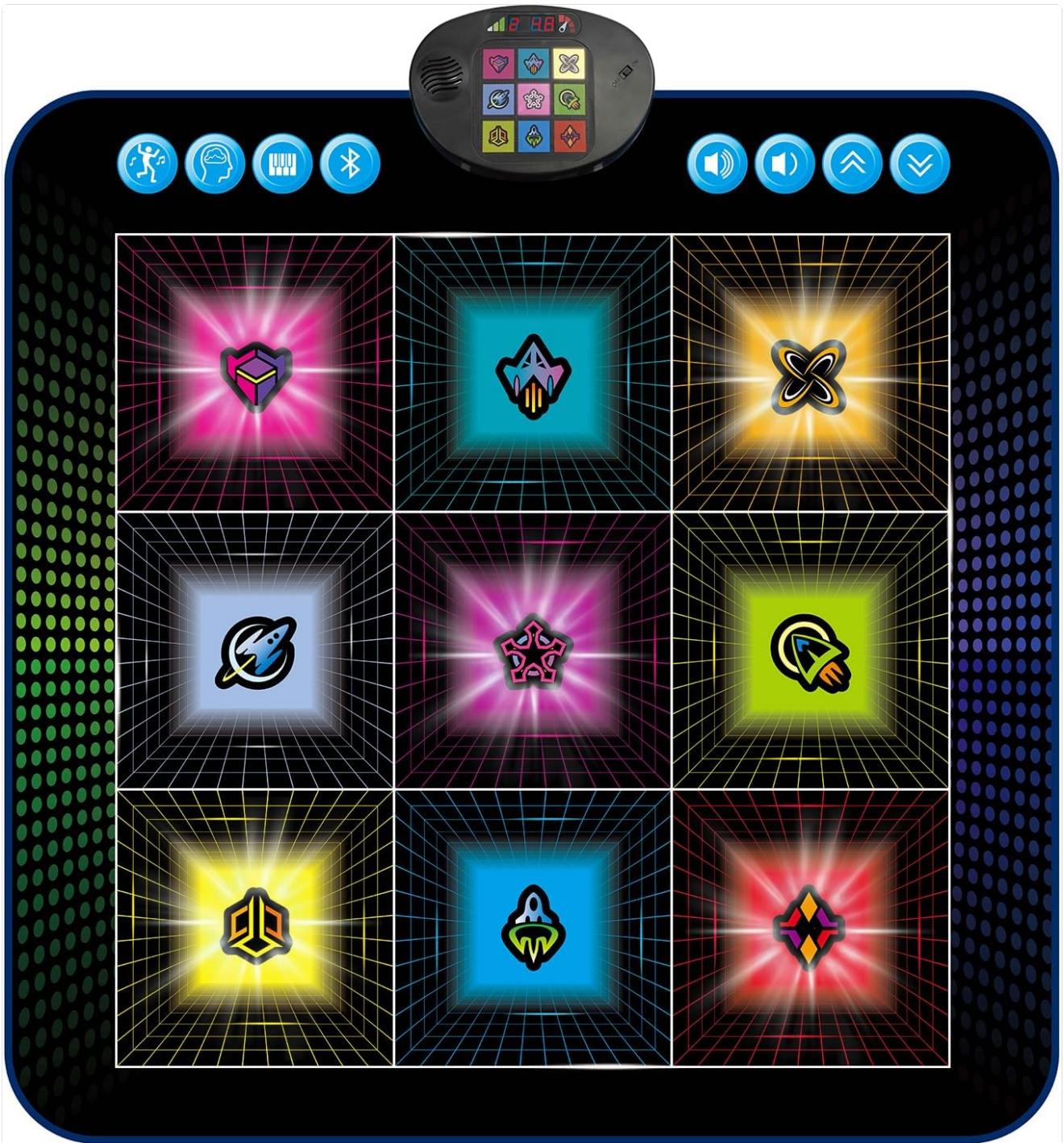
Image: The SUNLIN Light Up Dance Mat unfolded and laid flat, showcasing its 9 light-up pads and central control unit. This provides a clear view of the product ready for use.