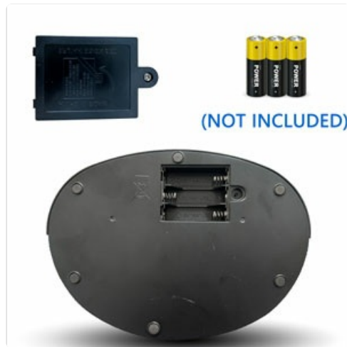
Image: A close-up view of the battery compartment on the underside of the dance mat's control unit, showing where three AA batteries are inserted. This illustrates the battery installation process.