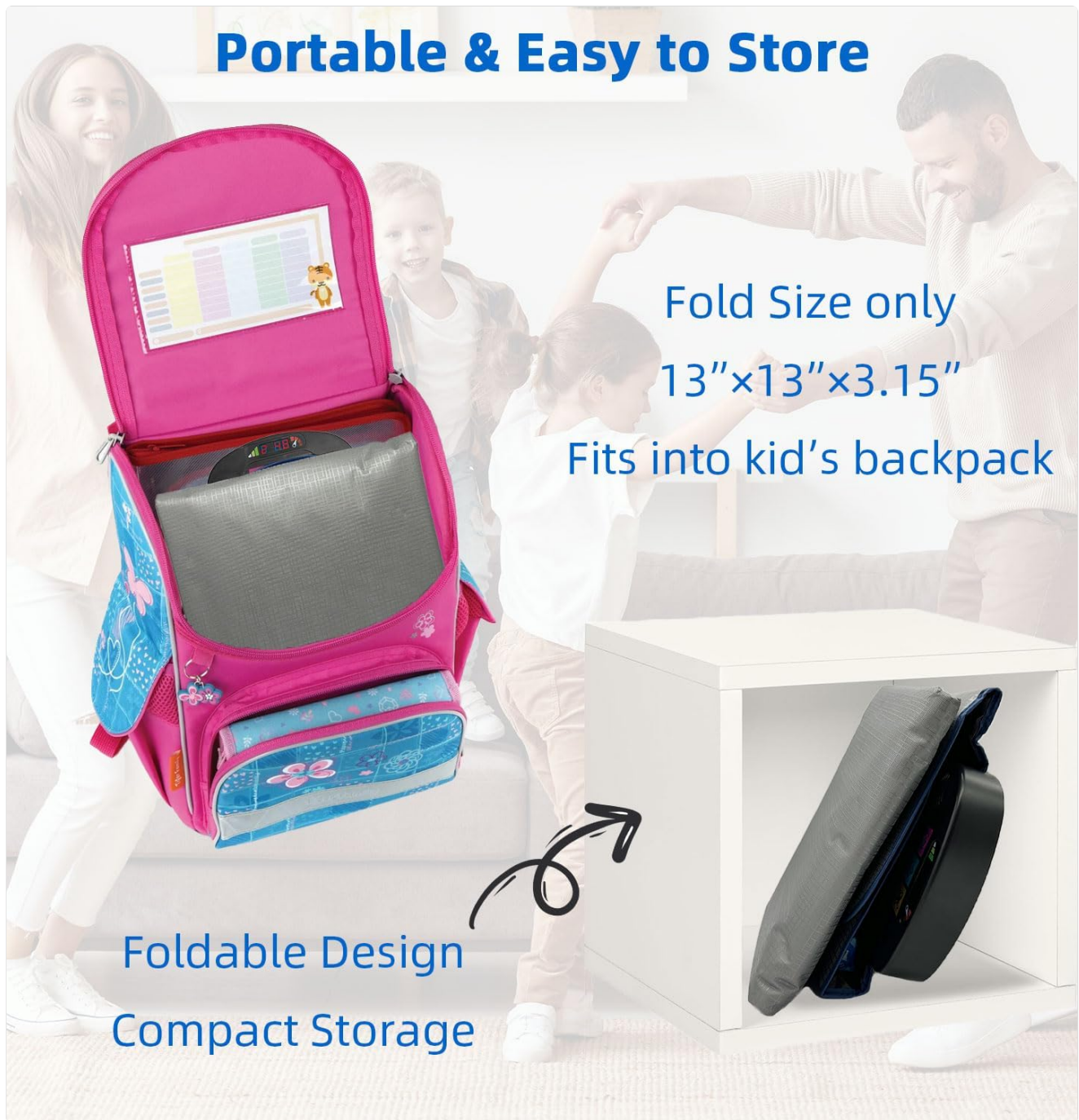
Image: The SUNLIN dance mat folded into a compact size (13"x13"x3.15"), demonstrating its portability and ease of storage, fitting into a backpack or small space. This highlights the convenience of the product's design.

direct sunlight and moisture. Its compact folded size allows for storage in closets or under beds.