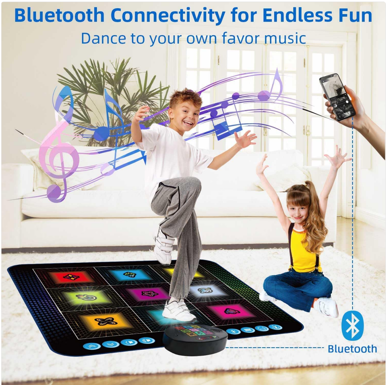
Image: A child enthusiastically dancing on the SUNLIN Light Up Dance Mat, with a hand holding a smartphone connected via Bluetooth, illustrating the wireless music streaming capability. This shows how users can play their own music.