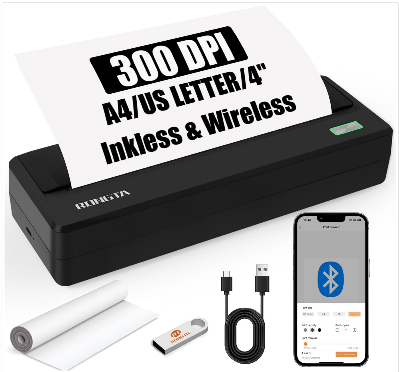
Figure 2: All items typically found inside the product packaging.