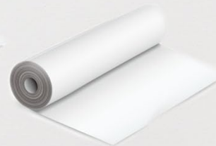
A5 (4.33") Labels