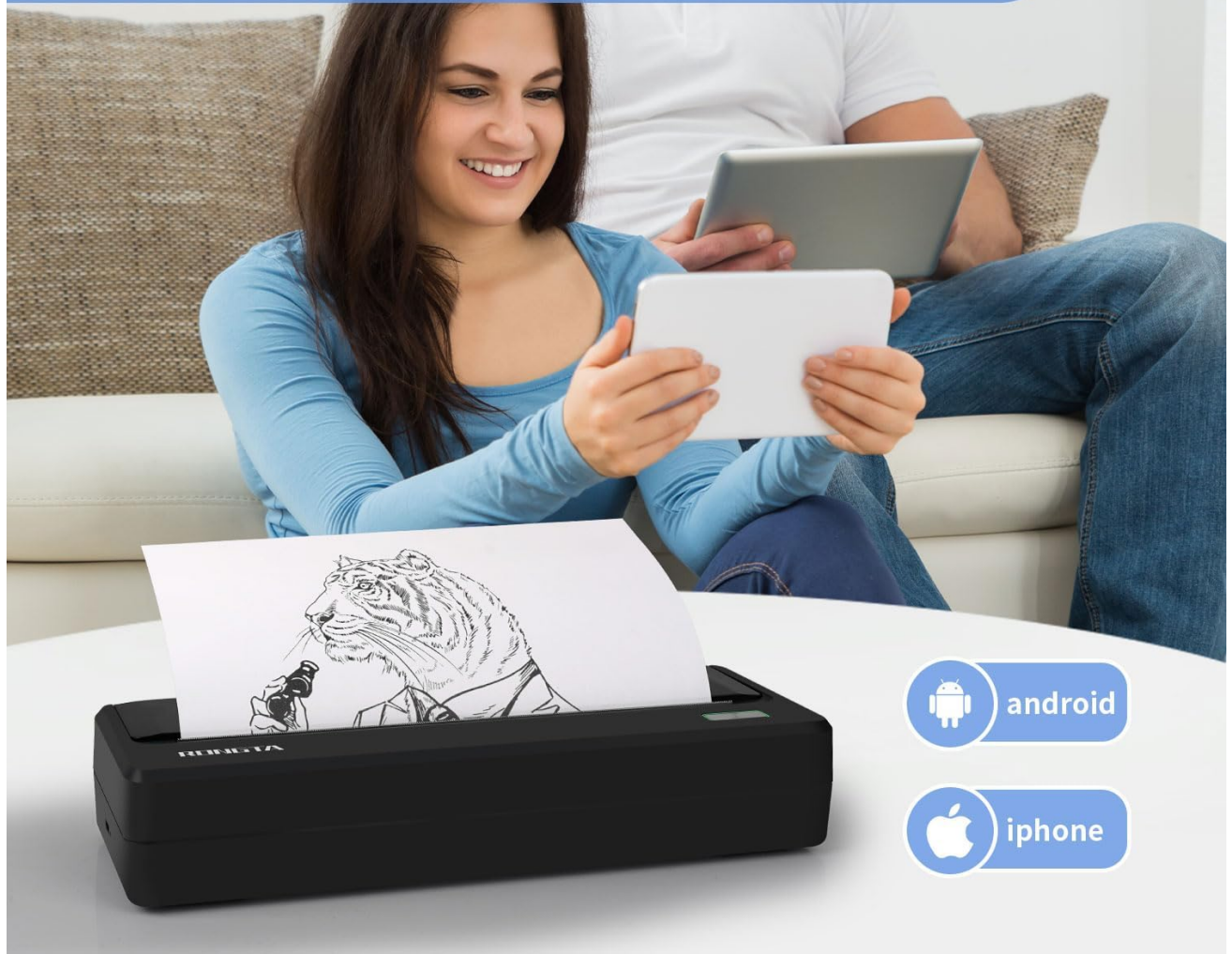
Figure 7: The printer is compatible with both Android and iOS devices for convenient home use.

Perfect for Home Use – Compact, Efficient, and Wireless