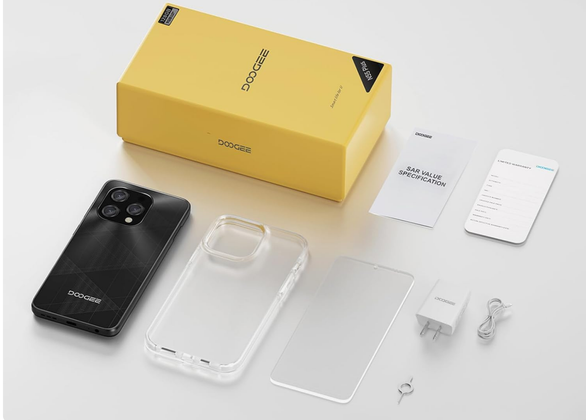
Figure 2.1: Package Contents