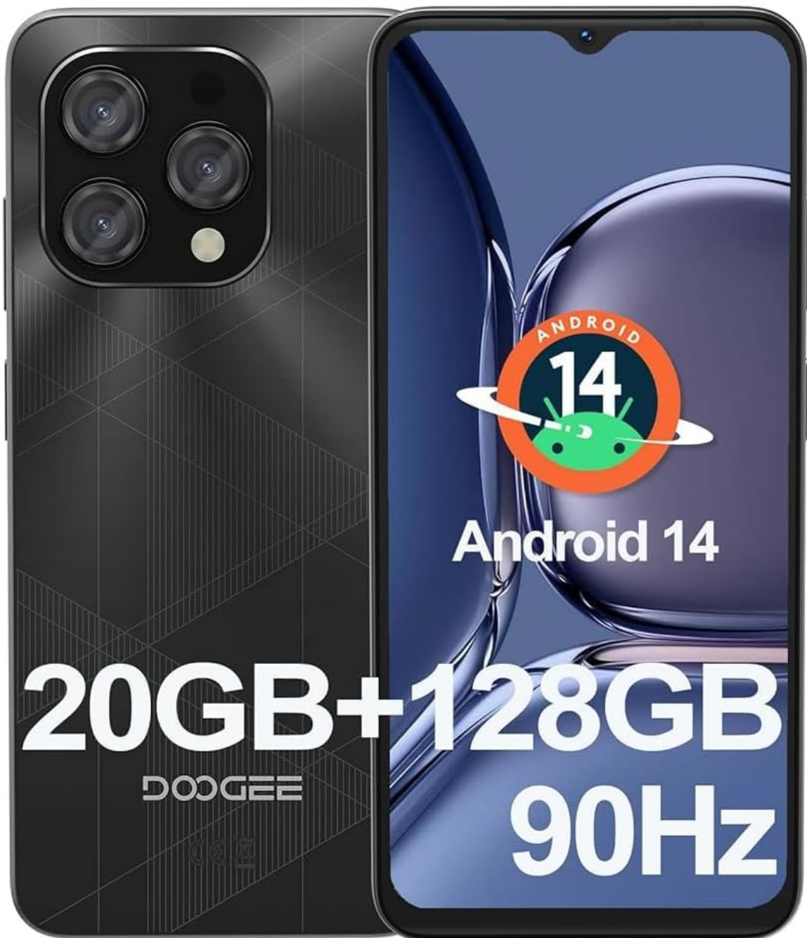
Figure 1.1: DOOGEE N55 Plus Front and Rear View

This device combines a lightweight and ultra-thin design with powerful internal components, including an octa-core processor and expandable memory, ensuring a smooth user experience.