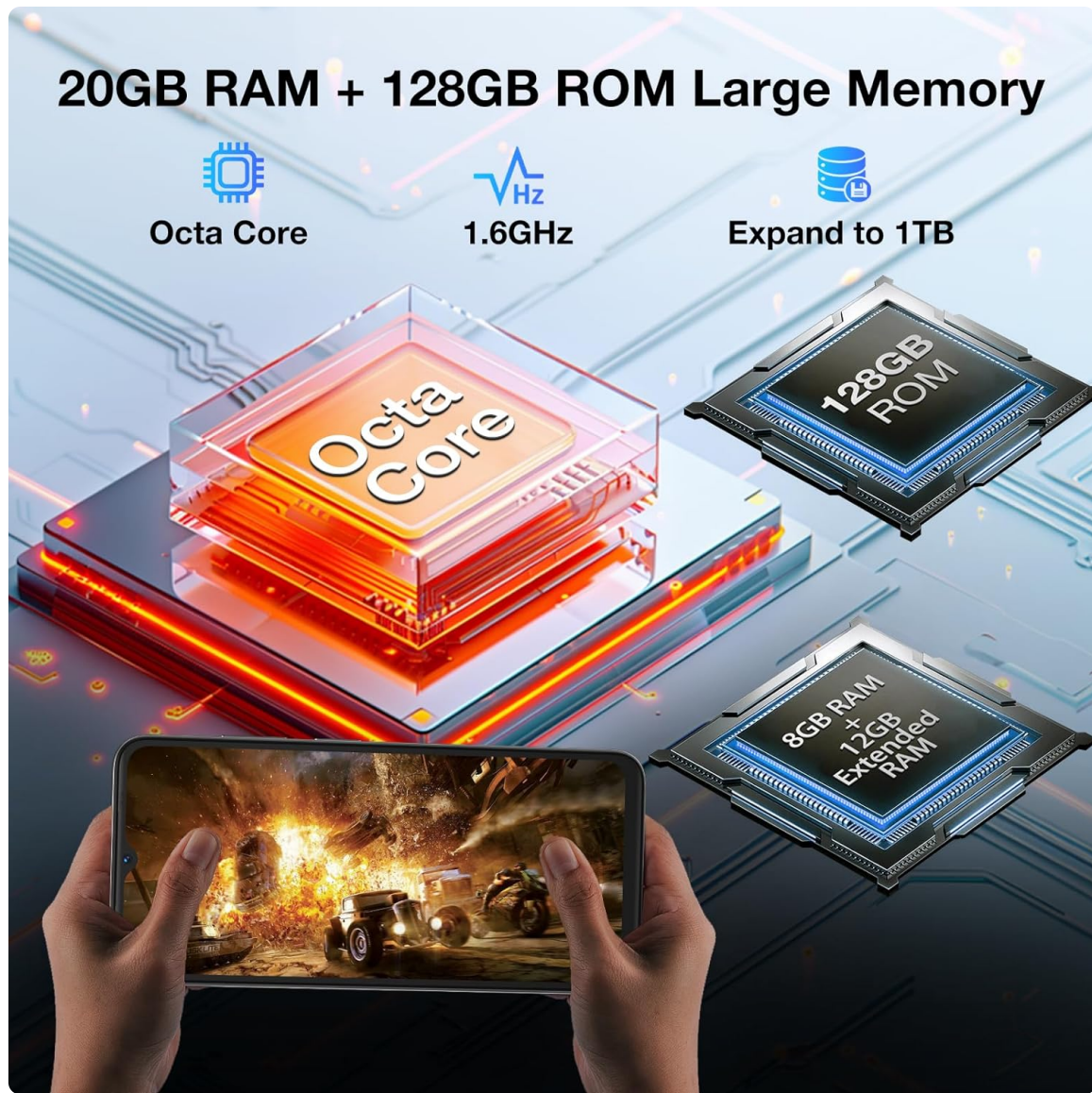
Figure 4.2: Performance and Memory

Your browser does not support the video tag. This video showcases the DOOGEE N55 Plus's powerful performance with its 20GB RAM and 128GB storage, emphasizing smooth operation.