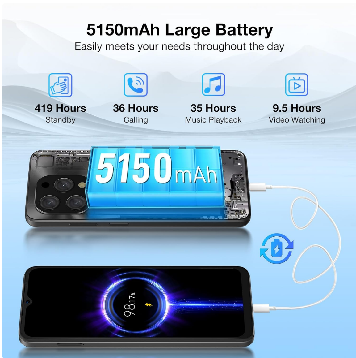
Figure 3.2: Charging and Battery Life Overview