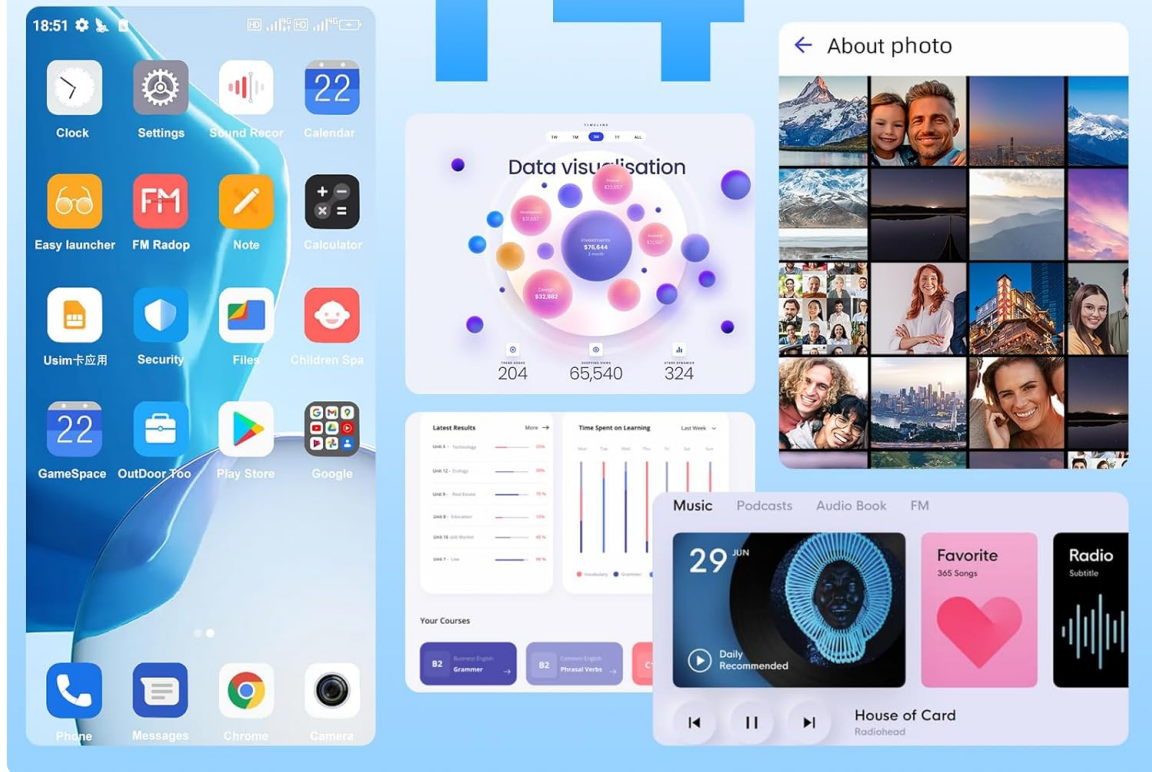
Figure 1.2: Ergonomic Design of the DOOGEE N55 Plus