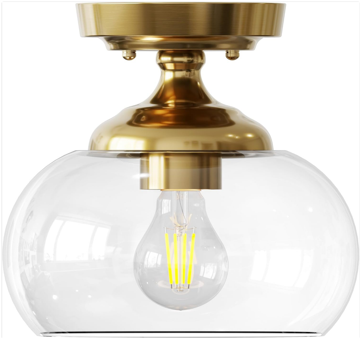
Image 1: VONLUCE 8.3-inch Industrial Semi Flush Mount Ceiling Light with clear glass shade and gold finish.