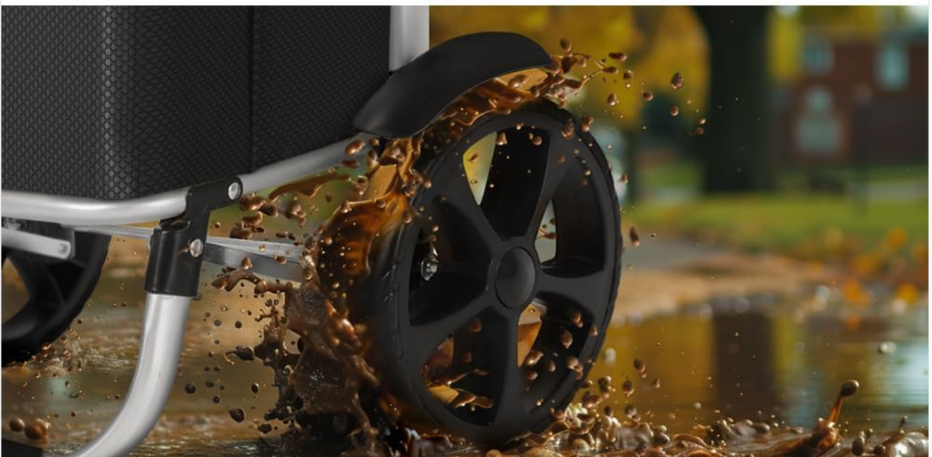
Image: The cart's wheels are shown handling stairs and wet conditions, illustrating their robust design and the function of the mudguards.