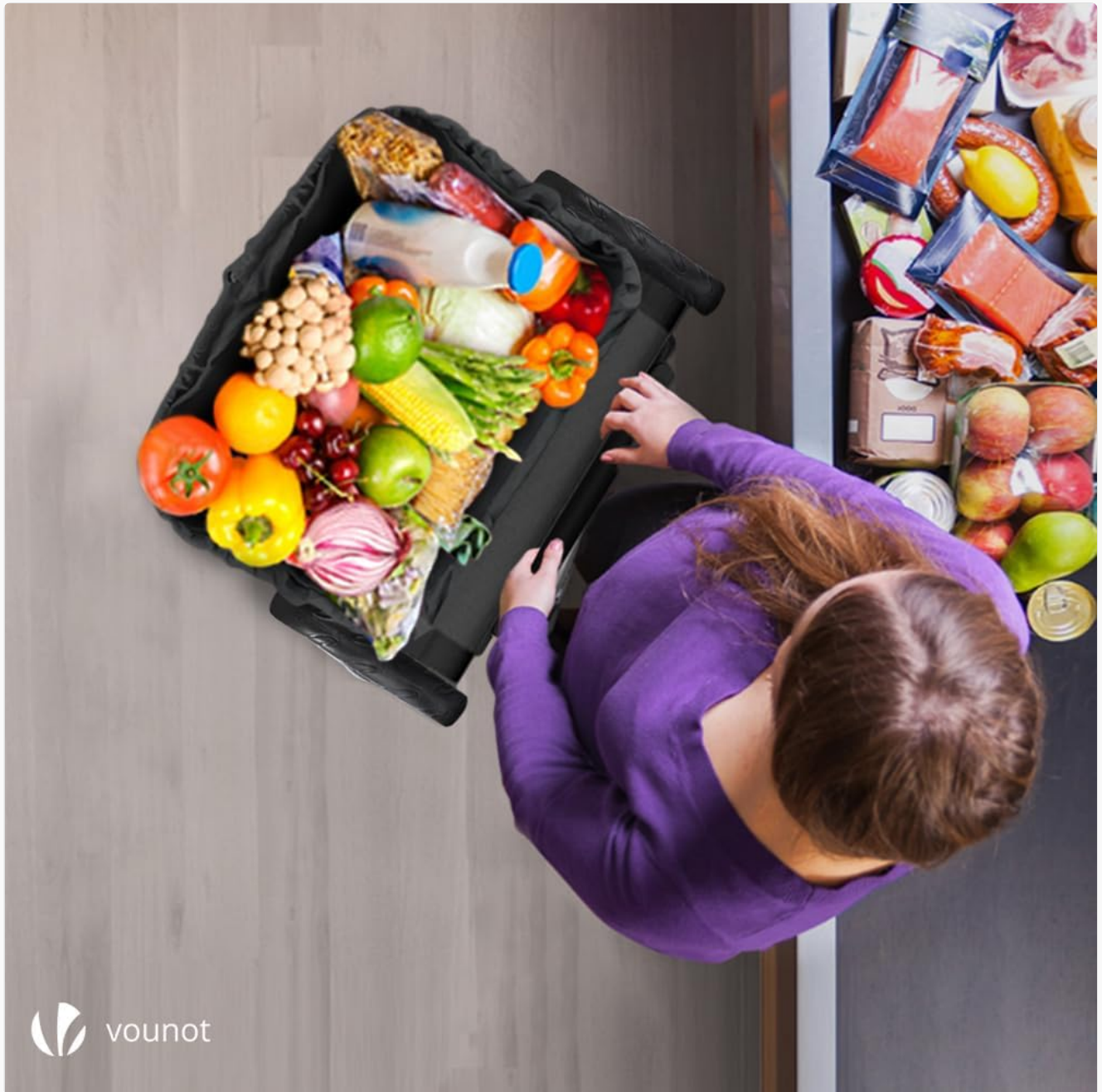
Image: An overhead view of the cart demonstrating its capacity when filled with groceries.