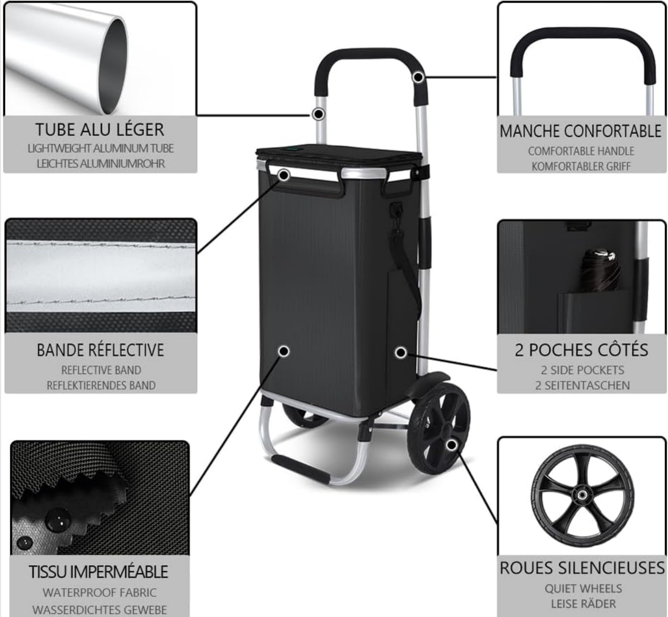
Image: Detailed diagram highlighting key features such as the aluminum frame, comfortable handle, reflective strips, side pockets, quiet wheels, and waterproof fabric.