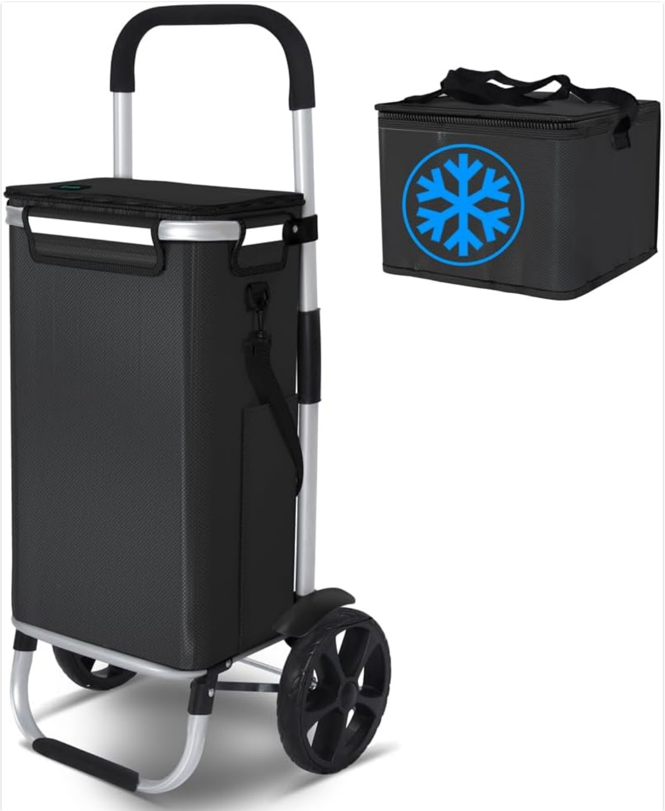
Image: The VOUNOT 2-Wheel Aluminum Folding Shopping Cart with its separate insulated bag.