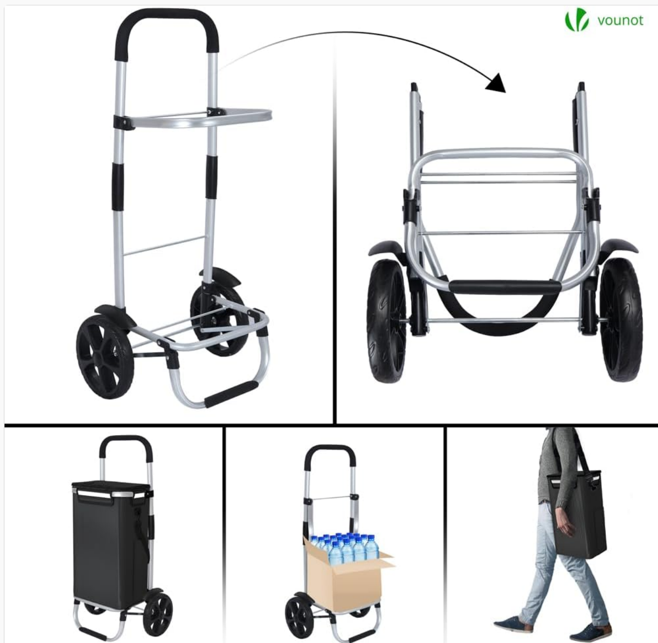
Image: Visual guide showing the cart's folding mechanism and its versatility as a shopping cart, utility cart, and the bag used independently.