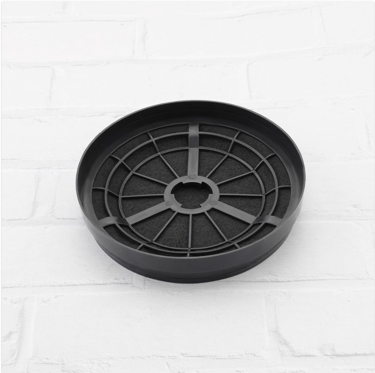
Image 7.1: Bottom view of the filter, illustrating its structure for proper air flow and charcoal containment.