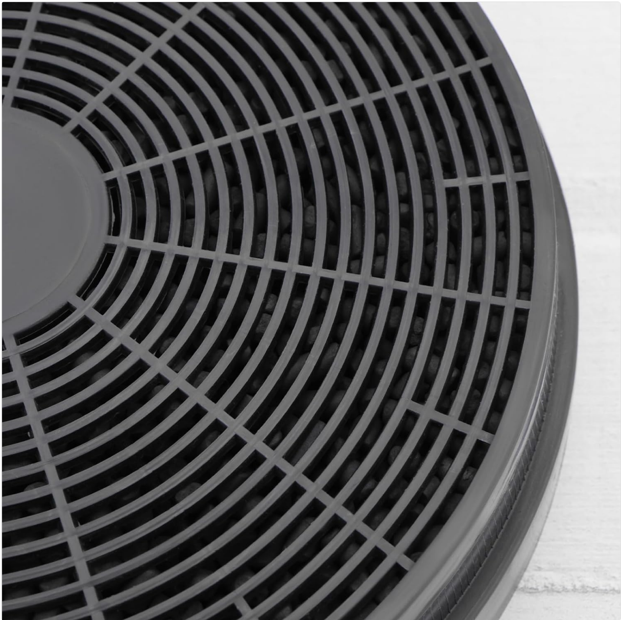
Image 6.1: Close-up of the activated charcoal material responsible for odor absorption.