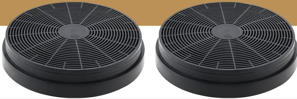
Image 3.1: Two carbon charcoal vent filters included in the package.