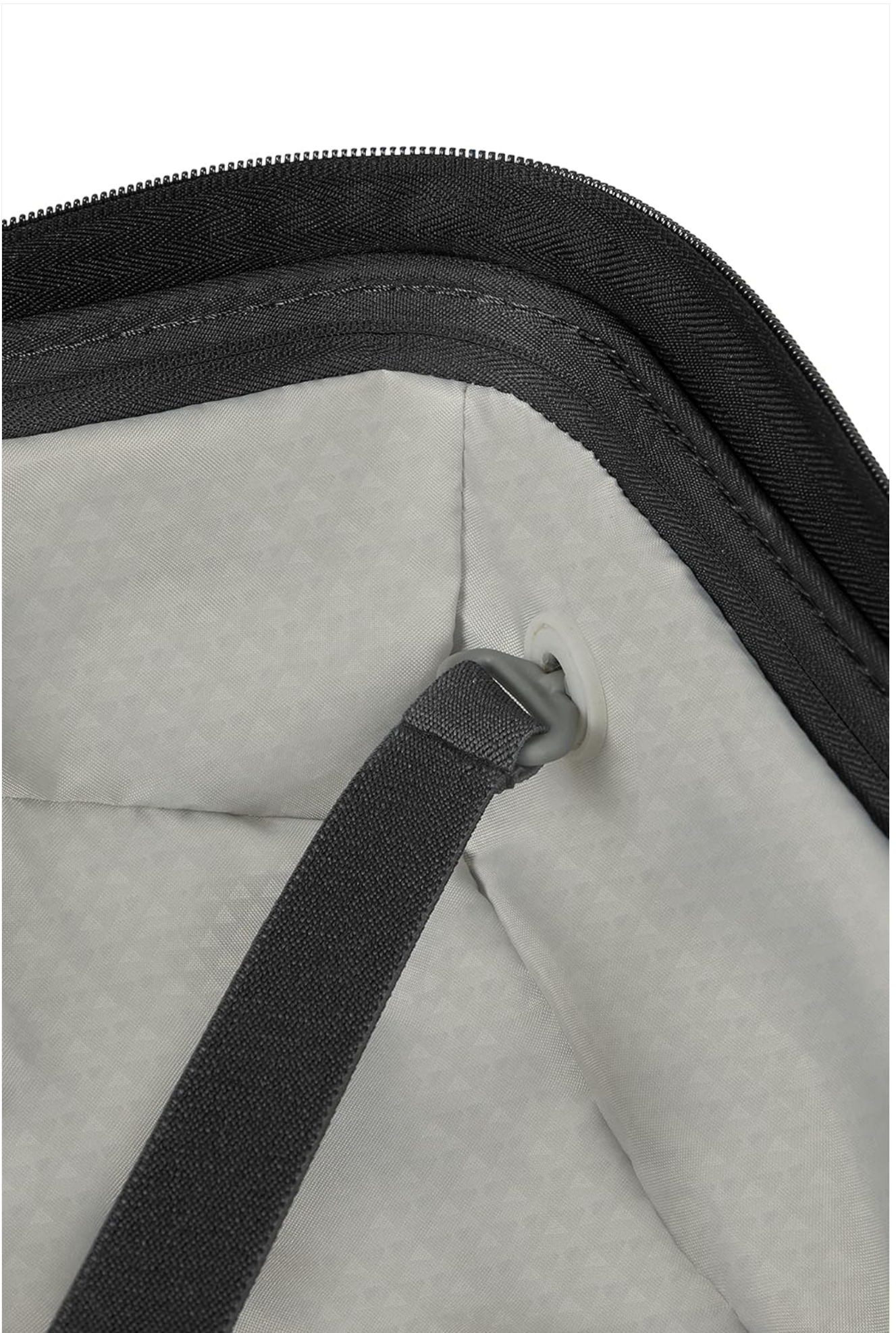
Figure 6: Interior pocket for small items.