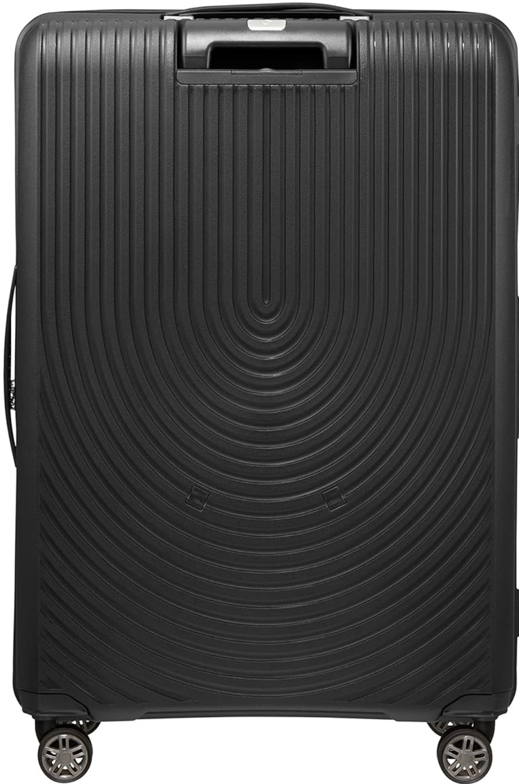
Figure 2: Detail of the shock-absorbing spinner wheels.