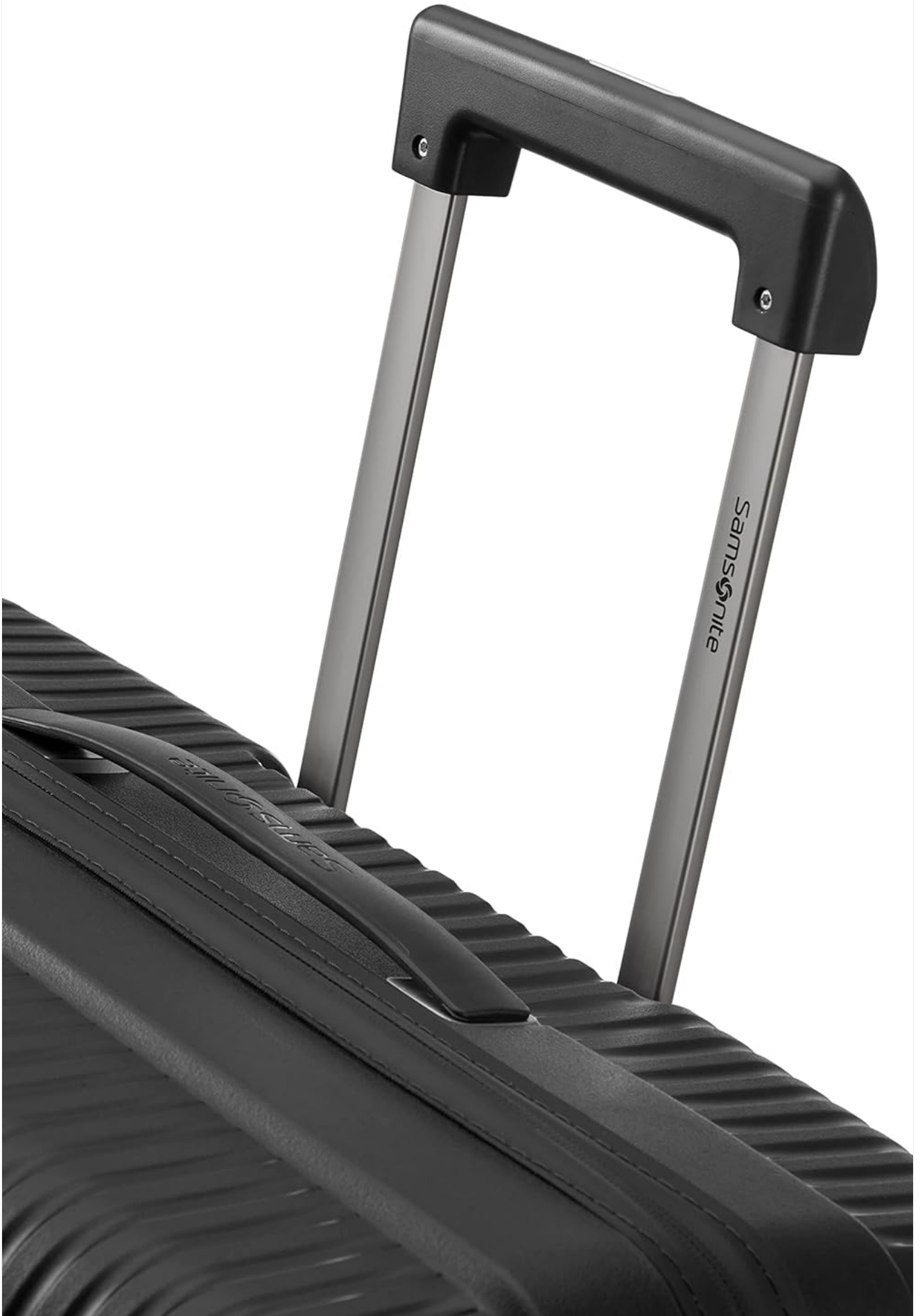
Figure 7: Dimensions of the 75 cm Check-in Trolley Bag.