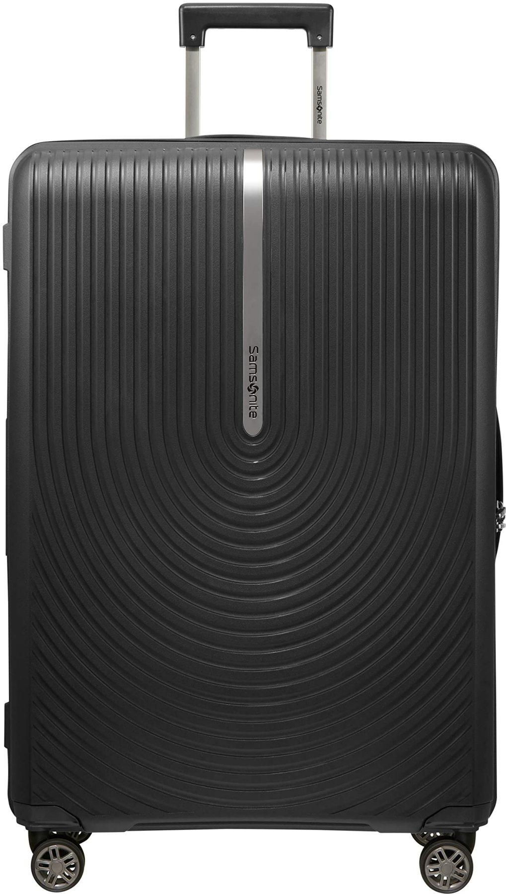
Figure 1: Front view of the Samsonite Hi-Fi 75 cm Check-in Trolley Bag.