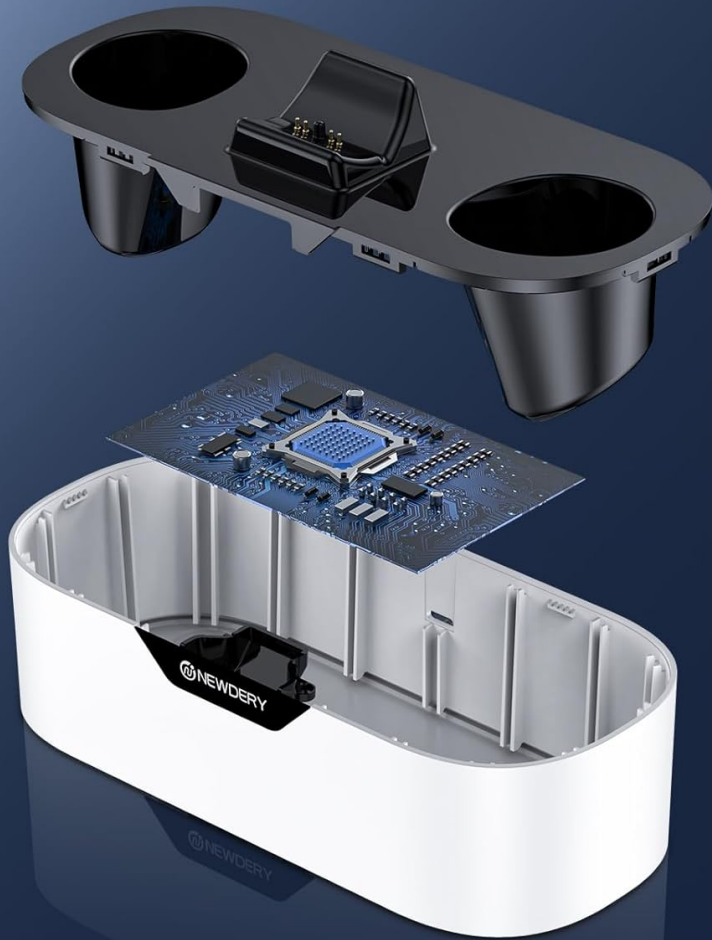
Image: Internal view highlighting the multi-protection system.