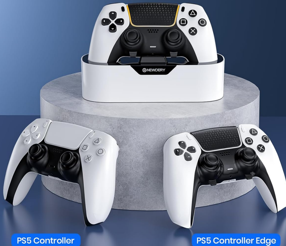
Image: The charging station is compatible with both standard PS5 and DualSense Edge controllers.