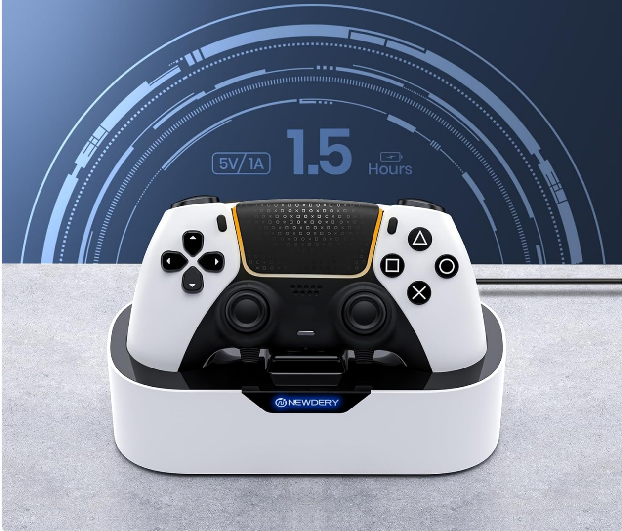
Image: Illustration of the fast charging capability, fully charging in 1.5 hours.