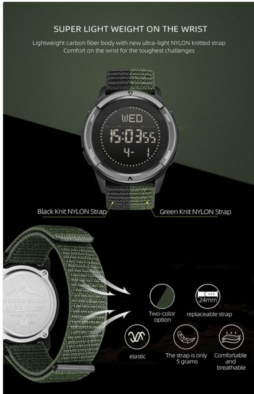
Figure 3: Details of the watch strap. This image highlights that the strap is elastic, weighs only 5 grams, is comfortable and breathable, and is replaceable with a 24mm width. It also shows options for black and green knit nylon straps.

The watch features an elastic ultra-light nylon knitted strap designed for comfort. Adjust the strap to fit snugly but comfortably around your wrist. The strap is replaceable and has a width of 24mm.