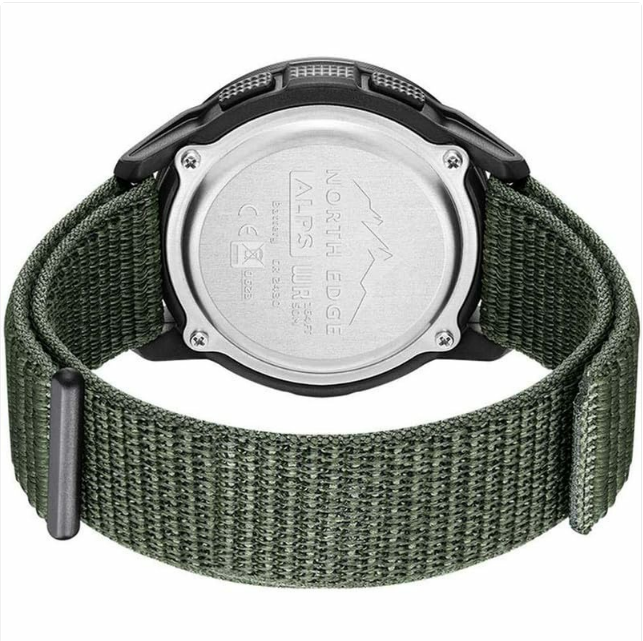
Figure 2: Back view of the North Edge ALPS watch. The stainless steel case back is visible, engraved with "NORTH EDGE", "ALPS WRISTWATCH", "BATTERY CR2430", and regulatory marks. The green nylon strap is also clearly visible.