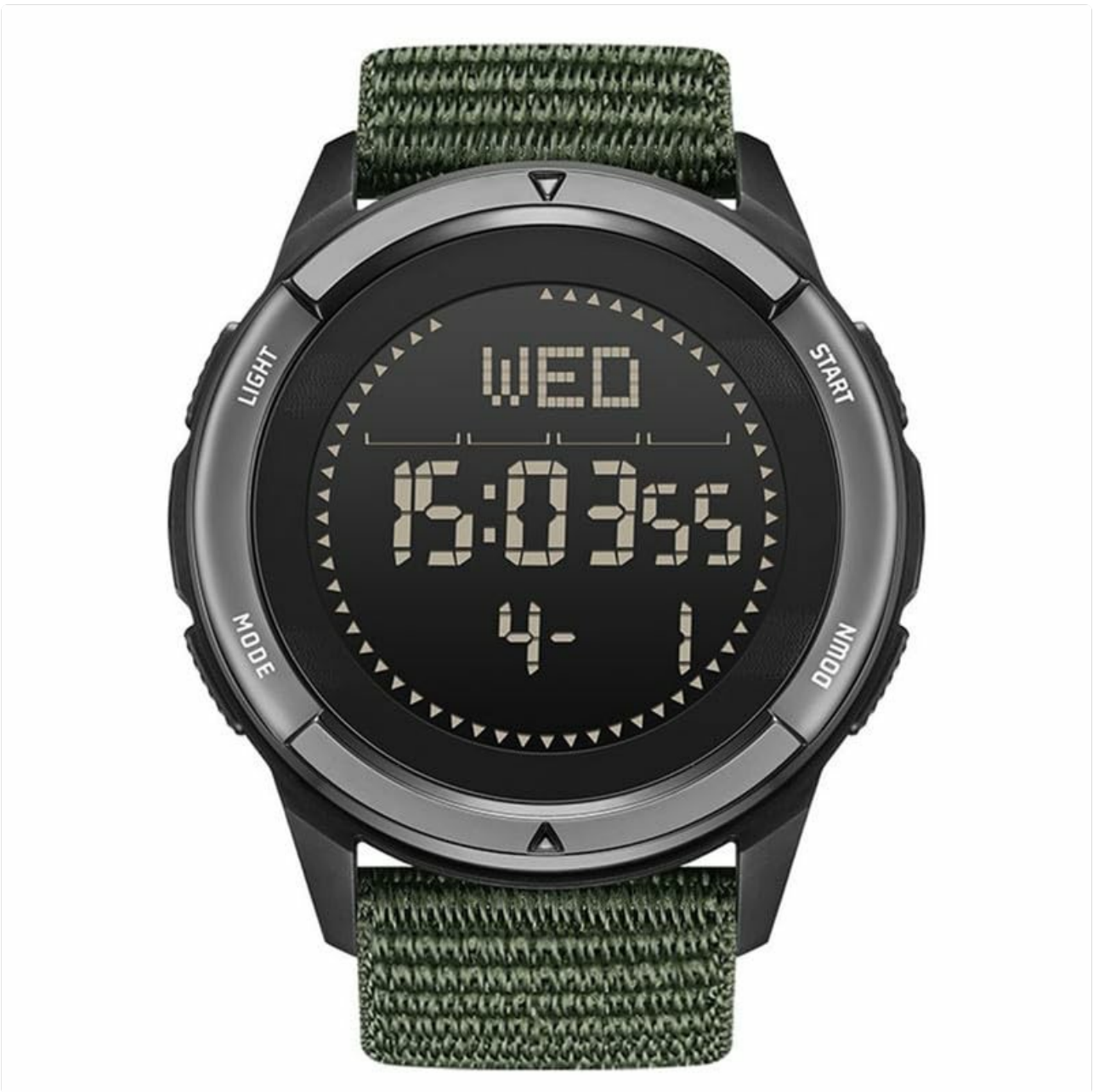
Figure 1: Front view of the North Edge ALPS watch. This image shows the watch face with the digital display, indicating the day of the week, time, and date. The watch has a black case and a green woven nylon strap. Buttons are visible on both sides of the watch case, labeled "LIGHT", "MODE", "START", and "DOWN".