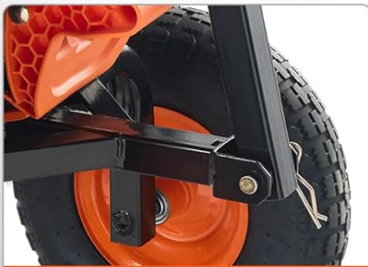
Enhanced Welding Joint