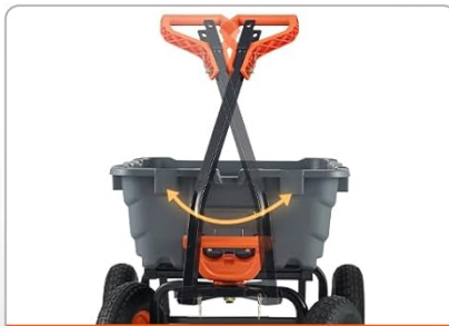
Flexible Directional Adjustment