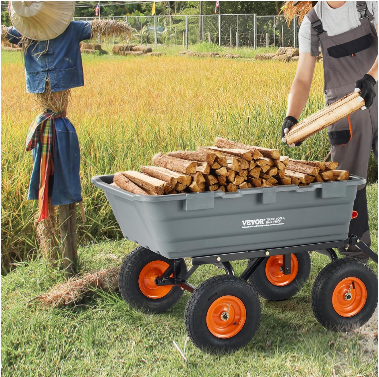
Image 3: A user loading wood into the VEVOR dump cart, demonstrating its practical use in a garden or yard.

Load materials evenly into the poly bed, ensuring the weight is distributed to prevent imbalance. Do not exceed the 1200 lbs (544 kg) capacity or 6.48 cu.ft volume. For loose materials, the included mesh cover can be used to secure the load during transport.