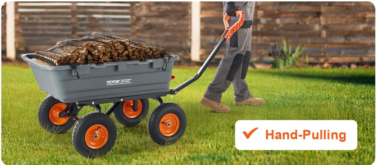
Image 5: The versatile handle shown in both hand-pulling and towing configurations, for manual or vehicle attachment.