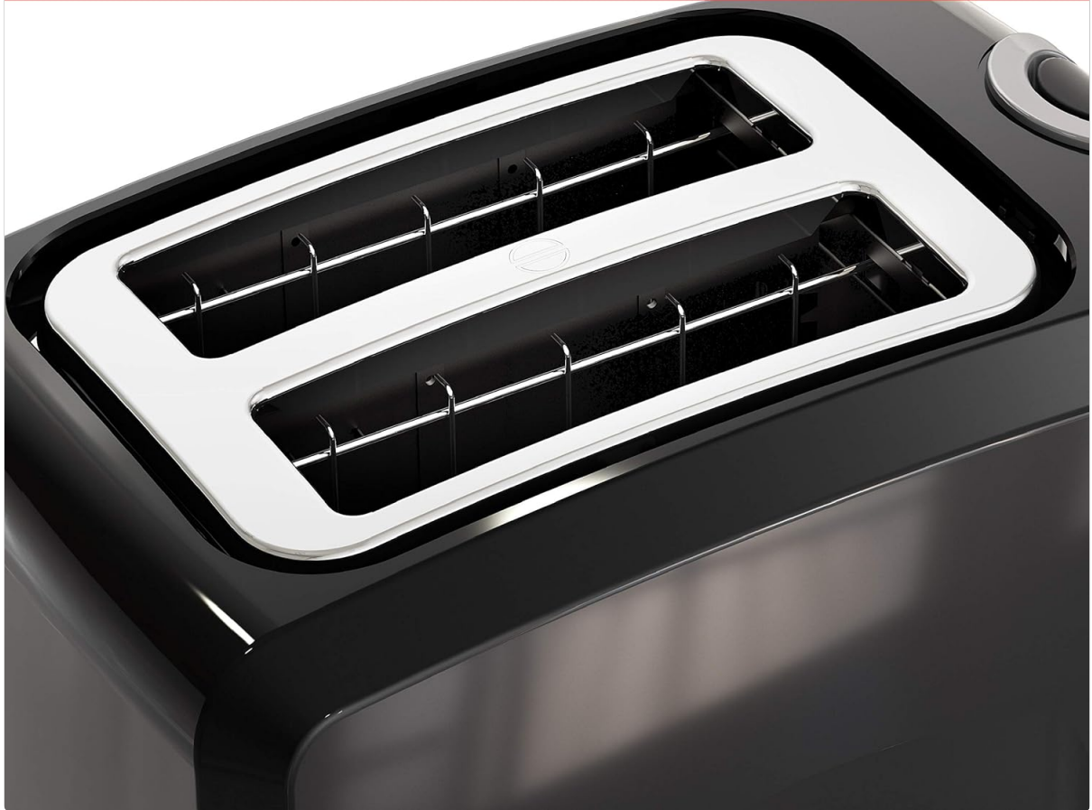
Image: Detailed view of the extra-wide toasting slots on the BLACK+DECKER 2-Slice Toaster, designed to accommodate thick bread and bagels.