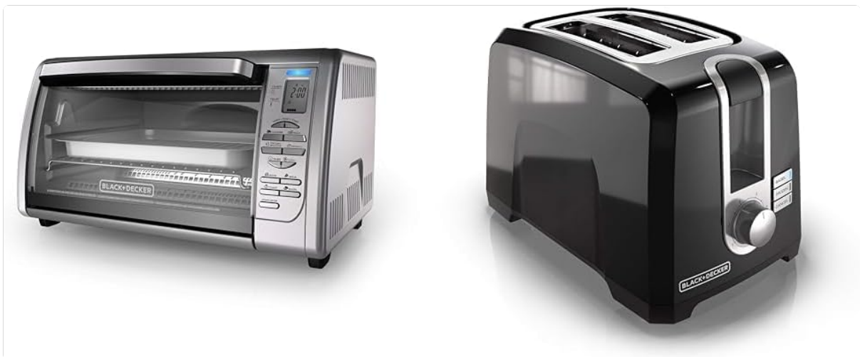
Image: The complete BLACK+DECKER 6-Slice Convection Toaster Oven and 2-Slice Toaster Bundle.