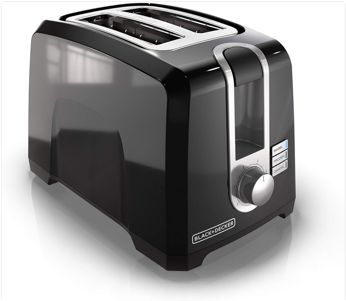
Image: Front view of the BLACK+DECKER 2-Slice Toaster with wide slots.