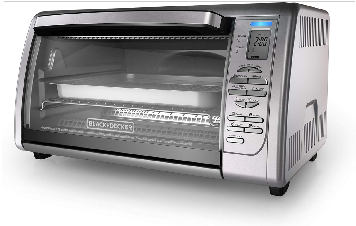
Image: Front view of the BLACK+DECKER 6-Slice Convection Toaster Oven.

The convection toaster oven offers multiple cooking functions. Familiarize yourself with the control knobs for temperature, function, and timer.