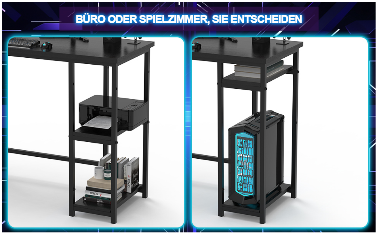
Image 8.1: Close-up of the desk's integrated storage solutions, including the CPU stand, two-tier shelves, and a fabric drawer for organization.