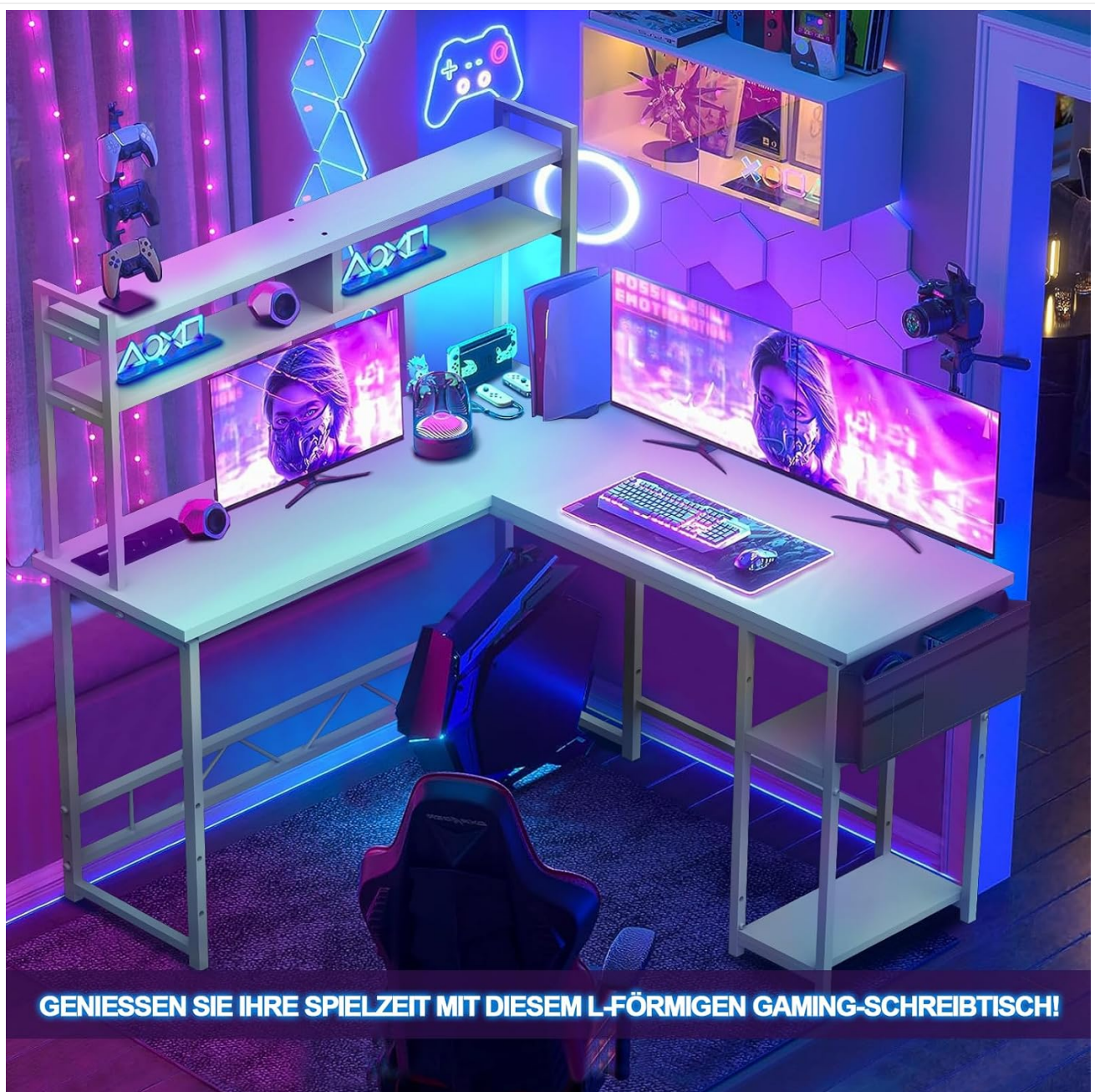
Image 4.1: The fully assembled Devoko L-Shaped Gaming Desk, showcasing its design and functionality in a typical use environment.