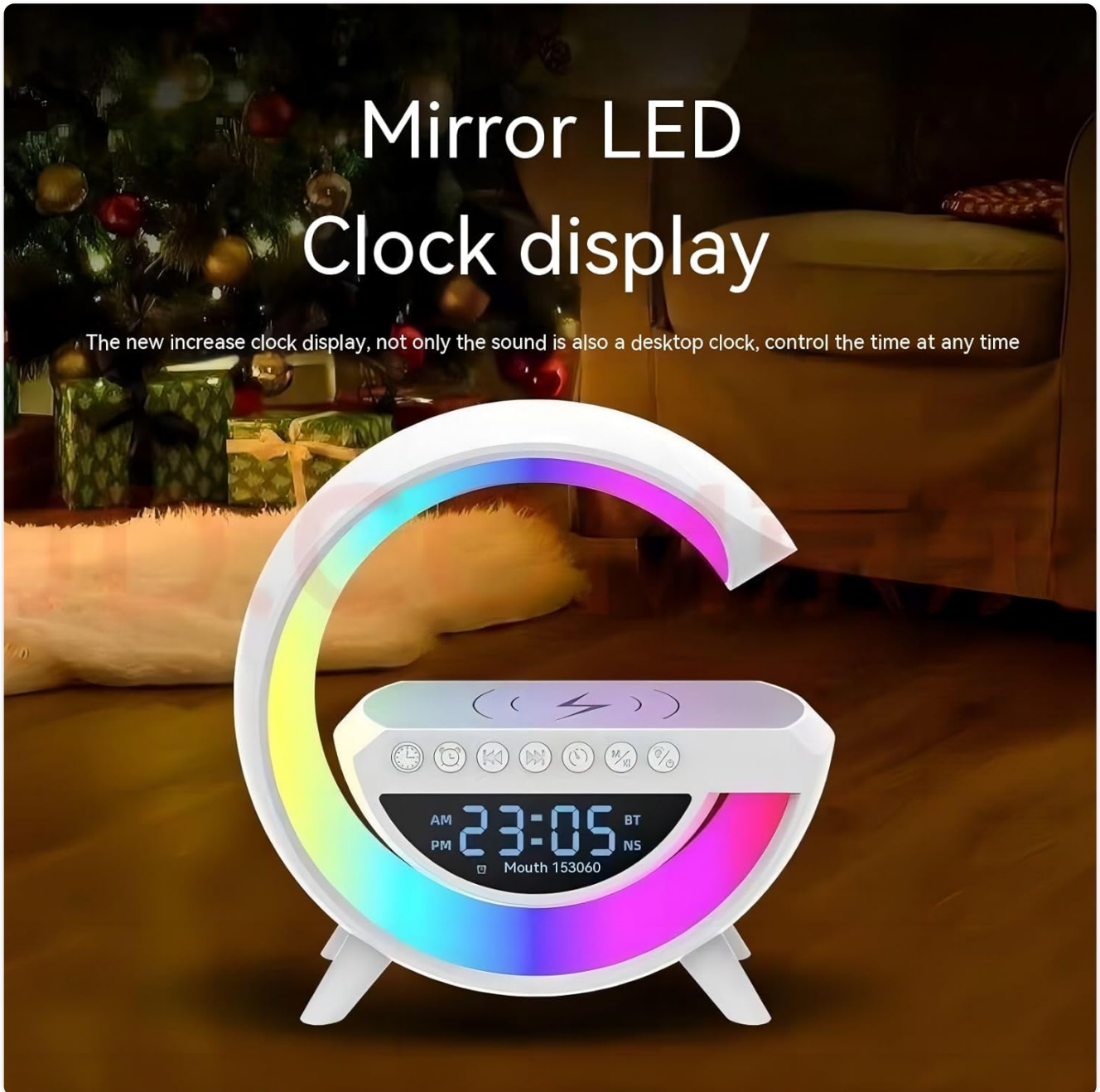
Figure 6: Close-up of the mirror LED clock display, showing the time and various indicators.

The digital display shows the current time and date, and an alarm function is available.