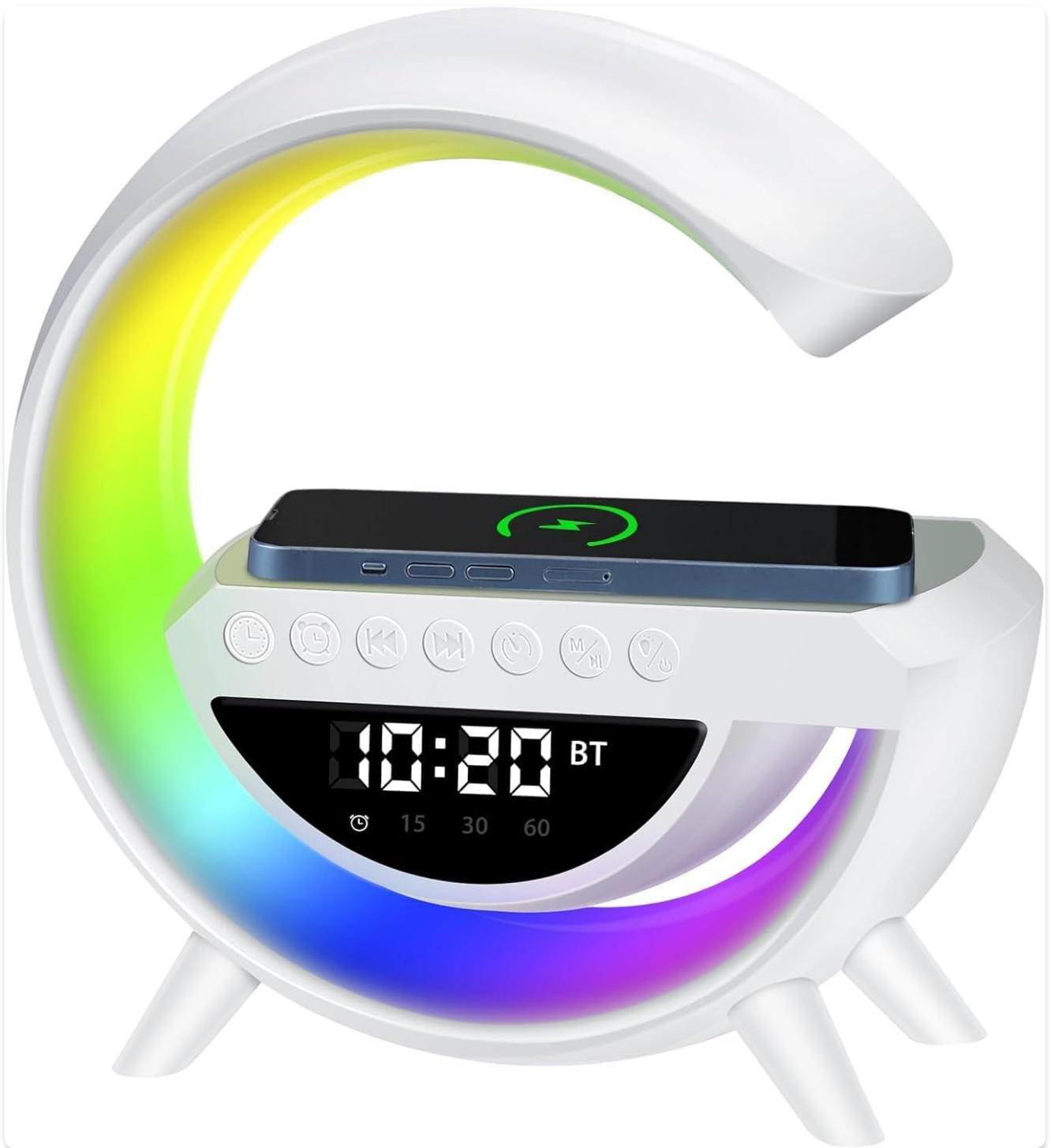
Figure 1: Dewould G-Type Wireless Charging Speaker and LED Desk Lamp, showcasing its unique G-shaped design with integrated LED lighting and a top wireless charging pad.