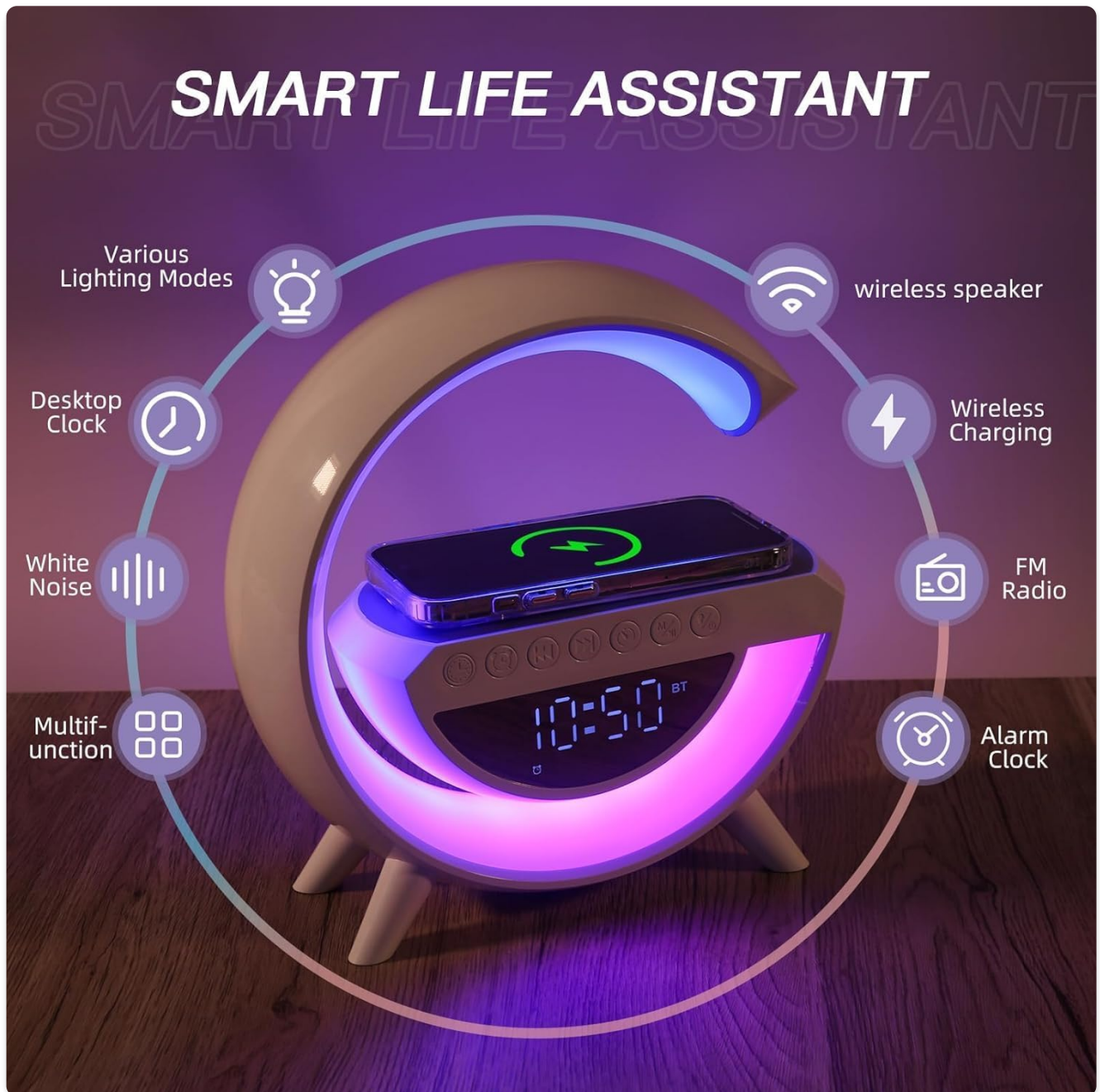
Figure 2: Overview of the G-Type lamp's smart features, including various lighting modes, desktop clock, white noise, wireless speaker, wireless charging, FM radio, and alarm clock.