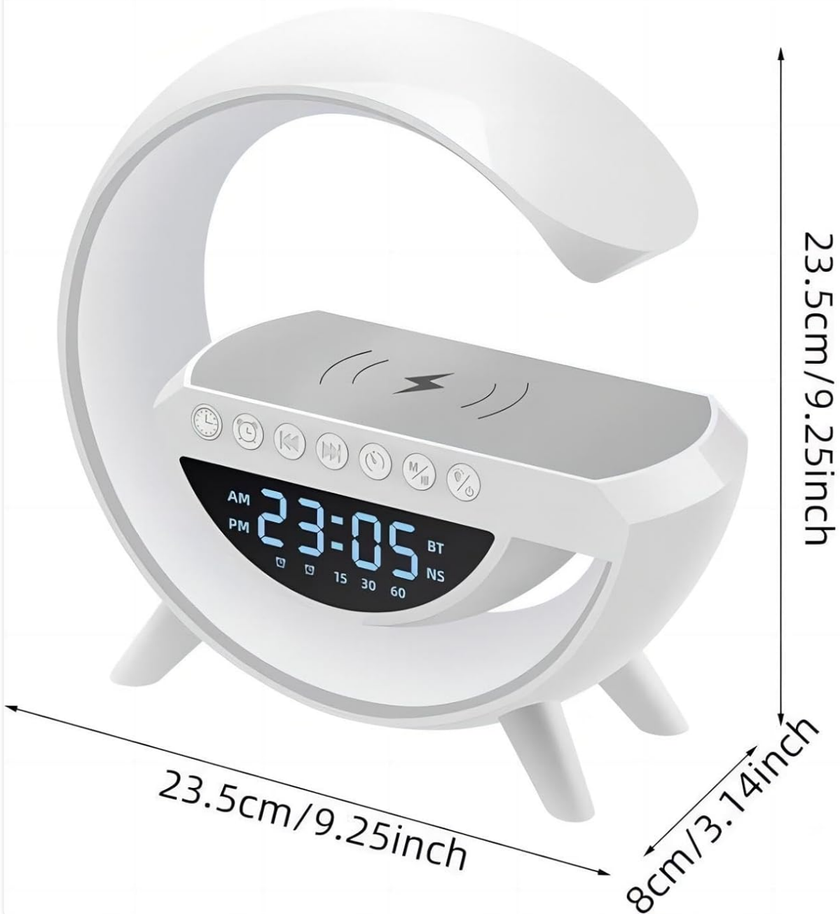
Figure 7: Diagram illustrating the product dimensions: 23.5cm/9.25 inches in height and length, and 8cm/3.14 inches in width.