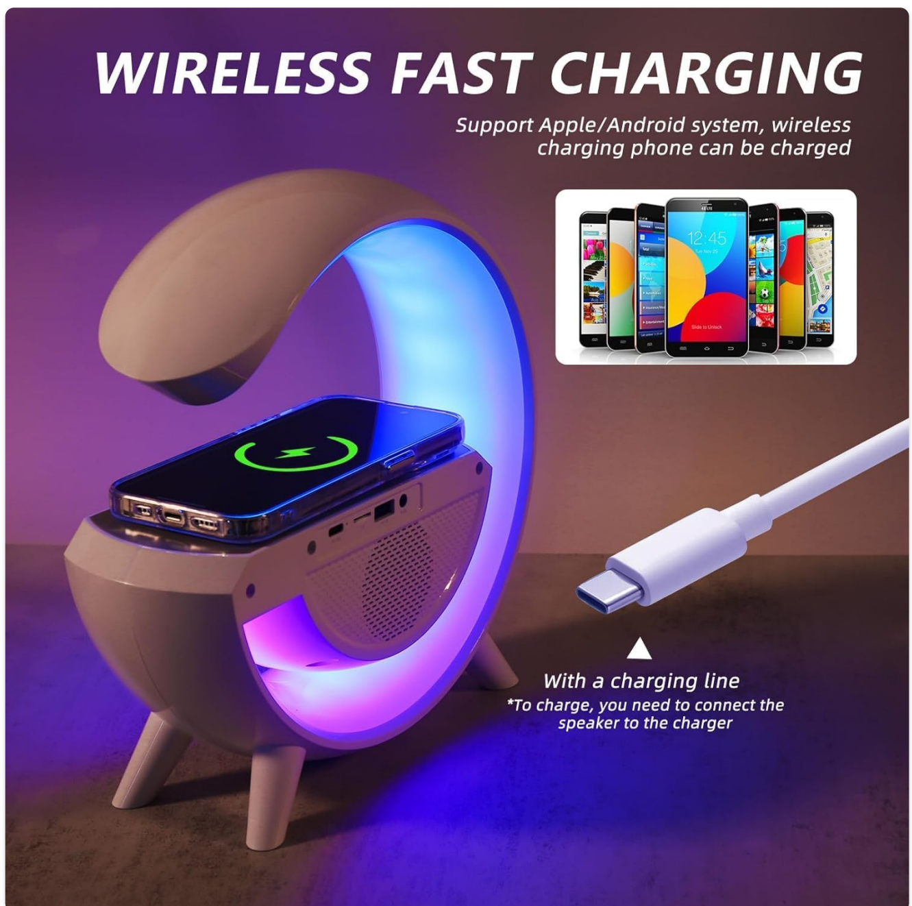
Figure 4: Illustration of the wireless fast charging function, showing a smartphone placed on the charging pad and a USB-C cable for connecting the speaker to power.