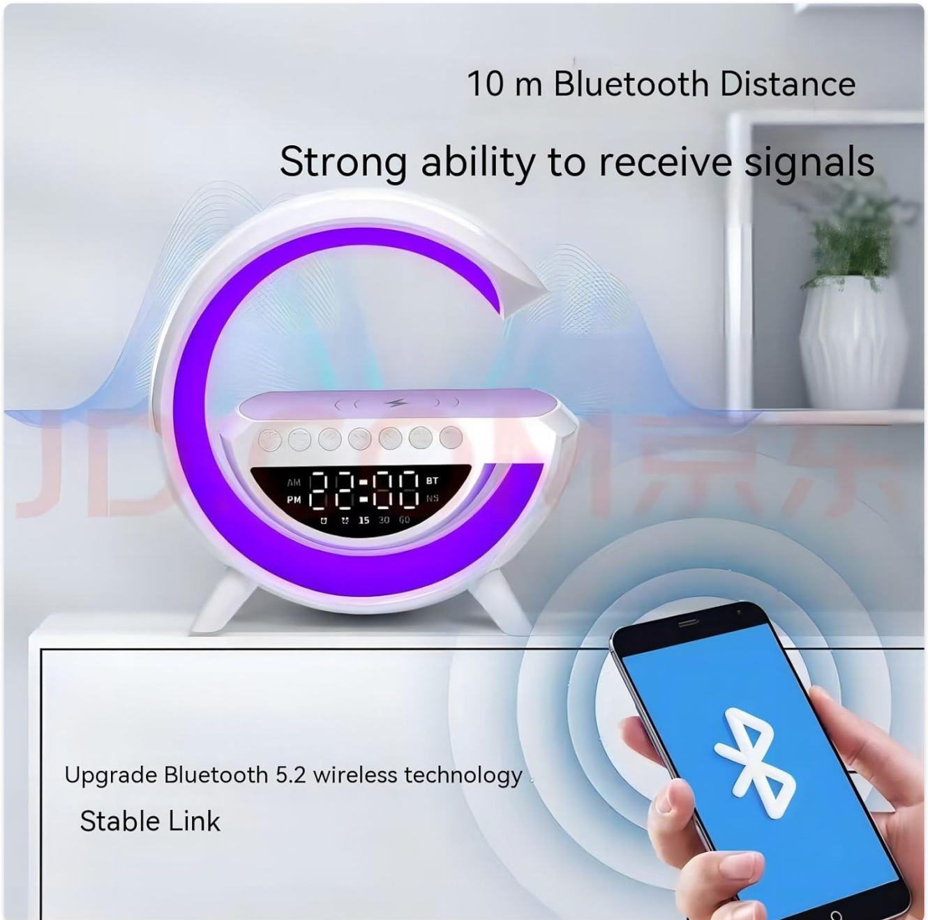
Figure 5: Depiction of the 10-meter Bluetooth distance and stable signal reception, showing a smartphone connecting to the G-Type lamp.