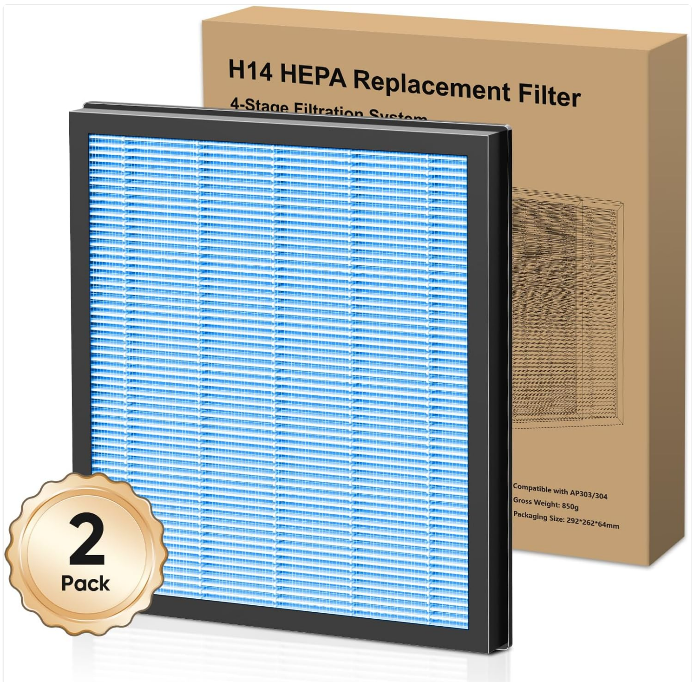
Image: The DAYETTE AP303/304/305/405 Replacement H14 HEPA Air Purifier Filter, shown with its packaging, indicating it is a 2-pack.