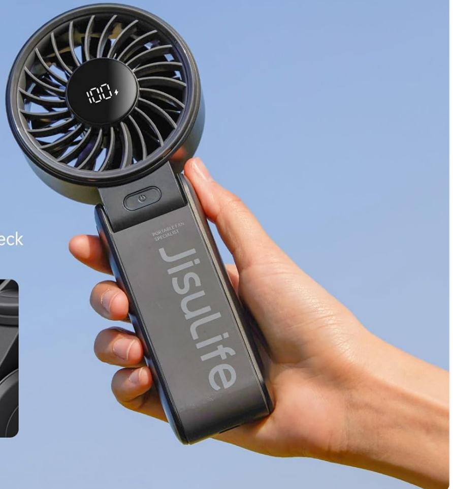
Image: A close-up of the JISULIFE Life7 Handheld Fan's visual LED screen, showing the battery percentage and speed level, with an inset demonstrating how to double-click to check the remaining battery.