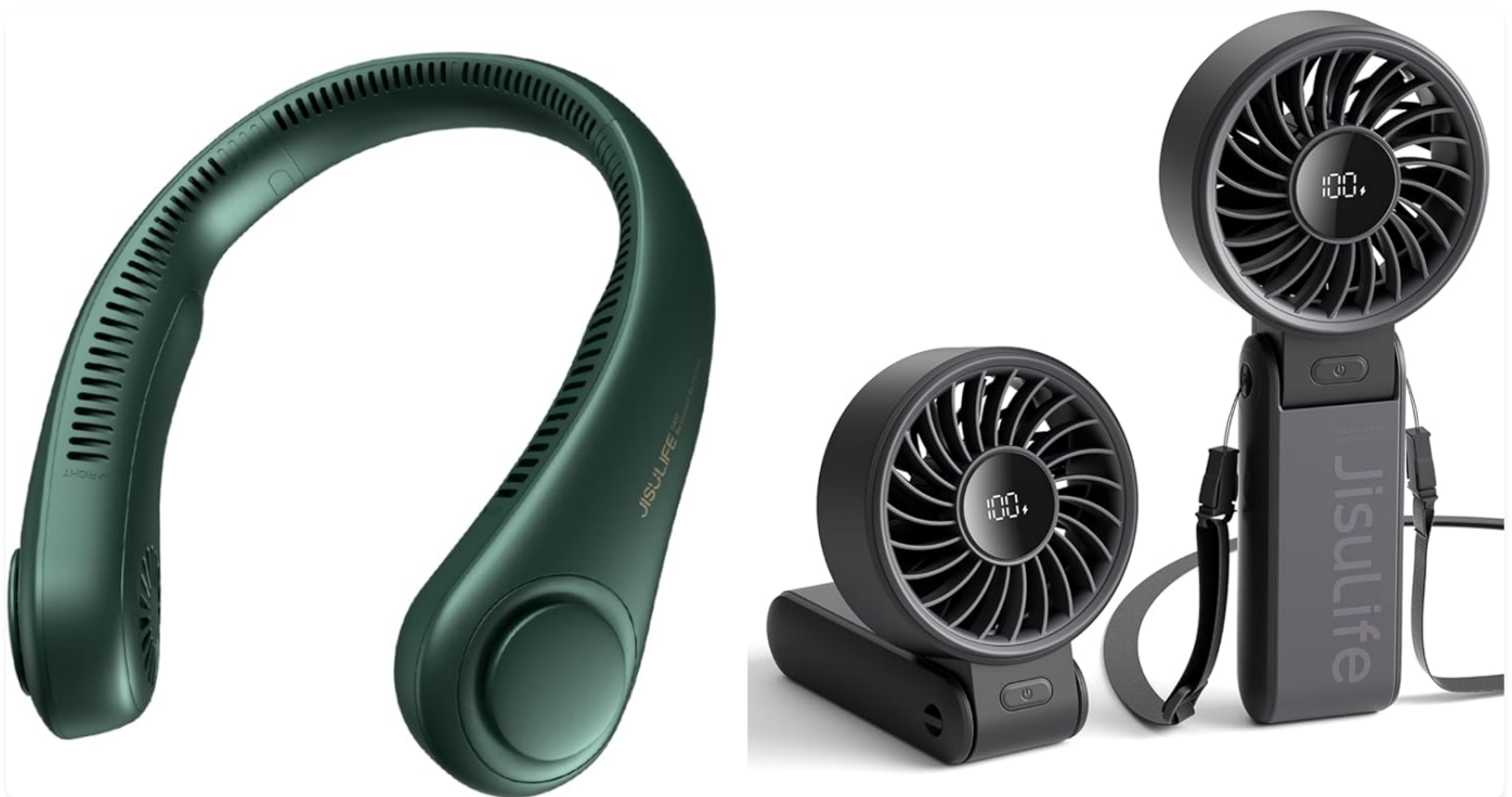
Image: The JISULIFE FA14 Neck Fan (left) and the JISULIFE Life7 Handheld Fan (right), showcasing both products included in the package.

Thank you for choosing the JISULIFE FA14 Hands-Free Neck Fan and the JISULIFE Life7 3-IN-1 Handheld Fan. This comprehensive user manual provides detailed instructions for the safe and efficient operation, maintenance, and troubleshooting of both devices. Please read this manual thoroughly before use and retain it for future reference.