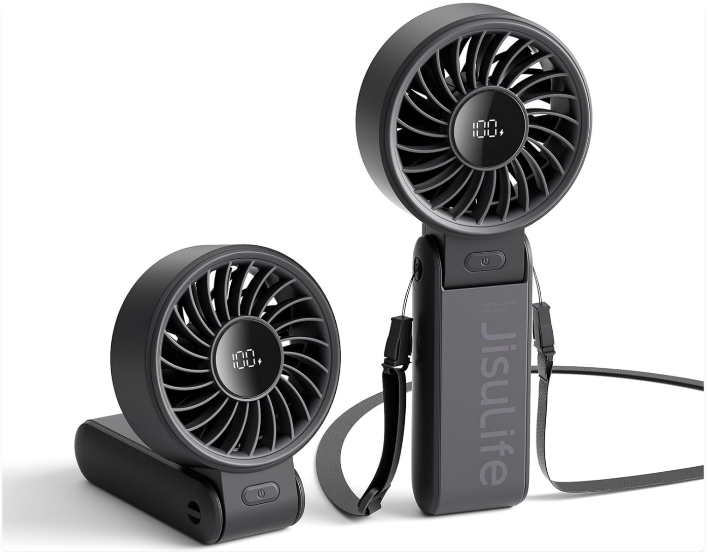
Image: The JISULIFE Life7 Handheld Fan shown in its compact, folded desk fan mode (left) and its extended handheld fan mode (right), demonstrating its versatility.