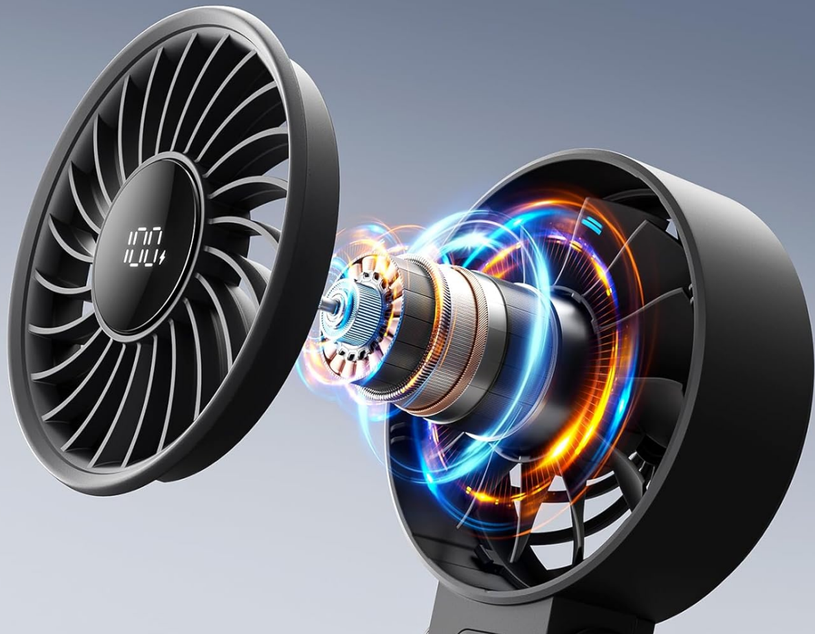
Image: An illustration of the JISULIFE Life7 Handheld Fan's internal components, highlighting its 12 fan blades and upgraded brushless motor for super strong wind.

12 fan blades & upgraded brushless motor, stay cool and refreshed wherever you go!