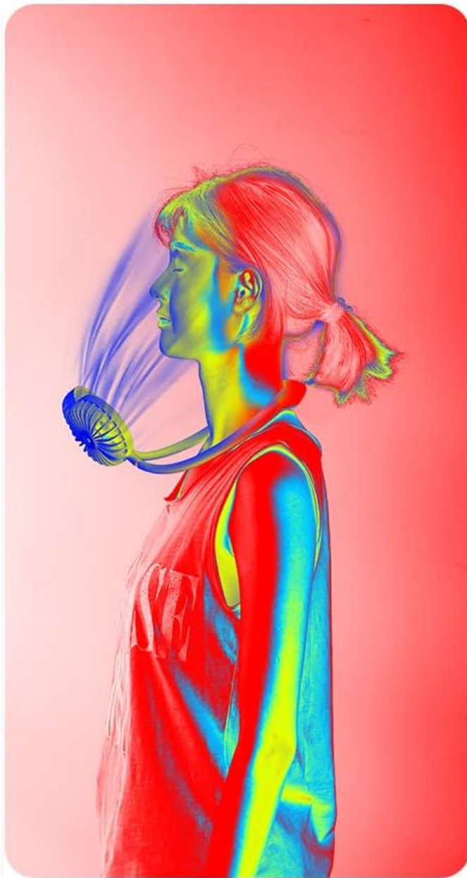
Tradition Neck Fan uneven cooling, blowing directly