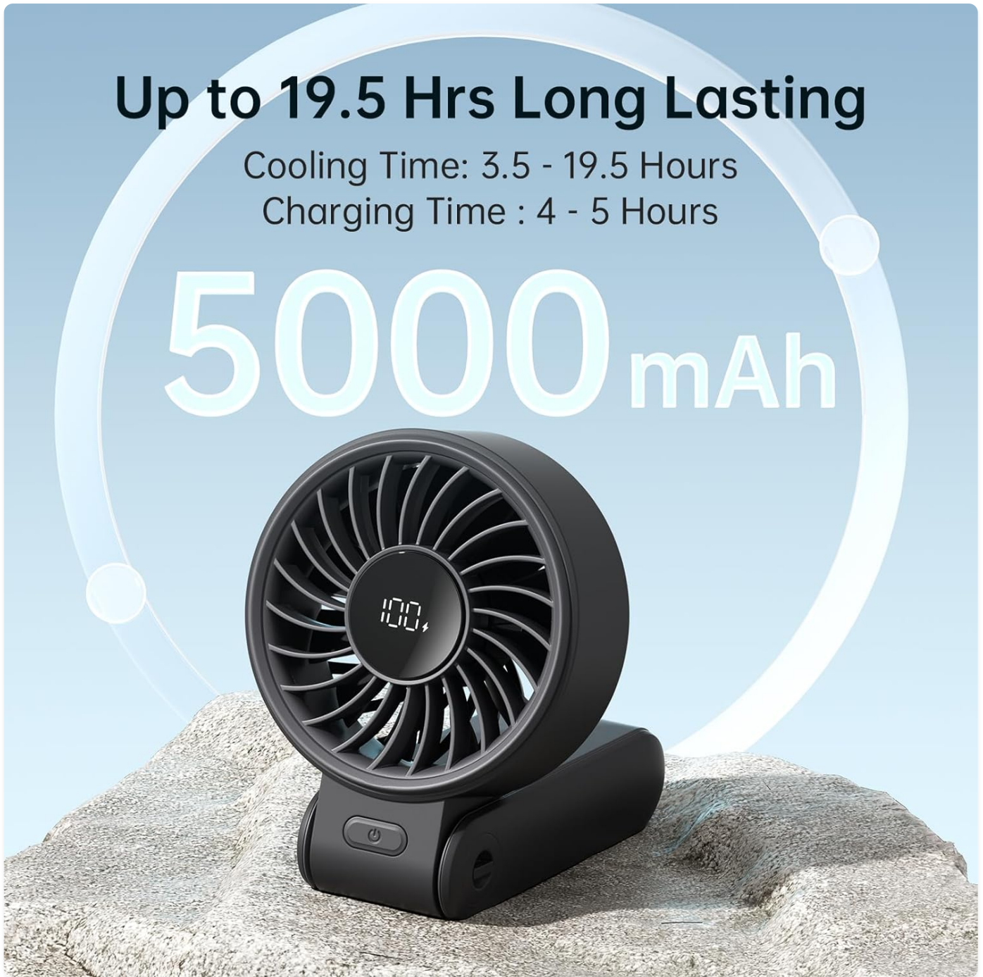
Image: The JISULIFE Life7 Handheld Fan with an overlay indicating its 5000mAh battery capacity, providing up to 19.5 hours of cooling time and requiring 4-5 hours for charging.

5. Once fully charged, disconnect the charging cable.