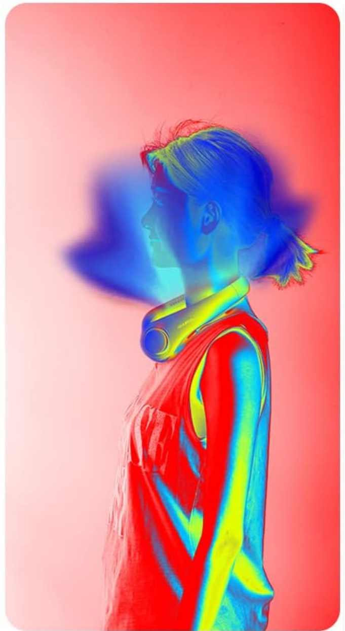
Our Turbon Fan surroundly cooling, soft wind.

Image: A thermal comparison illustrating the difference between a traditional neck fan (left, uneven cooling) and the JISULIFE FA14 Turbon Fan (right, surround cooling with soft wind).