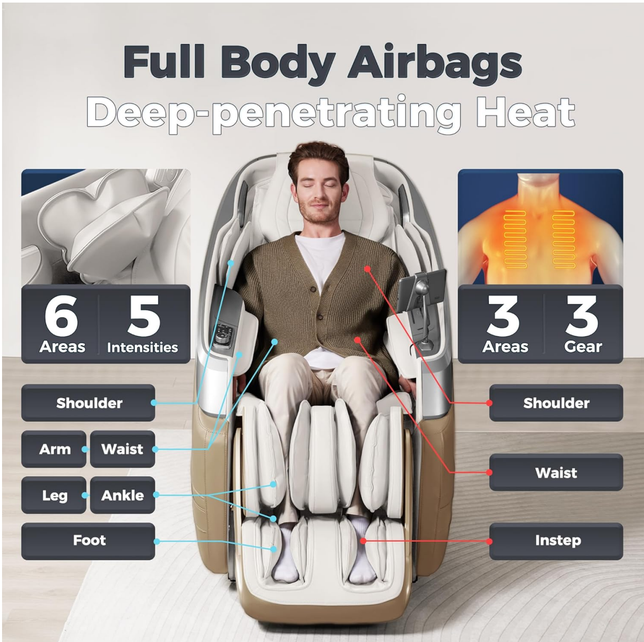
Figure 4: Full Body Airbags and Heat Zones

The chair features a dual-layer airbag system with 30 airbags covering shoulders, arms, waist, legs, feet, and ankles, providing alternating kneading pressure. Deep-penetrating heat is available in 3 areas (shoulder, waist, instep) with 3 gear settings.