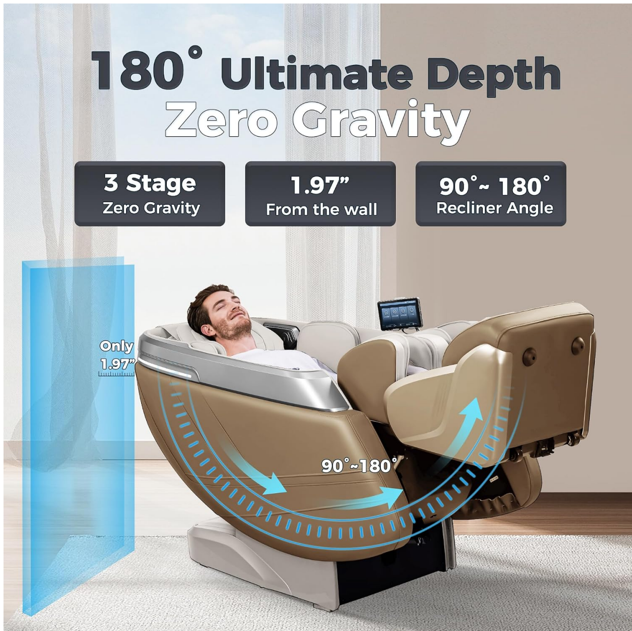
Figure 3: Zero Gravity Positions

Experience weightlessness with 3 adjustable zero gravity positions, allowing your body to fully relax and reduce burden on the spine. The chair can recline up to 180°.