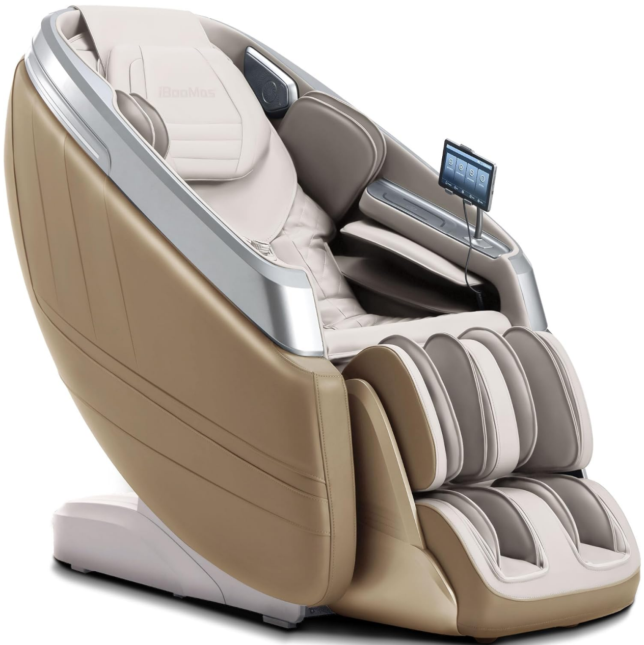
Figure 1: iBooMas P03 4D Zero Gravity Massage Chair (Beige)