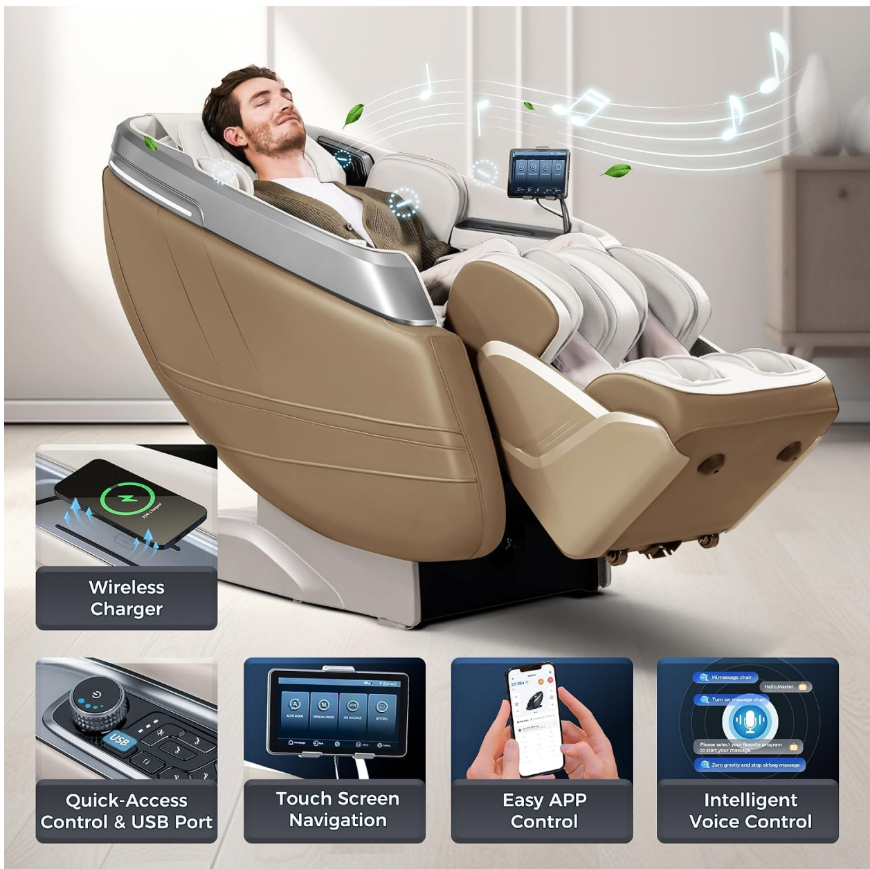
Figure 2: Multiple Control Methods